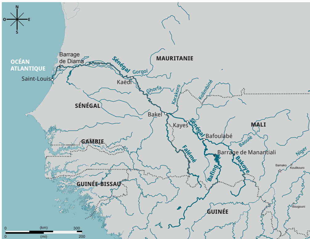
Figure 2: The geographical space of the Senegal River.

The Senegal River estuary is confined to a small area between the Diama dam and the Langue de Barbarie sandbar. Before the Diama dam was impounded (1986), the saline rise was noticeable, during low-water periods, as far as Podor, about 300 km from the mouth. The Senegal estuary is limited today, upstream, by the Diama anti-salt dam, provided its gates remain closed; and downstream, by its mouth, an outlet through which marine waters flow back into the river. The Senegal River estuary belongs to the category of microtidal lagoon estuaries closed by a sandy spit. The Langue de Barbarie is oriented north-south and stretches for nearly 40 km over a width varying from 200 to 400 m. The swell plays a fundamental role in the coastline's morphology. The Senegalese-Mauritanian coastline, as far as the Cape Verde peninsula, is classified as a high-energy swell coast. North-western swells provide a significant sand transport that contributes to the propagation of the Langue de Barbarie (Figure 3).