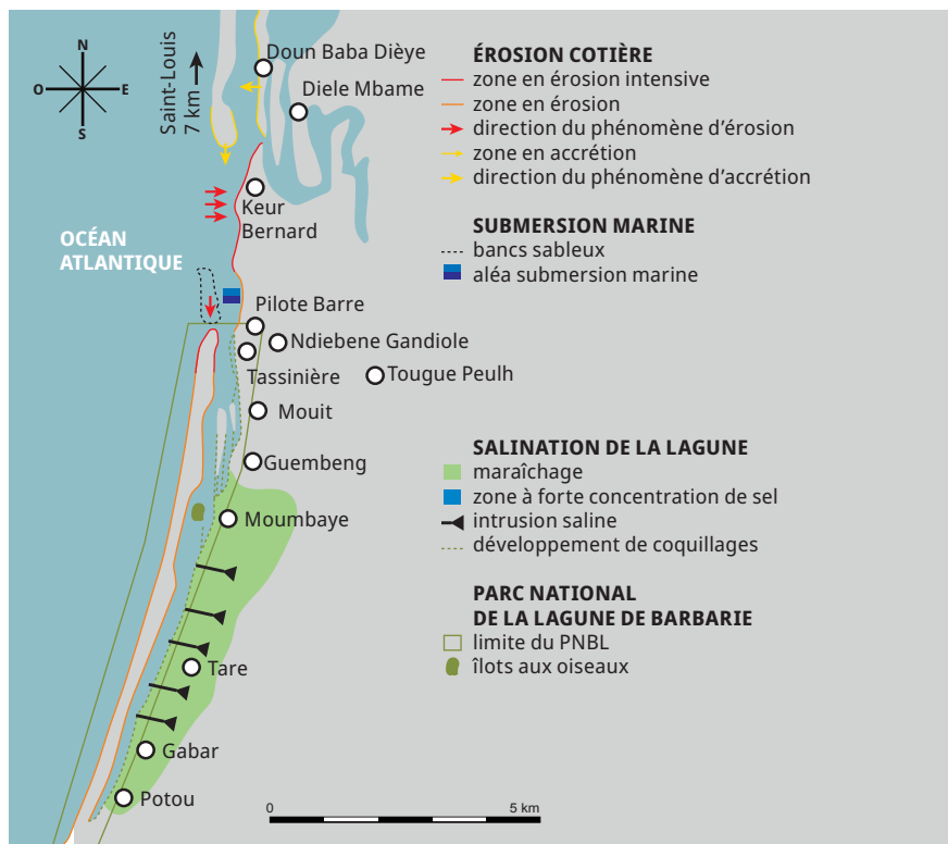
Figure 3: Gandiol: a hazard-prone territory.

Natural breaks in the barrier beach have marked the evolution of the Langu de Barbarie (LB) from 1850 until recently, with 24 breaks between 1850 and 1980 (Sall, 2006). At that time, it seems to go along a cycle evaluated at between 11 and 14 years. The most important breaches since 1900 (1906, 1923, 1936, 1948, 1959 and 1973) have always occurred south of the city of Saint-Louis (Diop, 2004). They have kept the river mouth very distinctly south of the city for more than half a century and had an important role in the risk of flooding. For a time, they could mitigate the impact of floods on the city by encouraging a more rapid evacuation of the river water towards the ocean until the breach was closed (by the combined contributions of the littoral drift and the river) and the southward progression resumed. No natural rupture has occurred since 1973. This can be explained by a combination of two factors: i) an absence of major floods between the 1950s and 1990s, associated with a “climatic downturn”; ii) a reduction in the “flushing effect” of floods since the construction of the Diama dam in 1986, which allows for some regulation of flows (Kane, 2002; Sy et al. , 2013; Ba, 2013). The artificial opening of the Langu de Barbarie in 2003 in response to a critical hydraulic situation (repeated flooding) is a singular event that needs to be understood in all its complexity in order to grasp its possible “disruptive” potential.