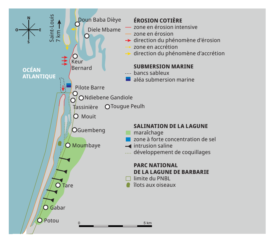
Figure 3: Gandiol: a hazard-prone territory.

Natural breaks in the barrier beach have marked the evolution of the Langue de Barbarie (LB) from 1850 until recently, with 24 breaks between 1850 and 1980 (Sall, 2006). At that time, it seems to go along a cycle evaluated at between 11 and 14 years. The most important breaches since 1900 (1906, 1923, 1936, 1948, 1959 and 1973) have always occurred south of the city of Saint-Louis (Diop, 2004). They have kept the river mouth very distinctly south of the city for more than half a century and had an important role in the risk of flooding. For a time, they could mitigate the impact of floods on the city by encouraging a more rapid evacuation of the river water towards the ocean until the breach was closed (by the combined contributions of the littoral drift and the river) and the southward progression resumed. No natural rupture has occurred since 1973. This can be explained by a combination of two factors: i) an absence of major floods between the 1950s and 1990s, associated with a "climatic downturn"; ii) a reduction in the "flushing effect" of floods since the construction of the Diama dam in 1986, which allows for some regulation of flows (Kane, 2002; Sy et al., 2013; Ba, 2013). The artificial opening of the Langue de Barbarie in 2003 in response to a critical hydraulic situation (repeated flooding) is a singular event that needs to be understood in all its complexity in order to grasp its possible "disruptive" potential.