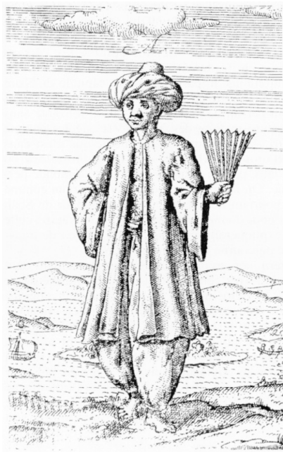
Figure 2. Persian jeweler in Banten, Java, in 1596 (Lodewicksz 1598)

believe them to be Persians.” But, he adds further, they are actually Rajputs (Cortemunde 1953, 138).