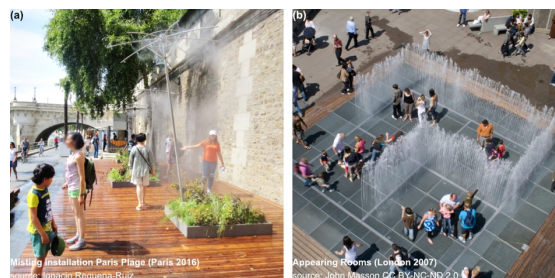
Figure 4. Examples of climatic stage settings: (a) clouds; and (b) pop-ups.

In more general terms, climatic stage settings appear as an urban staging approach to the public space, in which climate effects prevail over material ones. The space becomes the canvas for collective or individual intangible climatic effects that are spontaneously recognizable by citizens.