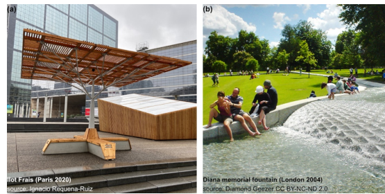
Figure 5. Examples of cooling street furniture: (a) canopies; and (b) platforms.

contributes to the thermal experience of the city with a body-scale climatic approach. Urban cooling techniques integrate street furniture in meeting the challenge of increasing comfort whilst creating a strong identity and a qualitative perception of the public space.