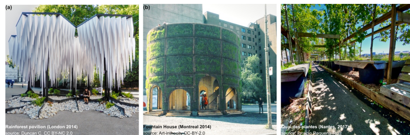
Figure 3. Examples of climatic capsules: (a) tents; (b) vessels; and (c) tunnels.

In more general terms, climatic capsules recall the landscaping perspective of the pavilion or garden “follies” and introduce a climatic dimension to it, sometimes to create pleasant situations, sometimes shelter. This type contributes to the construction of the thermal representation of the city structured in nodes, paths and edges, which enrich to the visual structure of the city (Lynch 1960).