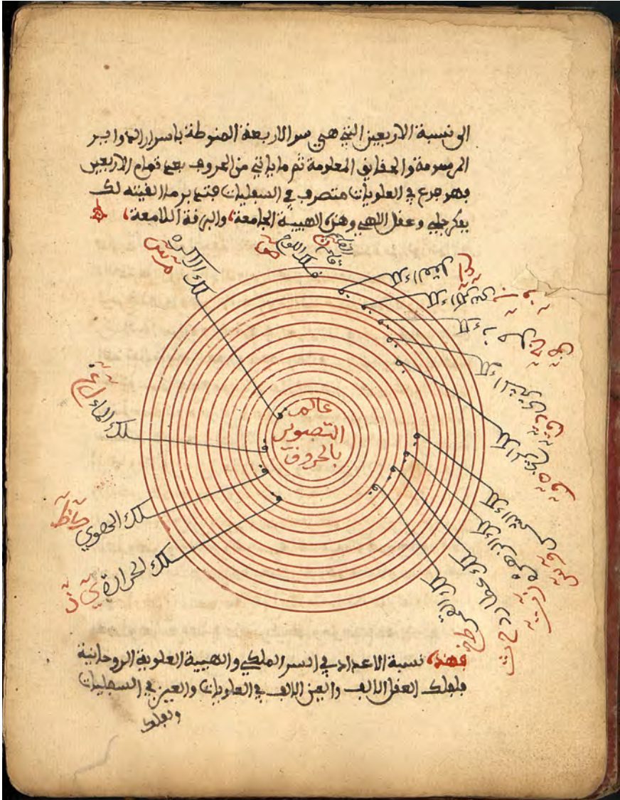
FIGURE 9.1 The hierarchy of the spheres. MS Paris, BULAC, ARA.572, fol. 37 b

In the Latā'if , al-Būnī sketched out creation in a cosmological perspective, and for this reason it contains many schematic drawings, but these must not be confused with magical drawings per se . Indeed, some of these drawings can be both considered as a representation of a kind of knowledge and magical item as well, but a lot of them are only added for a mnemonic purpose or to