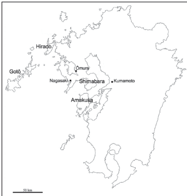
Map 1: Kyūshū

I will sustain my essay with documents that mainly concern the peninsula of Shimabara 島原 between 1612 and 1638. The history of this domain is closely linked to Catholicism. Arima Yoshisada 有馬義貞 (1521–1576) was one of the first feudal lords ( daimyō 大名) to convert to the new creed. His son, Arima Harunobu 有馬晴信 (1567–1612), known in the Portuguese sources as Dom Protásio , actively supported the propagation of Catholicism among his retainers and subjects. The “Western religion” particularly took root in the southern half of the peninsula. However, the 20,000 or so Catholics of Shimabara were also the first to endure harsh repression from 1612 to 1615 when their new lord, Arima Naozumi 有馬直純 (1586–1641), renounced his faith. Furthermore, they were the initiators, along with peasants from Amakusa 天草 of a large-scale revolt of Christian inspiration in 1637–1638.