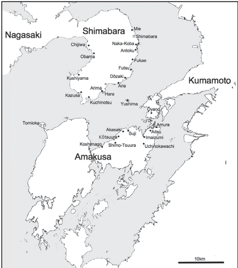
Map 2: Main villages and towns involved in the revolt of Shimabara-Amakusa.

The first known document produced by the “rebels” is a call to the revolt. It was written on the 29 th of November 1637 and bore the name of Kazusa Juwan (João) かづさじゅわん. Kazusa 加津佐 is a village situated on the west coast of the peninsula: