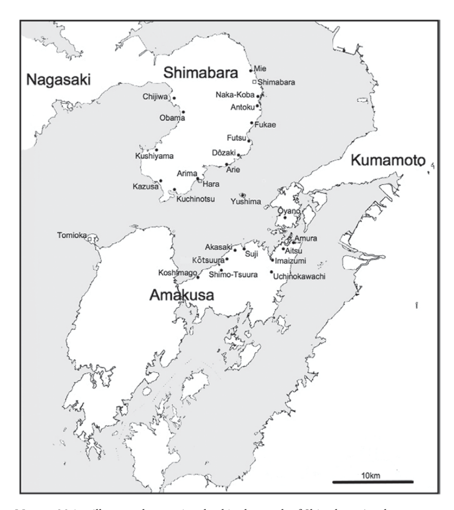
Map 2: Main villages and towns involved in the revolt of Shimabara-Amakusa.

The first known document produced by the "rebels" is a call to the revolt. It was written on the 29<sup>th</sup> of November 1637 and bore the name of Kazusa Juwan (João) かづさじゅわん. Kazusa 加津佐 is a village situated on the west coast of the peninsula: