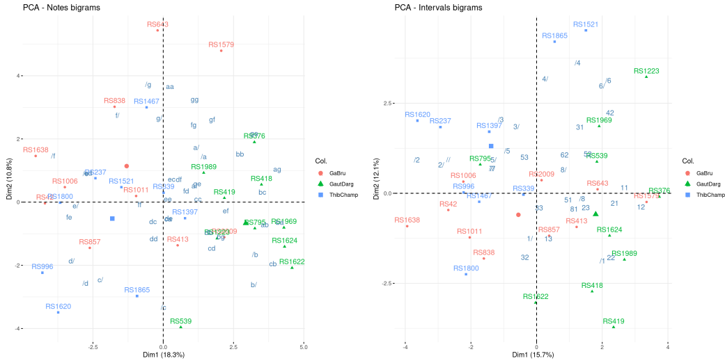
Figure 3: First factor plane from principal component analysis of notes and intervals bigrams (smaller set)