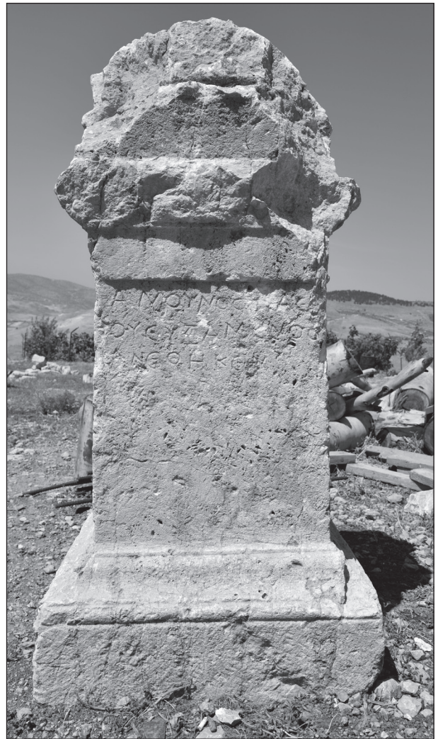
1. Inscribed altar from al-Qunayyah: front side.

418; 15, 246, with Wuthnow 1930: 23; Harding 1971: 206, s.v. hnn ; for the second, IGLS 13/2, no. 9869; 14, no. 178; 15, no. 212; Gatier 1998: 400, no. 107; I. Jordanie 5/1, nos. 13, 349, 608, with Wuthnow 1930: 91; Harding 1971: 632, s.v. w'l ; Sartre 1985: 225; Negev 1991: 23; Sar-