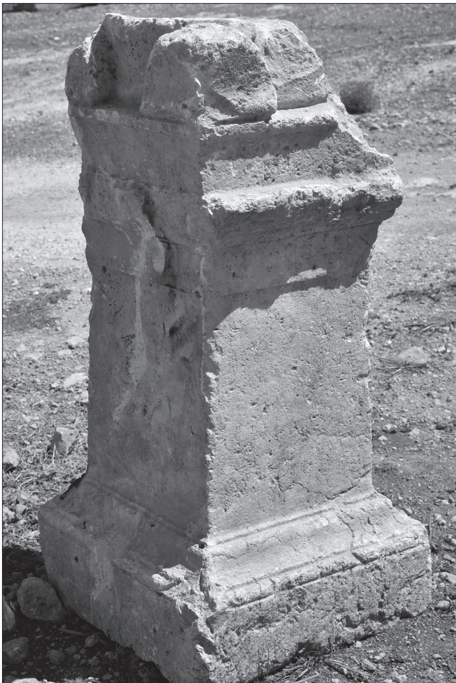
2. Inscribed altar from al-Qunayyah: back side (photo Jean-Baptiste Yon 2018).

tre 2007: 224-225). The shape of the letters (especially the epsilon and theta with a dot instead of the middle bar, and the small theta above the line) goes well with a dating in the first or second century AD.