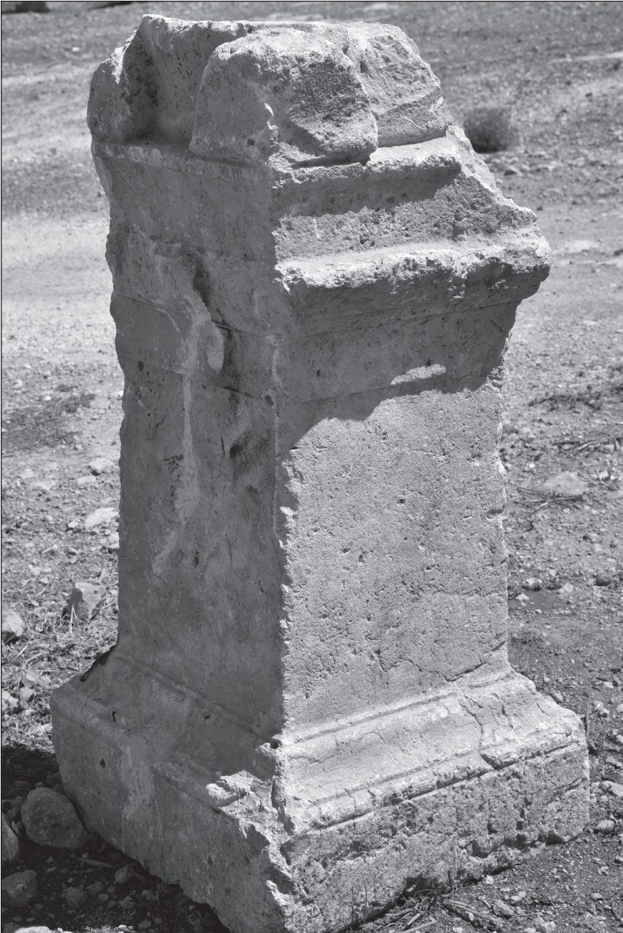
2. Inscribed altar from al-Qunayyah: back side.

tre 2007: 224-225). The shape of the letters (especially the epsilon and theta with a dot instead of the middle bar, and the small theta above the line) goes well with a dating in the first or second century AD.