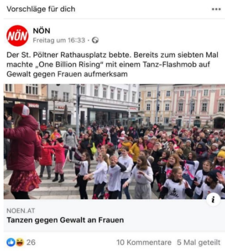
Social Media Content No. 1

that the causes shaping current global social media debates on feminism and violence against women are also part of the respective youths' political discussions. The students highlight four topics relating to feminism: violence against women, anti-feminism, gender equality and gender gap/underpaid work. Violence against women is framed as an issue that needs "attention", as presented by a social media post from the NÖN shared by a student, which refers to a flash mob of mostly female teenagers against violence against women in the city of St. Pölten. The second social media item thematizes violence against women in relation to the problem of "objectifying women in the film business". The post reflects a broader discourse on "rape culture", strongly related to the #metoo movement and shows the latter's presence on the social media channels used by youth.