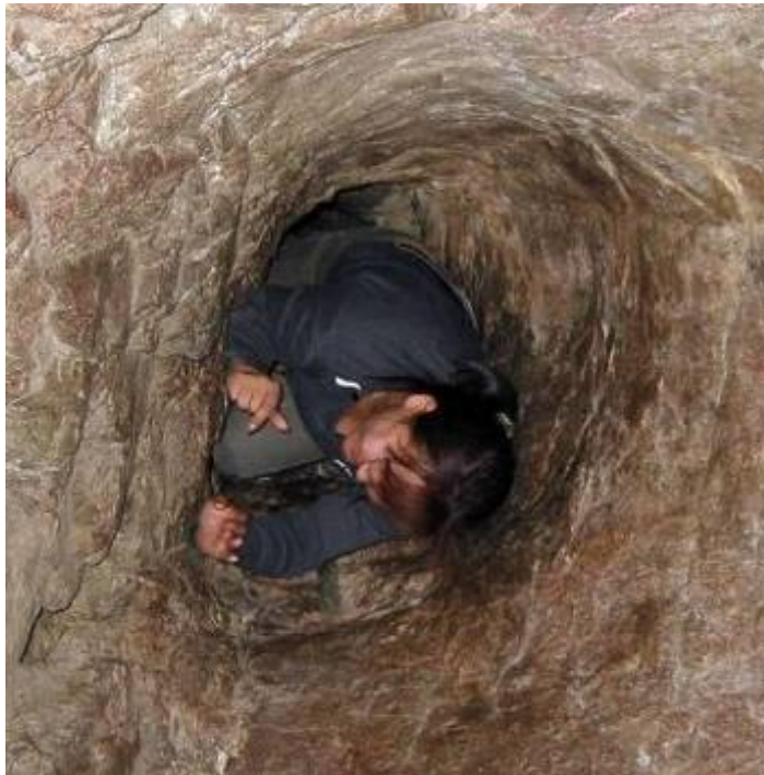
Fig. 9. A Mongol pilgrim crawling into the womb-cave of Tövkön keyid, Bat Ölzii District, Övörkhangaï Province, Mongolia.

These monasteries all are important pilgrimage places, and the womb-cave is usually one of the “marvels” to worship among many others, such as special icons, temples and stūpas , sacred trees and rocks, meditation caves, and footprints of deities. For instance, the womb-caves of Tövkhen Kheid are one of the sixteen wonders of the pilgrim path. Interestingly, great figures connected to these monasteries, such as Danjinrabjai, Zanabazar, the Fourth Jebtsündamba and the Second Jamyang Zhépa, all visited Wutaishan and may have established a link between Wutaishan’s Mother’s Womb-Cave and the womb-caves of the monasteries they founded.