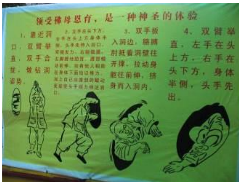
Fig. 6. Board with diagrams and explanations at the entrance of Fomudong, Wutaishan.