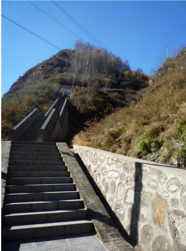
Fig. 1. Modern stairway leading to the cave of Ekhe-yin Umai (Ch. Fomudong/Qianfodong) on a cliff northeast of the Southern Terrace, Wutaishan.

Tibetans both for its ancient Chinese past and because it was another residence of Rölpe Dorjé.