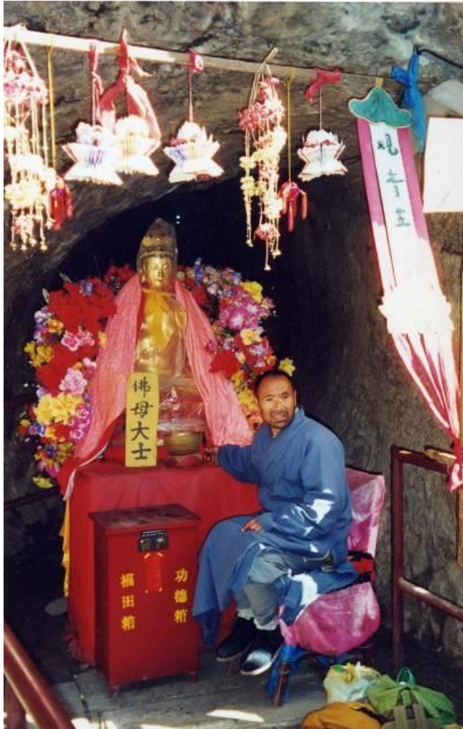
Fig. 2. The Chinese monk who revived Fomudong in the late 1990s, Wutaishan. © Corneille Jest

monastery has recently been enlarged. 14