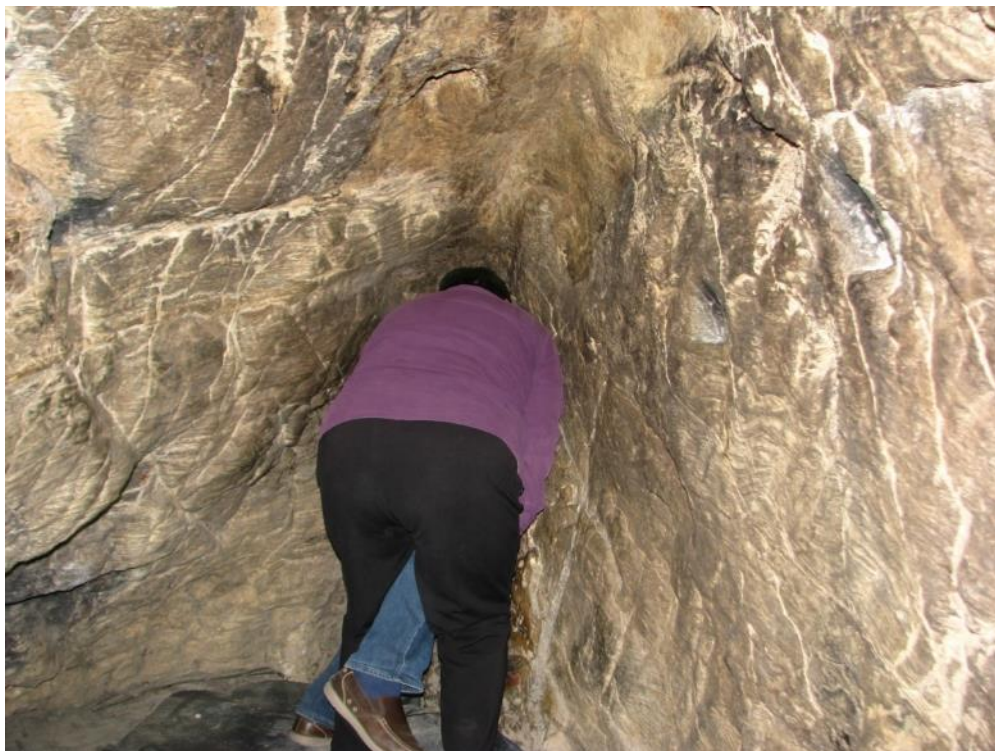
Fig. 4. A Mongol pilgrim pushes her husband inside the womb-cave of Fomudong, Wutaishan.