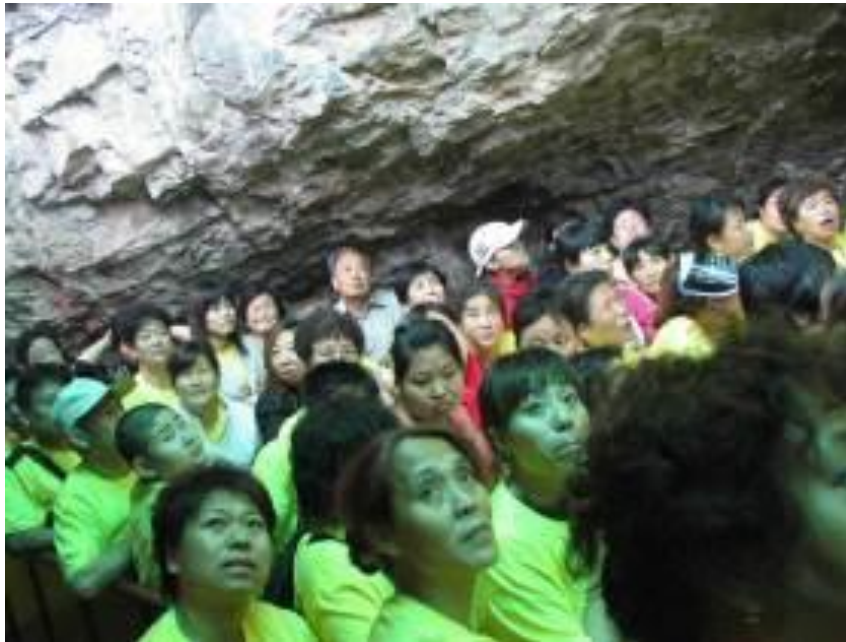
Fig. 7. Pilgrims queuing to enter the cave and a pilgrim entering the hole, Fomudong, Wutaishan.

However, some of the Mongol clerics who visited Wutaishan, such as the Dilowa Khutugtu and the Fourth Jebtsündamba Khutugtu Lubsang Tübden Wangchug (1775-1813), were well aware of this ritual. 35 The Fourth Jebtsündamba even wrote a Tibetan inscription on a stele erected at the entrance of the cave, which specified that whoever enters the cave reduces his sins and secures for himself a better reincarnation. 36