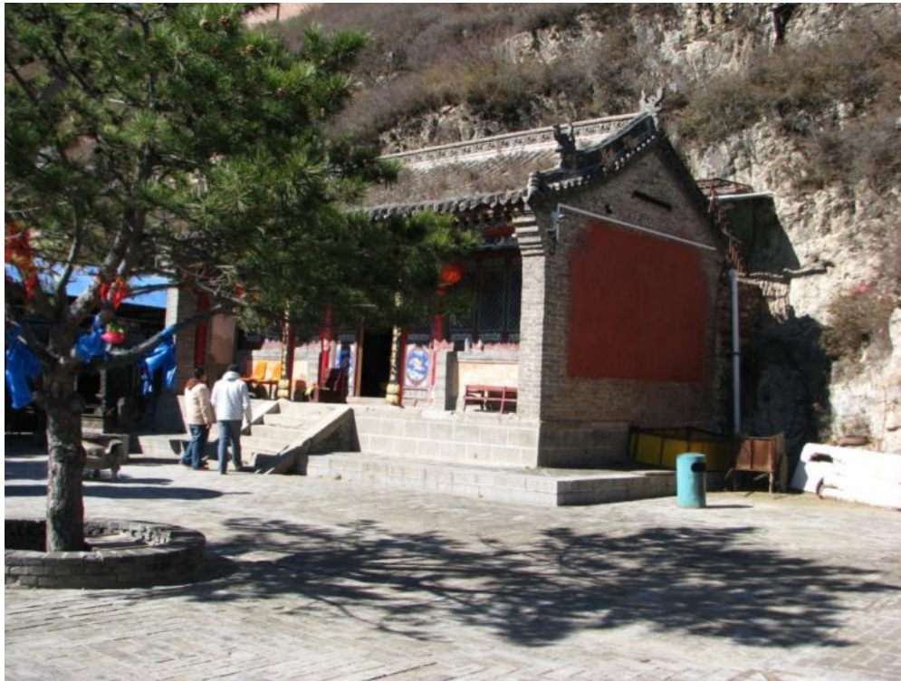
Fig. 3. Small temple protecting the womb-cave of Fomudong, Wutaishan.