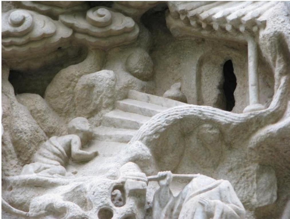
Fig. 5. Pilgrim walking in great prostrations to Ekhe-yin Umai. Stone relief on the screen-wall at the foot of the stairs leading to Longquansi 龍泉寺, 1912, Wutaishan.

Though not mentioned in historical sources, the cave was also certainly a place where Buddhist practitioners used to meditate and perform rituals. A modern online travellers' guide based on information given by Khejok Rinpoché (1936-2013) 37 during a pilgrimage to Wutaishan he led in 1999 gives a Tibetan Buddhist interpretation of the ritual of the Mother's Womb-Cave that Tibetans call the Ḍākinī Cave 38 :