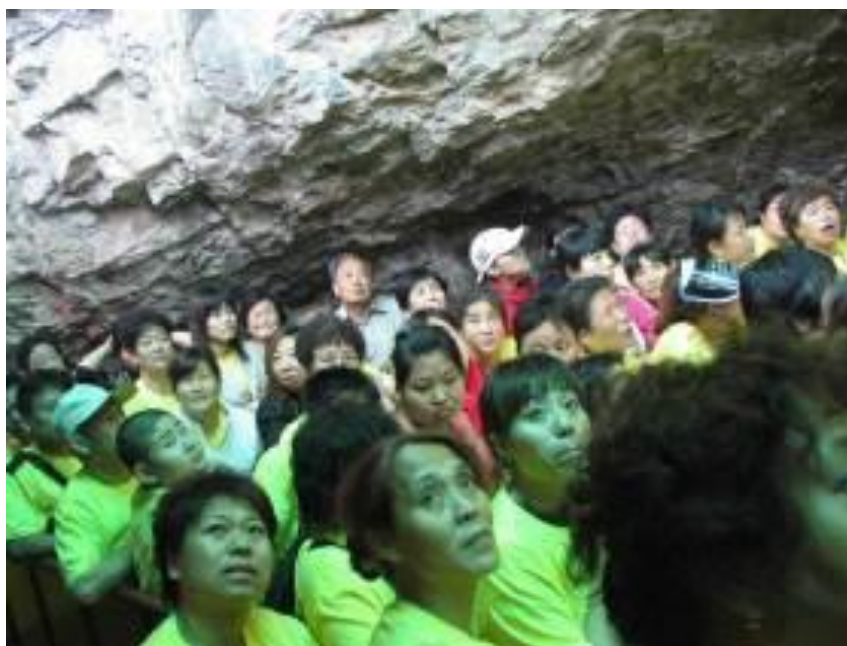
Fig. 7. Pilgrims queuing to enter the cave and a pilgrim entering the hole, Fomudong, Wutaishan.

However, some of the Mongol clerics who visited Wutaishan, such as the Dilowa Khutugtu and the Fourth Jebtsündamba Khutugtu Lubsang Tülden Wangchug (1775-1813), were well aware of this ritual. 35 The Fourth Jebtsündamba even wrote a Tibetan inscription on a stele erected at the entrance of the cave, which specified that whoever enters the cave reduces his sins and secures for himself a better reincarnation. 36