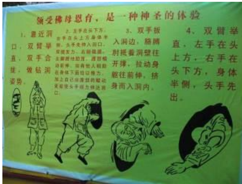
Fig. 6. Board with diagrams and explanations at the entrance of Fomudong, Wutaishan.