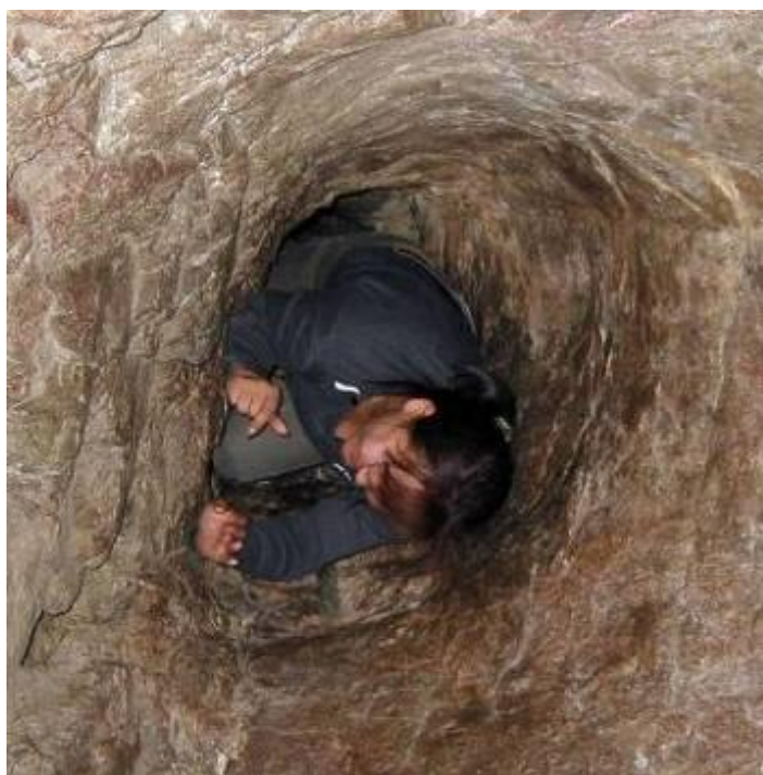
Fig. 9. A Mongol pilgrim crawling into the womb-cave of Tövkön keyid, Bat Ölzii District, Övörkhangaï Province, Mongolia.

These monasteries all are important pilgrimage places, and the womb-cave is usually one of the “marvels” to worship among many others, such as special icons, temples and stūpas , sacred trees and rocks, meditation caves, and footprints of deities. For instance, the womb-caves of Tövkhen Kheid are one of the sixteen wonders of the pilgrim path. Interestingly, great figures connected to these monasteries, such as Danjinrabjai, Zanabazar, the Fourth Jebtsündamba and the Second Jamyang Zhépa, all visited Wutaishan and may have established a link between Wutaishan’s Mother’s Womb-Cave and the womb-caves of the monasteries they founded.