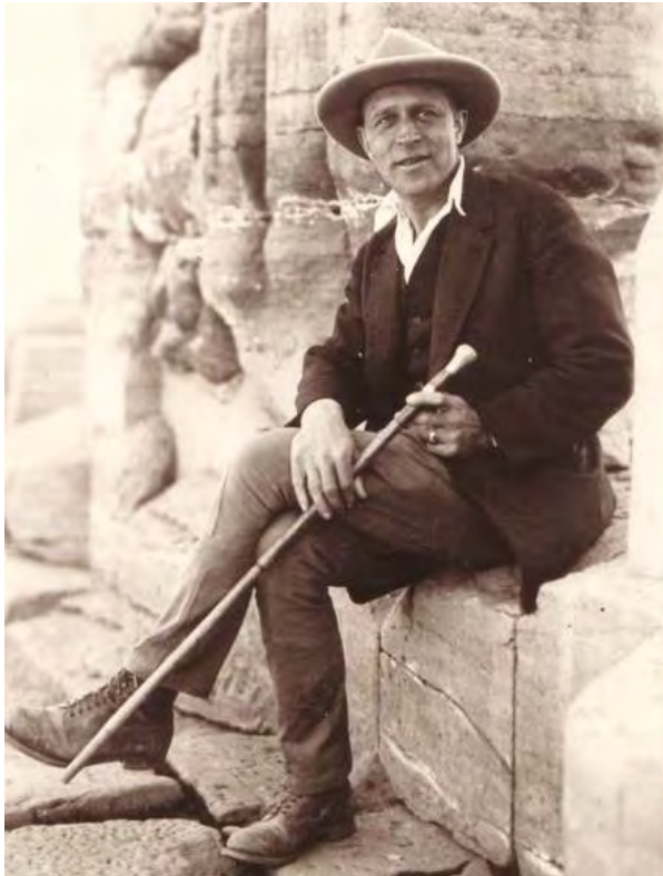
Ludwig Borchardt (1863-1938).

In Germany too, it was the learned communities that pushed for the diplomatic accreditation of scientists, using the same argument of international competition (in particular with regard to their neighbor across the Rhine), while the diplomatic corps was reluctant. Here again, the game was played outside Europe, first in Egypt and then in China. The outcome, however, differed in that the German scientists, unlike the French, finally won their case.