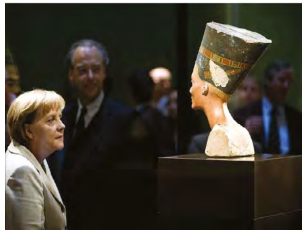
Chancellor Angela Merkel visited Nefertiti in 2009.

Although “extra-diplomatic”, Borchardt used his title to start important excavations at Tell el-Amarna. He was thus able to “discover” the bust of Nefertiti in 1912 and obtain its transfer to Berlin, where it quickly attracted the crowds. The “Mona Lisa of Berlin” has been the subject of dispute with Egypt since the 1920s.