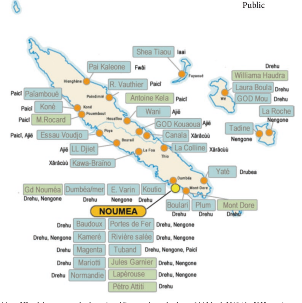
Figs. 13.2 Teaching of Kanak languages and cultures in public secondary schools as of 14 March 2018 (the 2022 map is currently available on the following website, but is less clear).

Up to 1984, the Kanak languages were "officially excluded from the educational system" (Moyse-Faurie et al. 2012, p. 122). Following the Matignon-Oudinot Accords in 1988 and the previous EPK experiments, the Deixonne law<sup>4</sup> entered into force in New Caledonia (decrees of 20 October 1992) at the end of the 1990s (May to August 1998). This sanctioned some teaching in local languages—and some are now even taught in high school, for example, Drehu, Nengone, Ajië, and Paicî. Article 1.3.4 of the Nouméa Accord signed on 5 May 1998, stipulates that Kanak culture must be valued, and Deliberation No. 106 of 15 January 2016, on the future of the Caledonian school system specifies in Article 10.1 that "teaching of the fundamental elements of Kanak culture must be compulsory for each student" and thus enjoins the school system to include them in the curriculum (see also Chap. 14 by