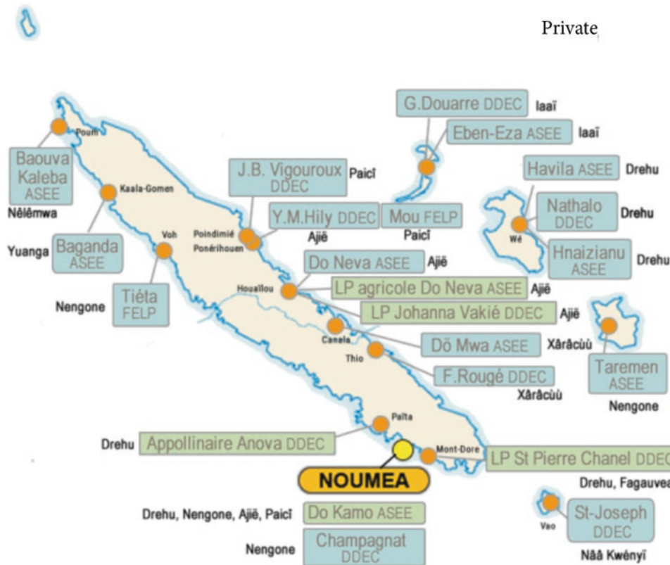
Figs. 13.3 Teaching of Kanak languages and cultures in private secondary schools as of 14 March 2018 (the 2022 map is currently available on the following website, but is less clear). (Source: https://www.ac-noumea.nc/spip.php?article3161 )

Since 1992, four languages can be chosen as electives for the Baccalaureate (the French high school diploma): Drehu, Nengone, Ajië and Paicî. In 1997, six vernacular languages were taught in middle school and high school: Iaaï and Xârâcùù, and then, from 2013, Djubéa (23 in public middle school in 2013) and Fwâi (in 2013 and 2014 at the Hienghène middle school), and Yuanga with a single pupil in private middle school in 2012 at the Baganda middle school in Kaala Gomen. Therefore, beyond the six main vernacular languages, the others are only taught sporadically and are localized within their geographic area. Depending on the year, the total number of pupils receiving instruction in vernacular languages varies from 3014 in 2005 to 1879 in private establishments, that is, two thirds, with 655 in high school and 2359 in middle school to 778 in 2011, in public schools only (data from private schools being unavailable), and rising to 3365 in 2005. Out of these, 2931 were in middle school and 434 in high school, and in total, 1537 pupils or almost half were in private establishments.