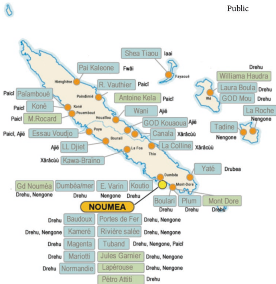
Figs. 13.2 Teaching of Kanak languages and cultures in public secondary schools as of 14 March 2018 (the 2022 map is currently available on the following website, but is less clear).

Up to 1984, the Kanak languages were “officially excluded from the educational system” (Moyses-Faurie et al. 2012, p. 122). Following the Matignon-Oudinot Accords in 1988 and the previous EPK experiments, the Deixonne law 4 entered into force in New Caledonia (decrees of 20 October 1992) at the end of the 1990s (May to August 1998). This sanctioned some teaching in local languages—and some are now even taught in high school, for example, Drehu, Nengone, Ajië, and Paicî. Article 1.3.4 of the Nouméa Accord signed on 5 May 1998, stipulates that Kanak culture must be valued, and Deliberation No. 106 of 15 January 2016, on the future of the Caledonian school system specifies in Article 10.1 that “teaching of the fundamental elements of Kanak culture must be compulsory for each student” and thus enjoins the school system to include them in the curriculum (see also Chap. 14 by