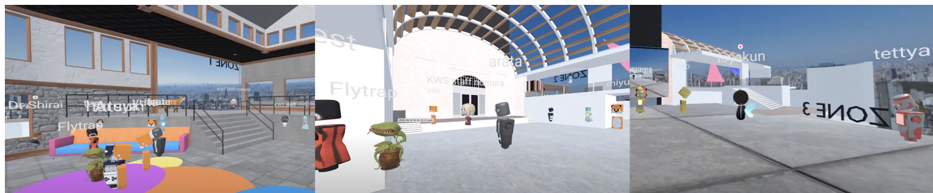
Figure 1: Hubs environment of the workshop and snapshot.

Akihiko Shirai GREE VR Studio Laboratory akihiko.shirai@gree.net