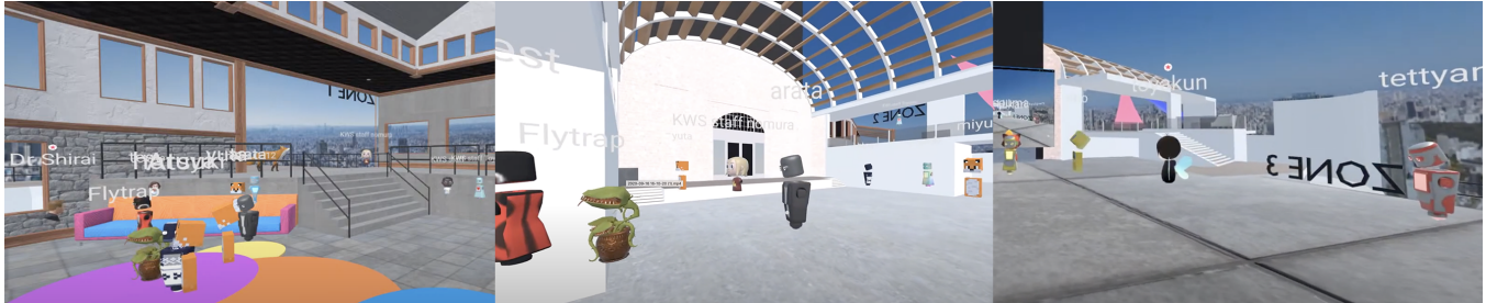
Figure 1: Hubs environment of the workshop and snapshot.

Akihiko Shirai GREE VR Studio Laboratory akihiko.shirai@gree.net