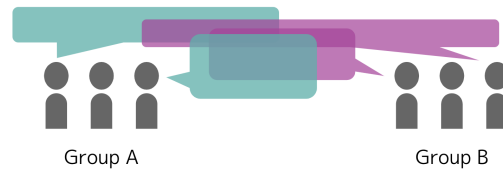
Figure 3: Cross-talk between different speakers.

During the kids’ workshop, we developed a new method called “Sugoroku” for step-by-step workshops. The method proved to be useful in guiding children during the workshop. The spatial audio design with the panner node’s linear model made it possible to be in different parts of the Hubs environment and not disturbed by