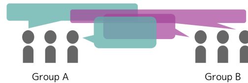
Figure 3: Cross-talk between different speakers.

During the kids’ workshop, we developed a new method called “Sugoroku” for step-by-step workshops. The method proved to be useful in guiding children during the workshop. The spatial audio design with the panner node’s linear model made it possible to be in different parts of the Hubs environment and not disturbed by