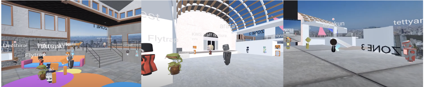
Figure 1: Hubs environment of the workshop and snapshot.

Akihiko Shirai GREE VR Studio Laboratory akihiko.shirai@gree.net