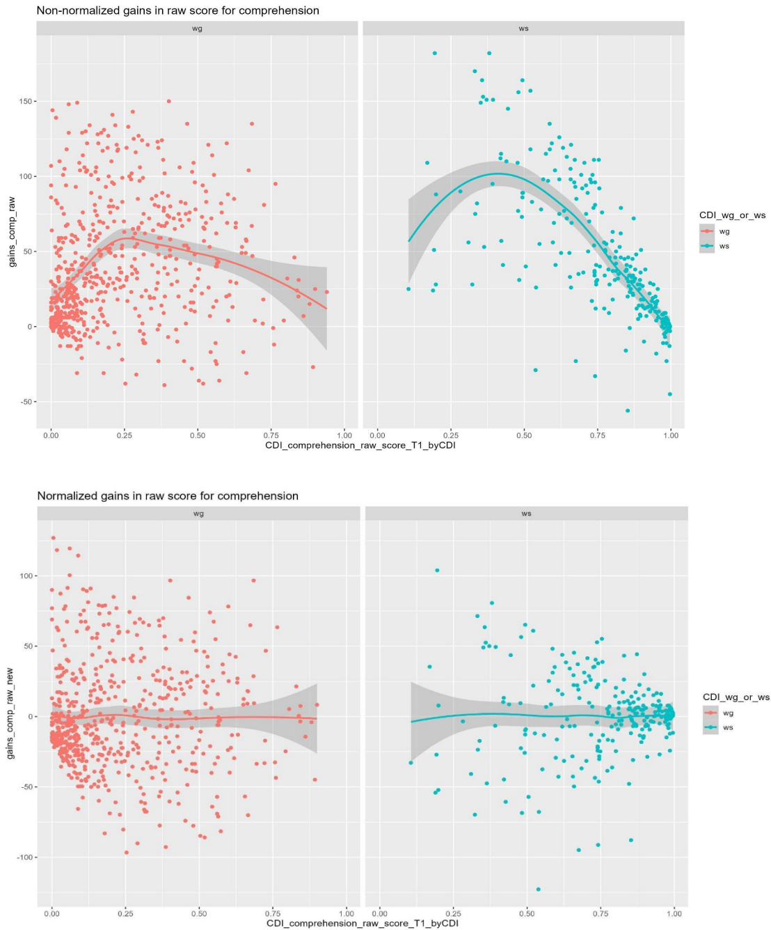
Figure 1. Non-normalized (top) and normalized (bottom) gains in comprehension vocabulary as a function of the adjusted CDI score at T1 for the CDI tools Words and Gestures (wg) and Words and Sentences (ws). See Analyses_2.Rmd code on https://osf.io/ty9mn/ for data on production.