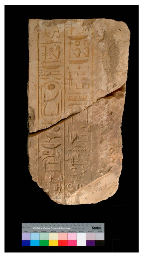
Fig. 9 Various degrees of damage for two matching pieces (Photo by Ihab Mohamed Ibrahim / IFAO).