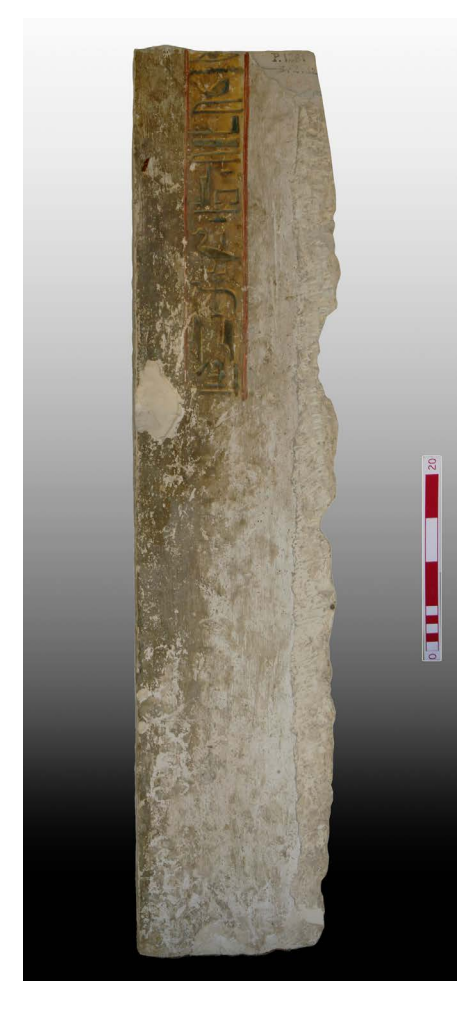
Fig. 11 Doorjamb from the entrance of a chapel (Photo by Ihab Mohamed Ibrahim / IFAO).

We can create many other groups and subgroups, but we must keep in mind that such classification is not sufficient for our study, as it leads us to only partial "results" in terms of joining, rebuilding, and so on.