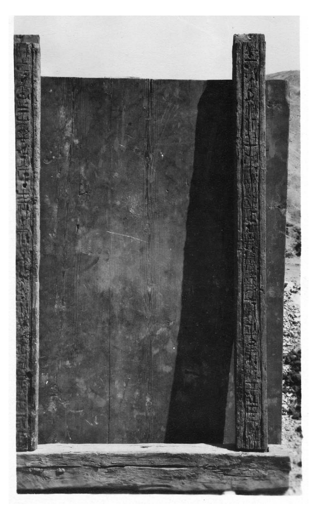
Fig. 3 Wooden doorjambs bearing the name of Hormose now kept in the storerooms at the Louvre Museum Paris (Photo by B. Bruyère / IFAO, MS_2006_00140).

These fragments that were previously parts of doors are mainly of limestone, more rarely sandstone; furthermore, some rare wooden artefacts, such as doorjambs [Fig. 3] and door-leaves, are now to be found in museum collections.<sup>6</sup>