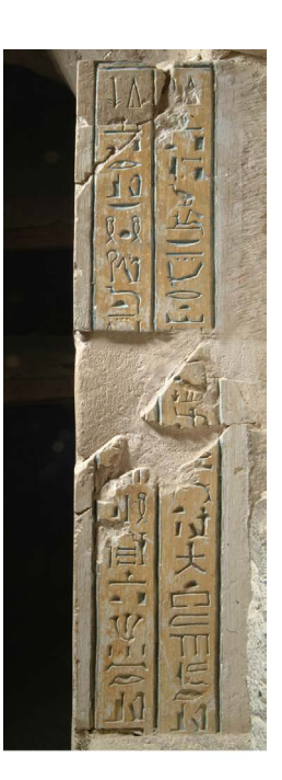
Fig. 5 Two doorjambs at the entrance of the outer burial chamber in Theban Tomb 359, with "rebuilt" parts that were exposed to heat, the yellow ochre turning to red (Photo by Ihab Mohamed Ibrahim / IFAO).

religious spheres, and more. The renewed project that was started in 2006 aims at studying these artefacts and presenting, where possible, reconstructions, many of which will be created virtually given the dispersal of the artefacts. Indeed, one part of the same monument could be kept in a museum, while another could be held within the magazines of the Egyptian Ministry of Antiquities.<sup>7</sup>