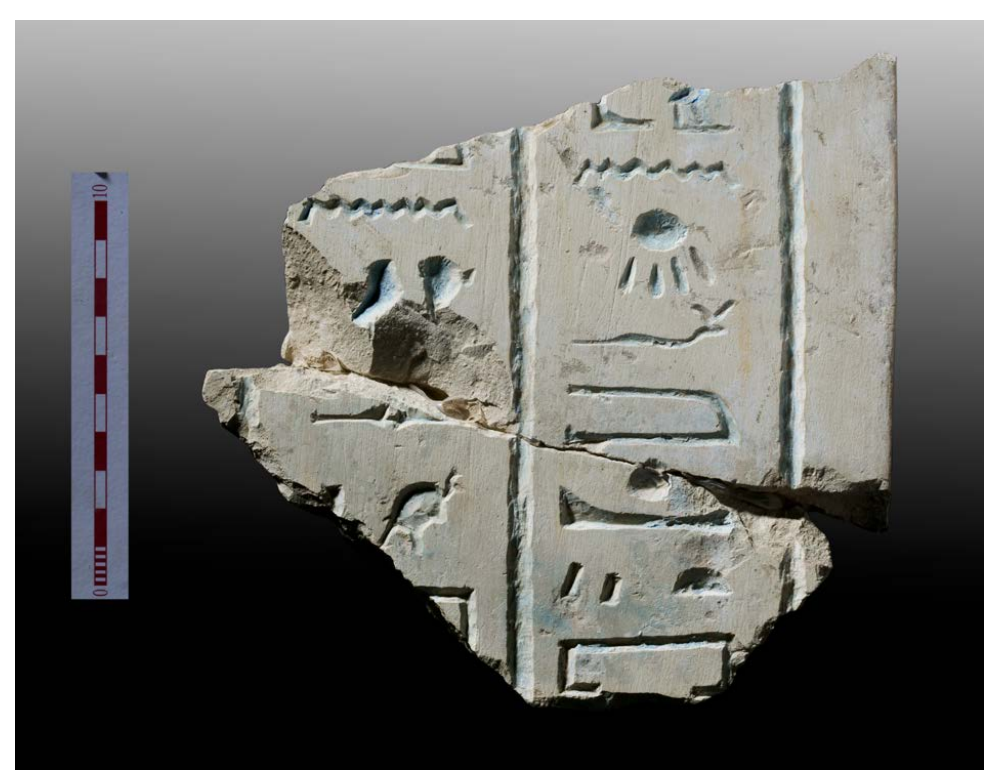
Fig. 12 Doorjamb dating from the Twentieth Dynasty (Photo by Ihab Mohamed Ibrahim / IFAO).

This is an example of the kind of information the study of architectural elements – particularly inscribed material from "old" excavations – can yield. An examination of their carving can establish differences in techniques, proportion, relief type and style. Furthermore, their inscriptions may contain relevant information, such as kinship networks or previously unrecorded divine epithets. This kind of study thus enriches our knowledge and offers fresh insight into both the social and religious spheres at Deir el-Medina.