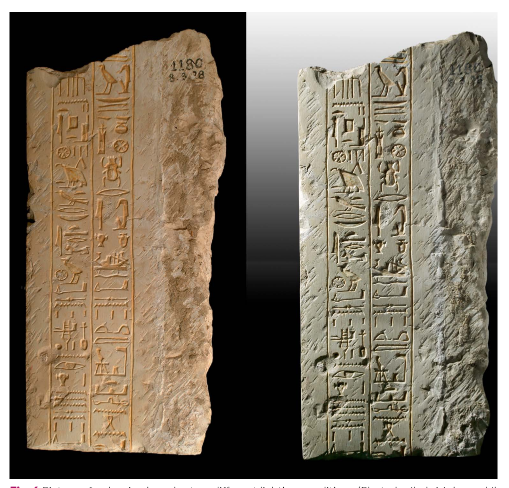
Fig. 6 Picture of a doorjamb under two different lighting conditions (Photo by Ihab Mohamed Ibrahim / IFAO).

first gives the impression that the decoration was carved on the opposite faces of one piece of stonework, whereas in fact the monument comprises two different blocks, each decorated with fine inscriptions.<sup>8</sup>