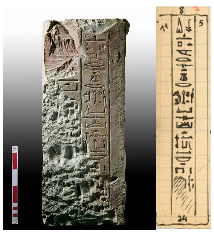
Fig. 7 Reading of the hieroglyphic signs on a block from house SW V made by Bruyère (Photo by Ihab Mohamed Ibrahim / IFAO, and IFAO, B. Bruyère, Carnet de fouilles 1935 , p. 6b).