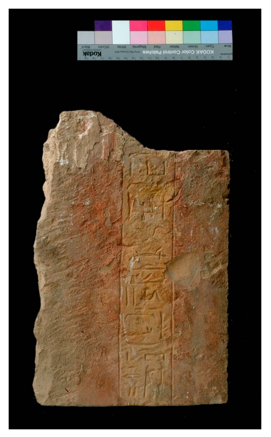
Fig. 10 Doorjamb found in domestic context.

colour, and their study has already led to concrete results in terms of provenance and/or date.