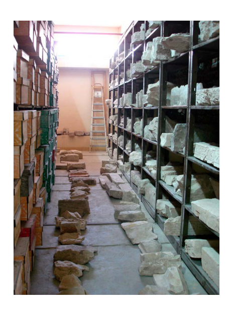
Fig. 1 The full-to-bursting shelves in the quarters dedicated to the "huisseries" from Deir el-Medina in the Carter magazines.

During his extensive excavations, Bernard Bruyère gathered every door lintel, jamb and cultic cupboard he found at Deir el-Medina and placed them in a disused anonymous tomb¹ with the intention of studying them at some later date. These artefacts originate from private houses, tombs, chapels, and temples, and constitute a corpus of more than a thousand pieces –many more, if we take in account those that are housed in private collections and museums.²