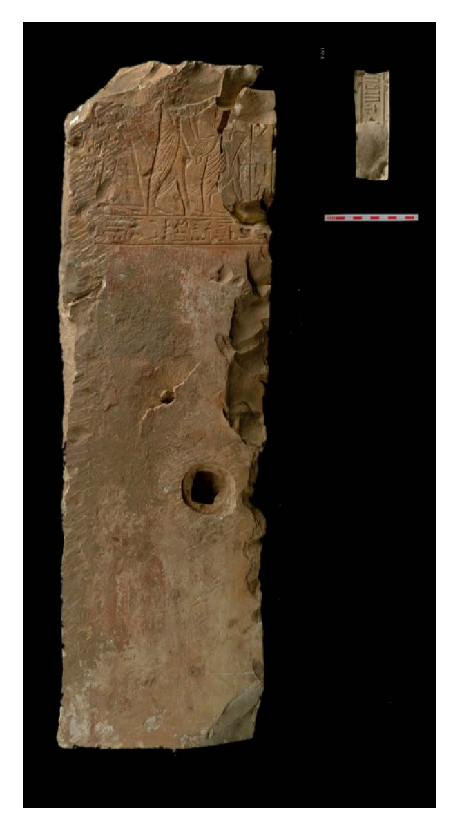
Fig. 2 Two jambs at the same scale showing the heterogeneity of the sources: one jamb from a door naming Anuy and Nebamentet; another from a cultic cupboard.

In French, the term "huisserie" primarily designates a piece of wood or metal that forms, inter alia , the frame of a door or a window in a building;<sup>5</sup> by extension, and in current usage, the word can also be used to refer to stone pieces. In English, "huisserie" has many translations depending upon the context: door frame, door lintel, doorjamb, etc. The present paper focuses on both the wooden and stone architectural elements that once comprised doors in private houses – both main and secondary entrances – and within tombs at Deir el-Medina, as well as cultic cupboards set up within wall niches in private dwellings [Fig. 2].