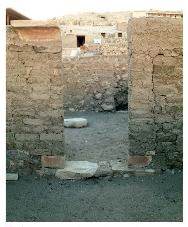
Fig. 4 Remains of the door of the second room (House of Sennedjem, SW VI).