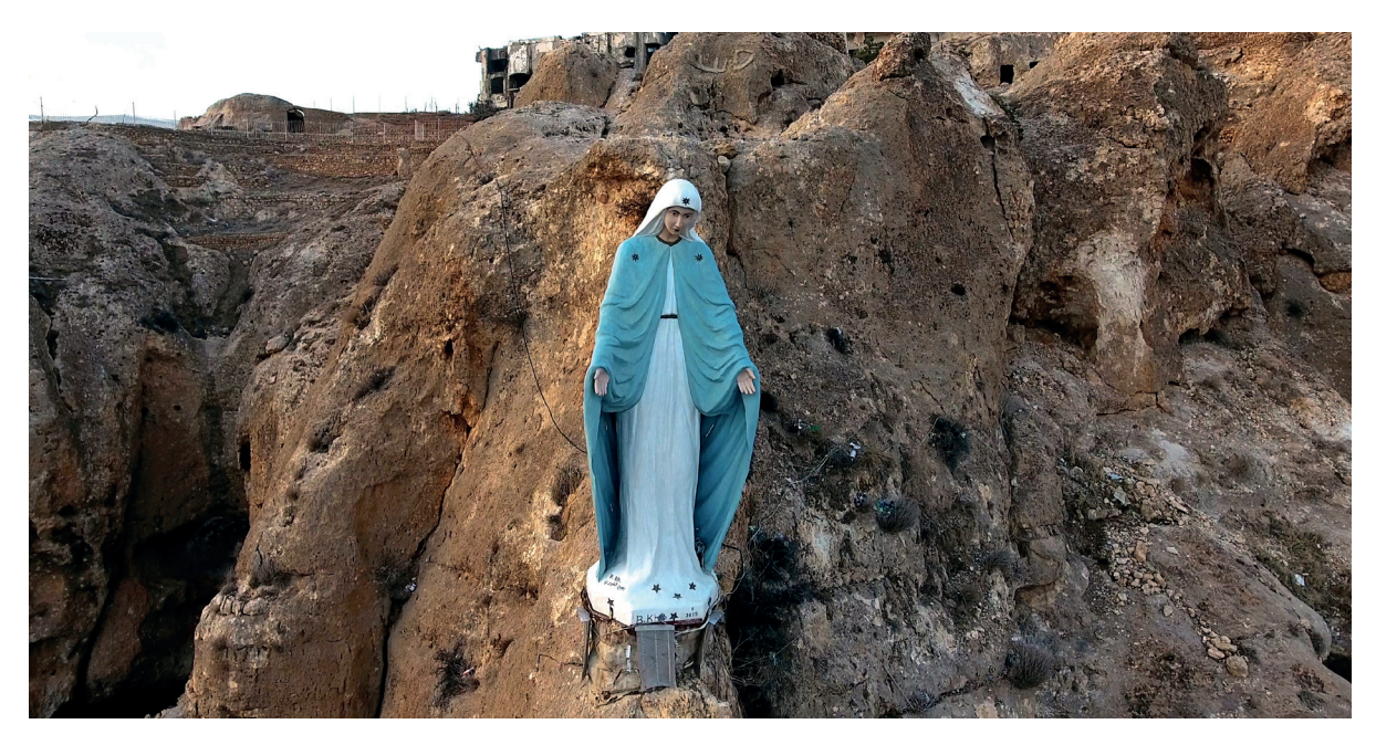
The Virgin Mary of the Syrian village of Maaloula was destroyed when the village was taken over in 2013. A new statue was erected at the same place on June 13, 2015. On that day, families from the village, State officials and religious leaders gathered in the main square, adorned on that occasion with the national flag and a giant portrait of Bashar El Assad.