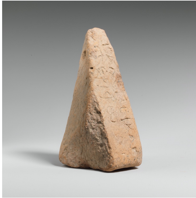
Figure 3: Cretan terracotta loom-weight with inscriptions, sixth century B.C.E. or later, n° 53.5.45, New York, Metropolitan Museum of Art. Dimensions: 4 3/4 in. x 2 1/2 in. (12 cm × 6.3 cm).

Loom-weights are thus interpreted as typical gendered objects closely associated with women: not only did they carry women's personal marks, they also reflect the affection and strong physical, haptic affordance that could exist between a woman and her tools (Foxhall 2012.194–196). Loom-weights also solidified the emotionally charged relationships that women working together at the loom developed with each other. Hence, according to Gleba and Sofroniew, this highly symbolic and affective value explains why a number of them are found as votive offerings in South Italian sanctuaries. The practice of dedicating loom-weights allowed women to represent themselves in a way that emphasized “production and personal skill, as opposed to, or alongside, other dedications that might instead highlight motherhood, marriage, or feminine beauty” (Sofroniew 2011.103). If the loom-weights were marked with a signet, they also advertised the identity of the owner in a more concrete way than other types of (unmarked) dedications.