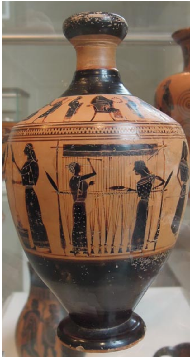
Figure 2: Attic black-figure lekythos attributed to the Amasis Painter depicting a group of women working wool, mid-sixth century B.C.E.. Fletcher Fund, 1931, 31.11.10, New York, Metropolitan Museum of Art.