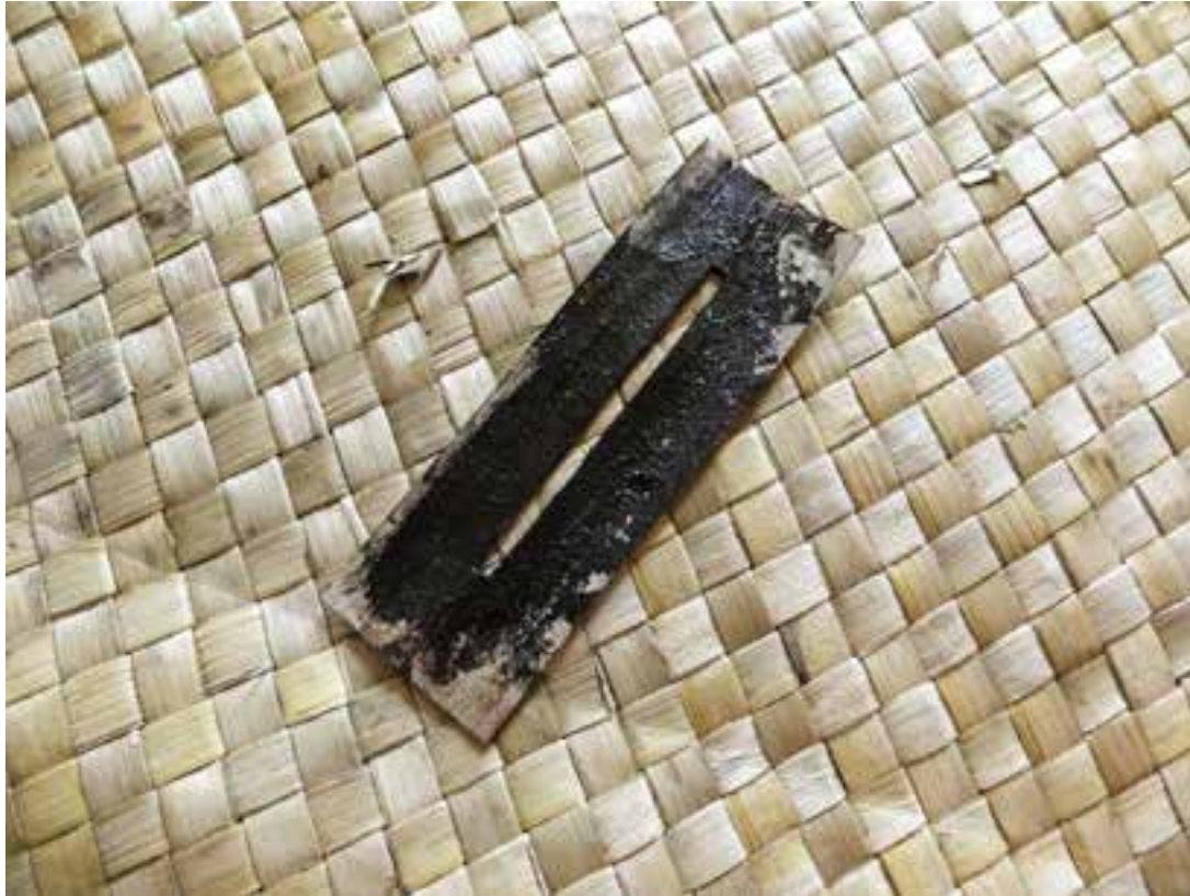
Fig. 39 Draudrau, a stencil used for the decoration of barkcloth, shown on a woven mat in a house in the village of Tukavesi, Vanua Levu, Fidji, 2014, photograph: Virginia Gamna and Sara Martinetti.

Irregular or geometric, lively or inanimate, always dizzying, the pattern, despite many scholarly attempts, remains intrinsically difficult to classify. It is invariably governed by one principle: the pattern is a model. Historical, lexical, and etymological research highlights this aspect, showing that the word itself comes from the Old French patron and patroner , two words derived from the medieval Latin patronus . The word patron refers to an influential and exemplary person who is responsible for a given community, and, by displacement, to an object, namely, a drawn, cut-out, or carved template used by the artisan-artist to produce forms. Appearing in the English language in the early fourteenth century, the patron gradually broadened its meaning and, from 1588 onwards, applied to a design, understood as a repeated ornament that constitutes a decorative theme. From the material to the conceptual, the quality of the pattern as structure and type confers an abstract value upon it, which lets it designate a habit, arrangement, or scenario.