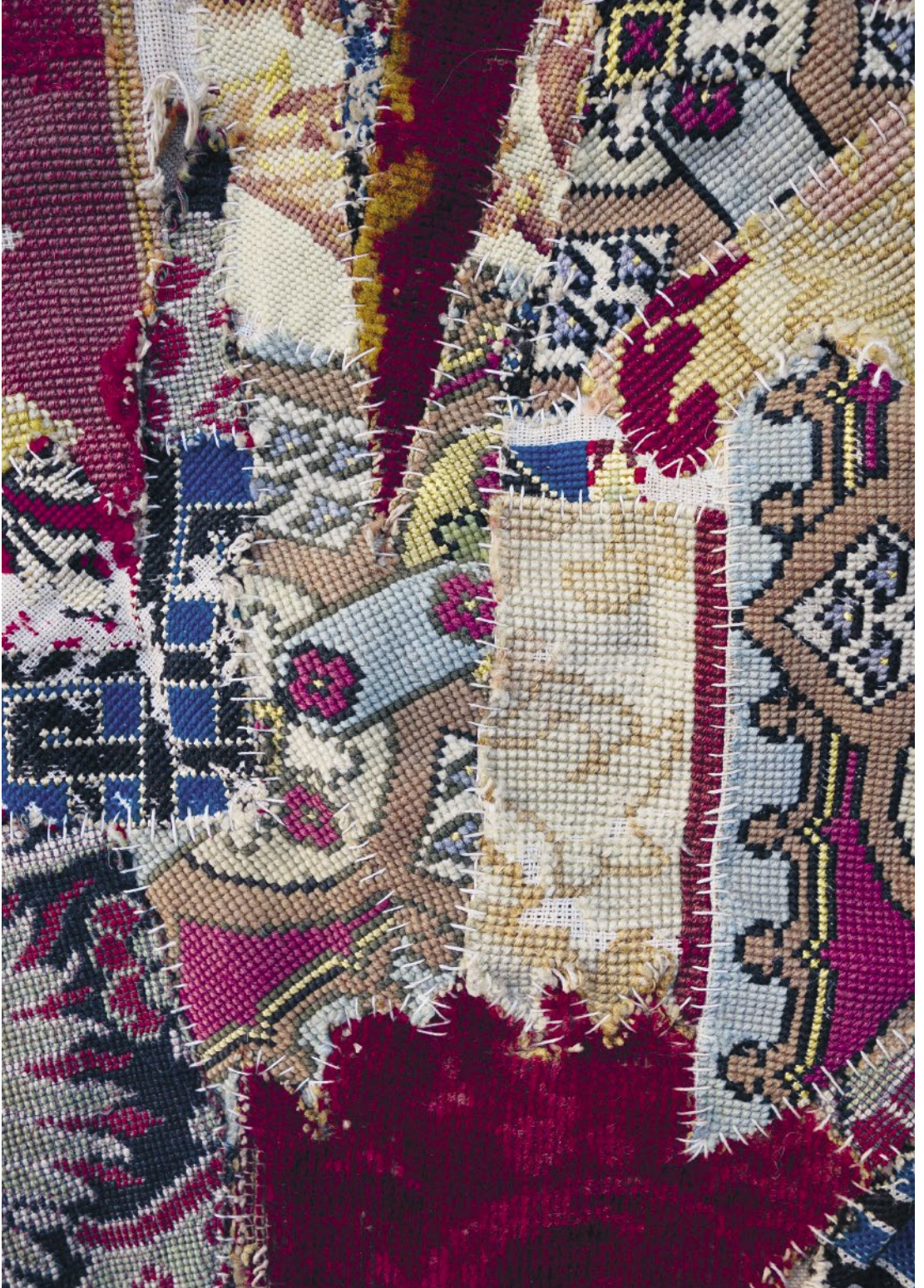
Detail of patchwork jacket sewn by Siegelaub, c. 1975