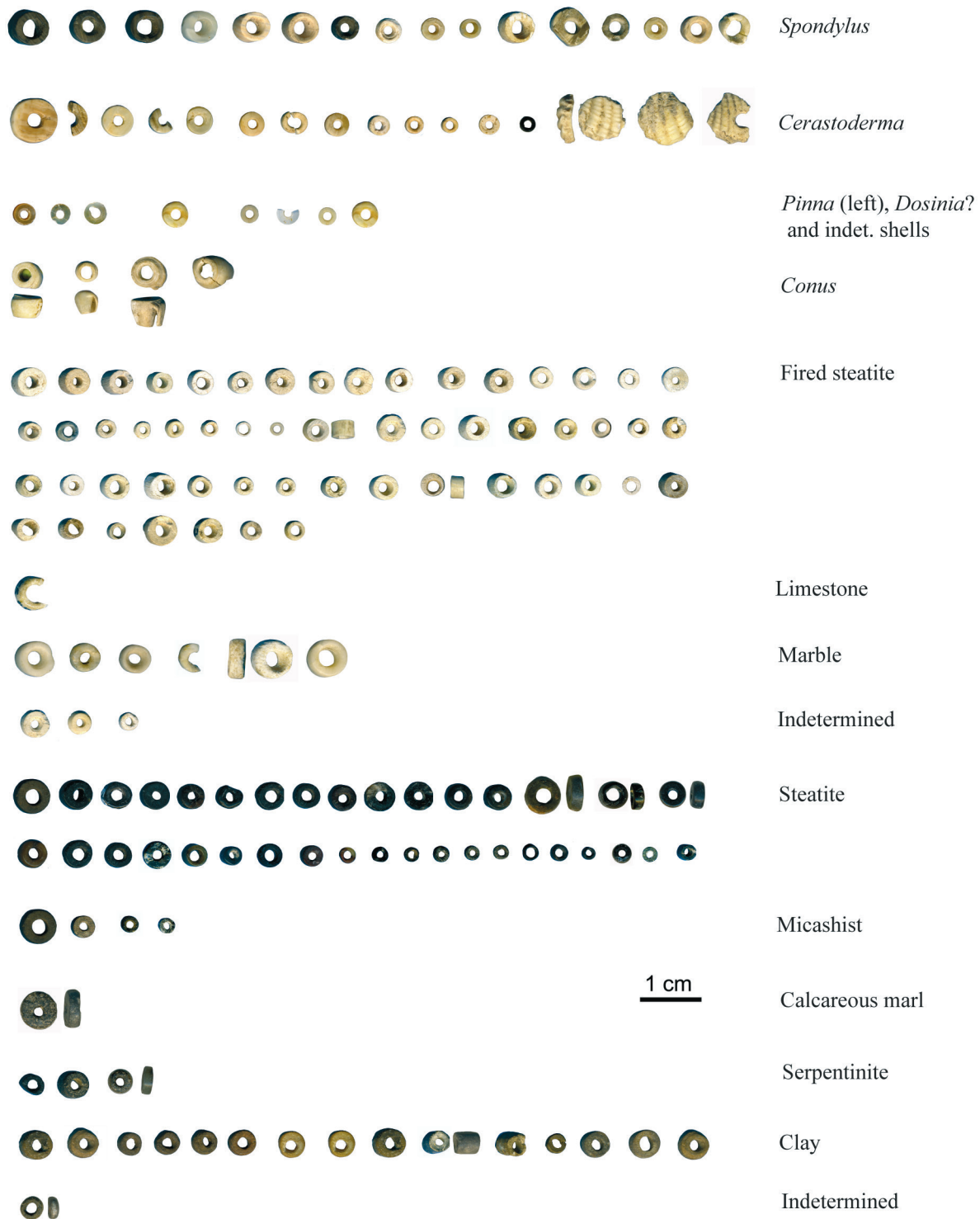
Figure 33.4. Variety of raw materials in Late Neolithic beads from FAN and FAS.

such as anthropomorphic pendants, of especially high craftsmanship. It plays with the variety of shapes, sizes, colours and textures. The second conception, restricted to the Late Neolithic, obliterates all natural shapes in favour of uniform, standardised discoid and cylindrical beads.