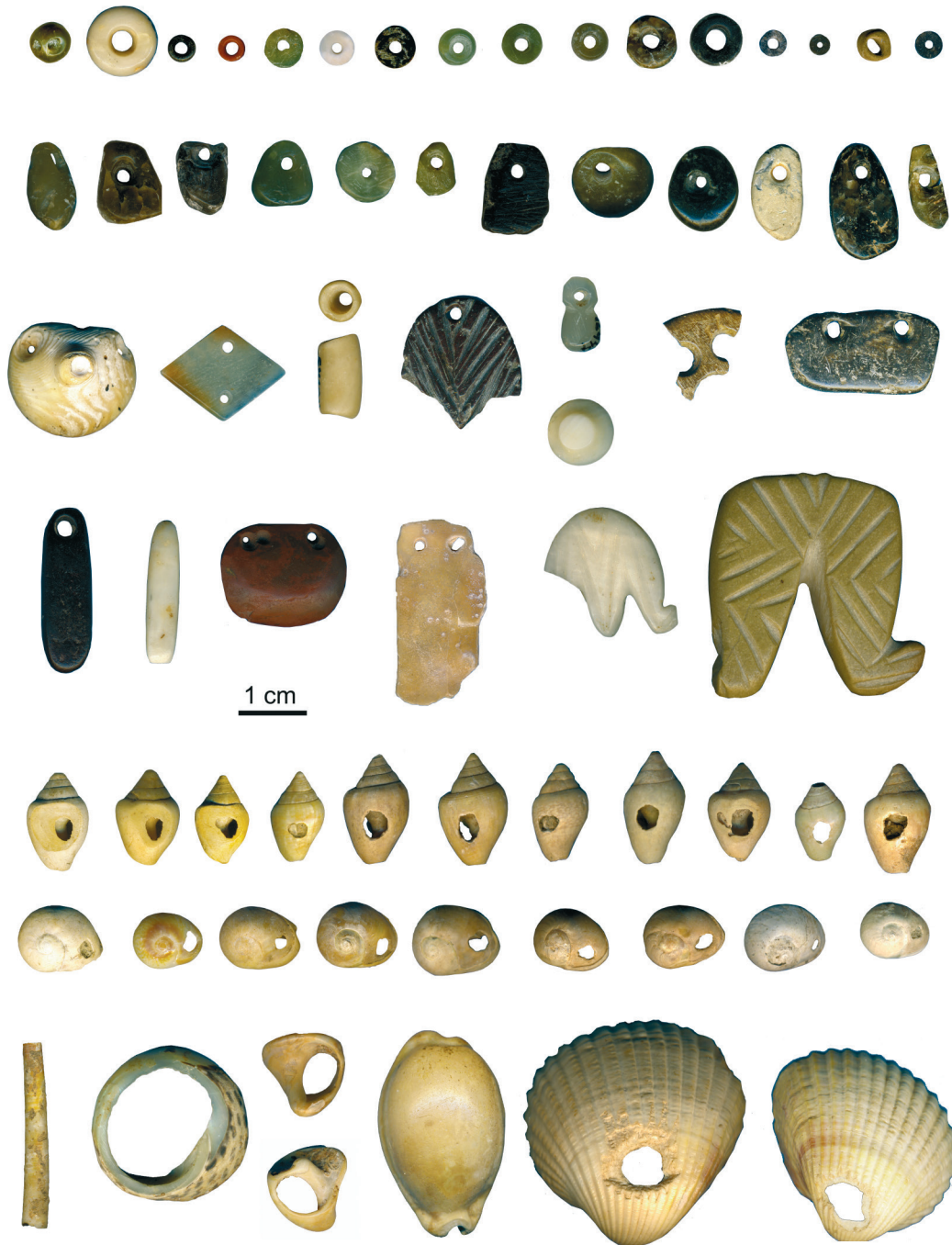
Figure 33.1. Sample of Middle Neolithic ornaments from various Cave and Paralia trenches. Fifth row: Columbella rustica . Sixth row: Cyclope neritea . Bottom row, from left to right: Antalis sp. ( Dentalium ), Phorcus marginatus ( Monodonta ), Cerithium vulgatum , Luria lurida and Cerastoderma glaucum .