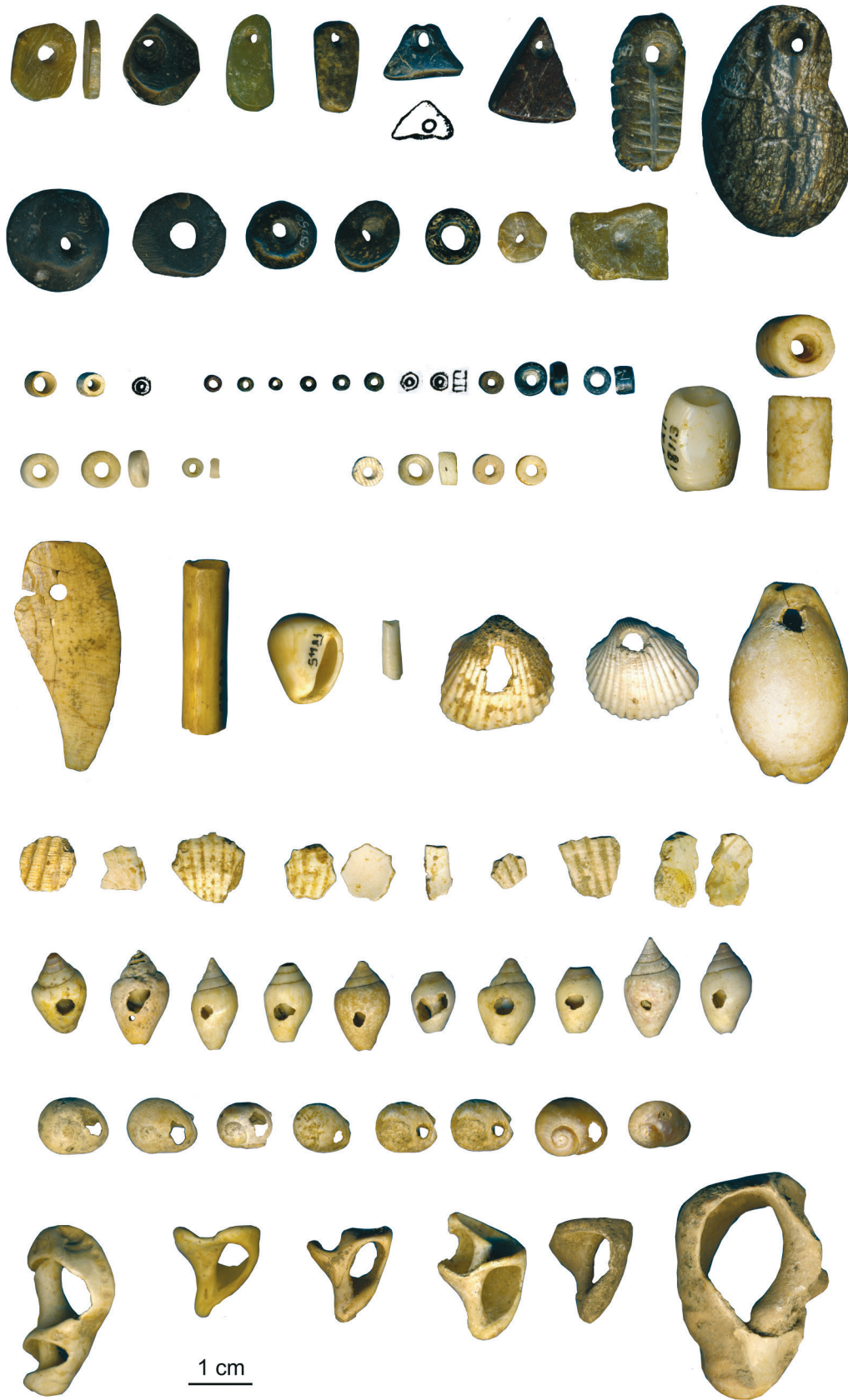
Figure 33.5. Final Neolithic ornaments from trenches FAN, FAS, L5 and L5NE. Sea worn Cerithium vulgatum are underrepresented.