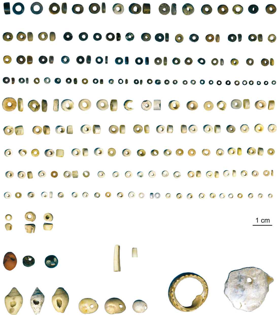
Figure 33.3. Representative sample of Late Neolithic ornaments from trenches FAN and FAS.

eye, and are again part of the visual code. Final Neolithic ornaments are, in all respects, very close in conception to Middle Neolithic ones. However, the possibility that all these ornaments would represent Middle Neolithic contaminations can be excluded: the majority come from trenches FAN and FAS, overlying the Late Neolithic levels, and both the pottery and lithic assemblage show no evidence of Middle Neolithic contamination. Some contamination in trenches L5 and L5NE is nevertheless possible, and I suspect that the three fired steatite beads and “tiny blacks” from FAN and FAS, which could point at some continuity