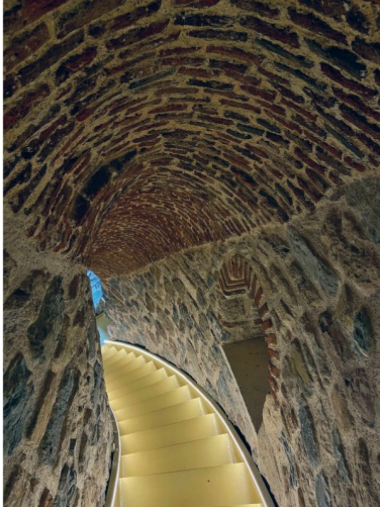
Fig. 9a: The brick vaulted gallery with stairs that continues from the ground floor to the fourth floor within the main walls of the Galata Tower. Photo: Hasan Sercan Sağlam, November 2020.

Galata Tower has eight floors in total, and the first four floors are connected to each other through a brick vaulted gallery with stairs that was placed directly inside the body walls (fig. 9a - fig. 9b - fig. 9c).