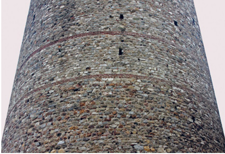
Fig. 8: Brick courses on the second and third floors of the Galata Tower.

On one hand, Anadolu and Arıoğlu claimed that the part under the first course at the level of the second floor (+13,21 m) remained from the Genoese period 137 . Eyice, on the other hand, claimed that especially the upper part of the second course at the level of the third floor (+17,17 m) was built by the Ottomans, because the brick motif on this course has a typical Ottoman ornamental character. In this context, according to Eyice, the first course with a plain character should be the level of a superficial repair carried out on the exterior covering of the tower, and the ornamental second course should be the beginning level of the part that is entirely Ottoman construction. Thus, he came to the conclusion that the part under the second or third floors of the Galata Tower is a Genoese construction and the remaining upper part is an Ottoman work 138 .