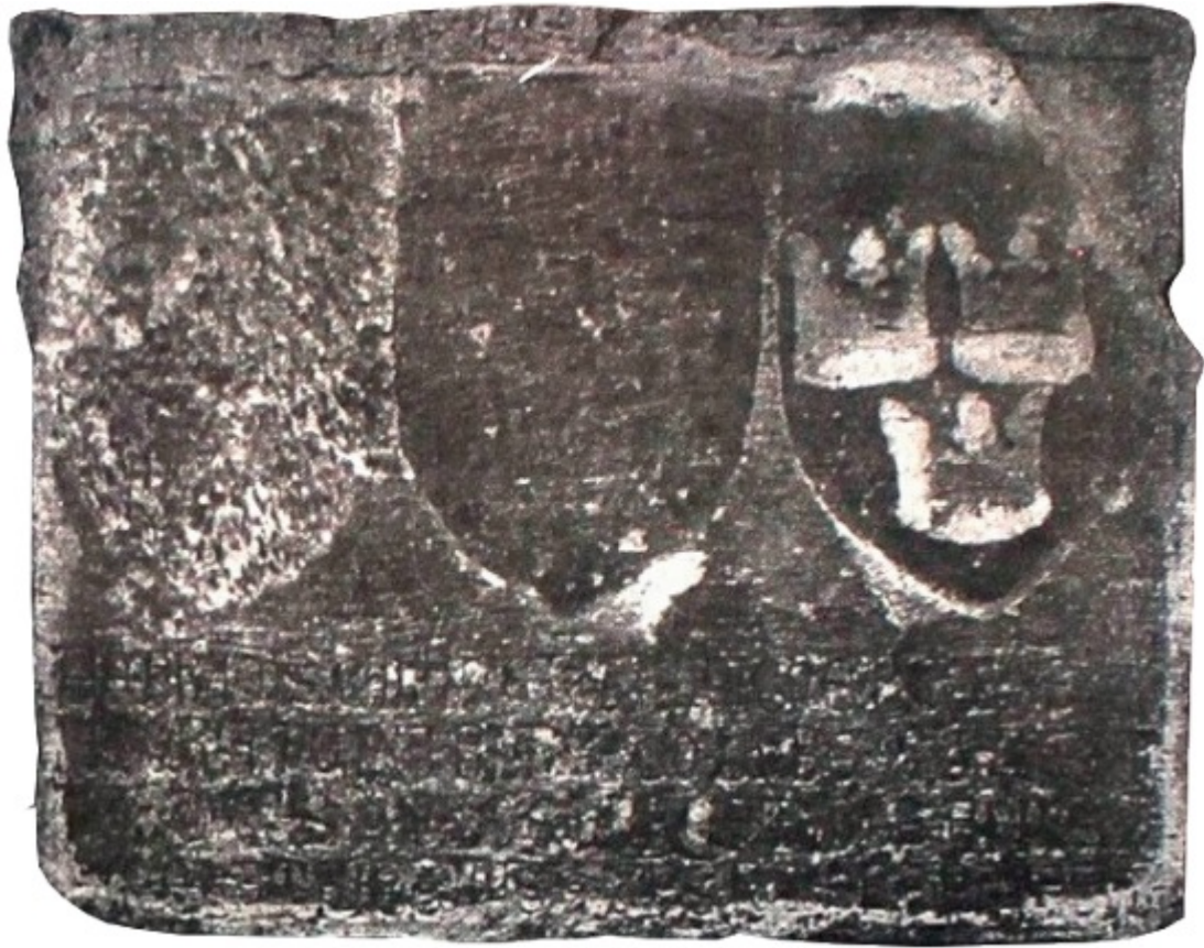
Fig. 4a: Construction slab with inscription dated 1430 that was documented on the coast of the Lagirio suburb (Rossi, Lapidari, 155).