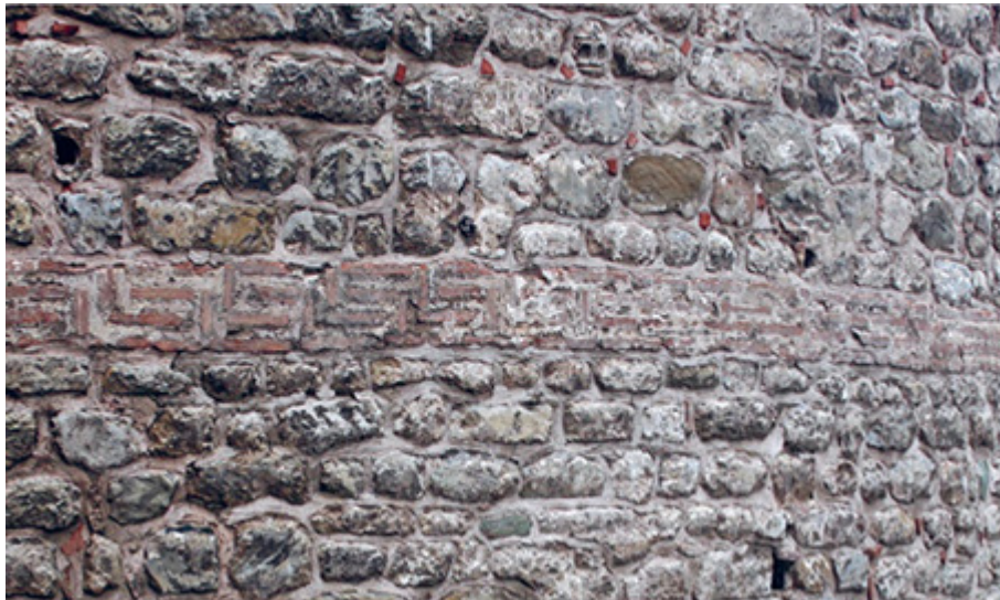
Fig. 12b: The SE point where the pattern of the brick course on the third floor of the Galata Tower differs, and also the diagonal crack on it. Photo: Hasan Sercan Sağlam, 2020.

Thus, the second brick course, which is located above the exterior masonry that differentiates with the first brick course below, also differentiates within itself and points to another, later architectural phase. In this case, on the exterior of the Galata Tower and above the part assumed to be from the Genoese period, there are actually at least two architectural phases rather than one. This situation has never been mentioned before.