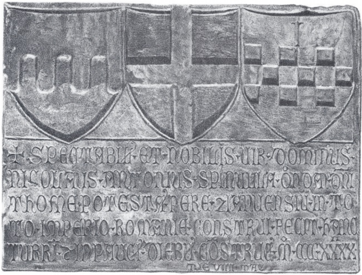
Fig. 7a: Construction slab dated 9 May 1442 that was documented on the first tower dedicated to Mary (Belgrano, Documenti, pl. 13).