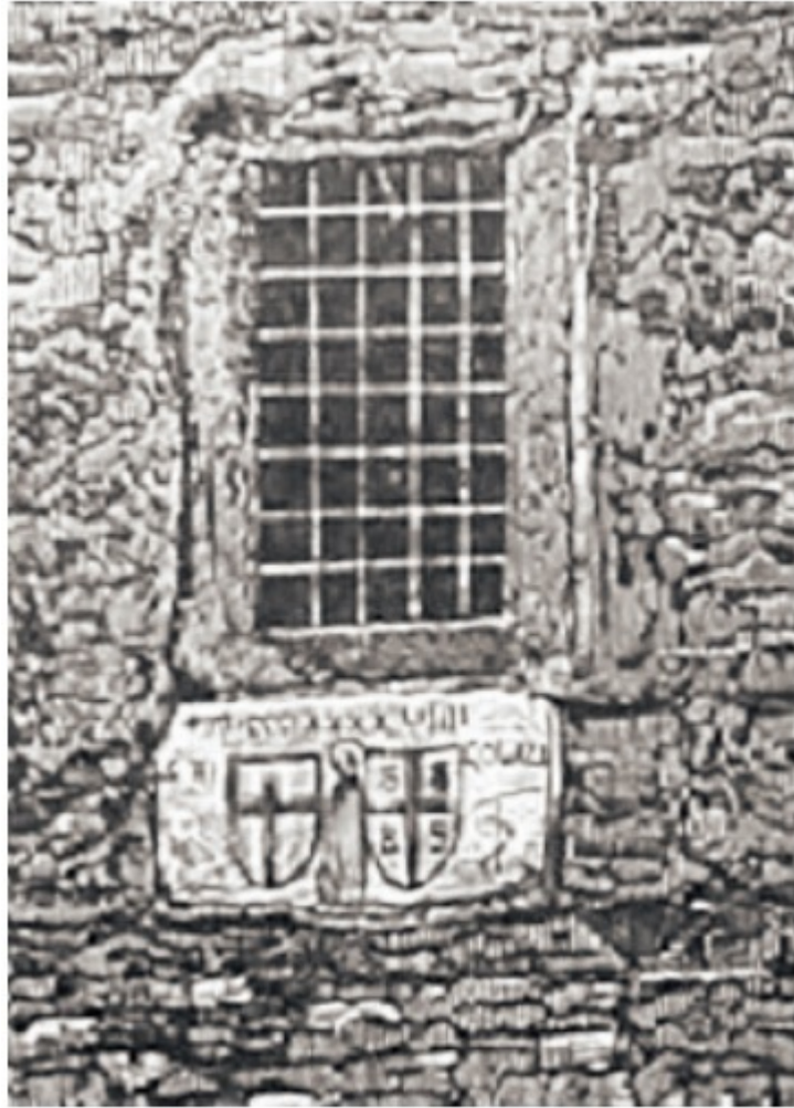
Fig. 6a: Construction slab dated 1349 with the bas-relief of Nicholas (Belgrano, Documenti, 324).