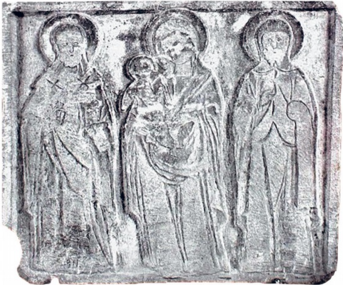
Fig. 7b: Slab with the bas-relief of Mary that was documented on the first tower dedicated to her (Rossi, Lapidi , fig. 7).