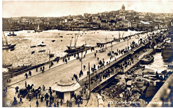
Fig. 1: View of Galata from Sirkeci, postcard. Neue Photographische Gesellschaft (NPG), 1900s. Suna and İnan Kiraç Foundation (SVIKV), IAE, FKA_00584.

Easily recognizable in the city silhouette with its tall and massive structure, the Galata Tower is one of the most famous historical buildings in Istanbul (fig. 1). It is located on a flat part of the hillside rising along the conical shaped topography in the Galata neighborhood of Beyoğlu district, which is on the northern side of the Golden Horn just across the Historical Peninsula. The tower stands out with its position dominating the region and its long observation range. Based on a single epigraphic source, common arguments regarding the origin of the Galata Tower emerged in the late eighteenth century. These were finalized by combining with some written and visual primary sources throughout the nineteenth century and have changed little since then. The tower has undergone many repairs and scientific studies on its architecture are generally dated to the twentieth century 2 .