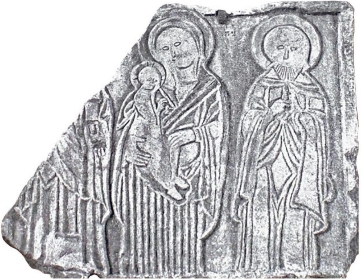
Fig. 7c: Slab with the bas-relief of Mary that was documented on the second tower dedicated to her (Rossi, Lapidi , fig. 8).