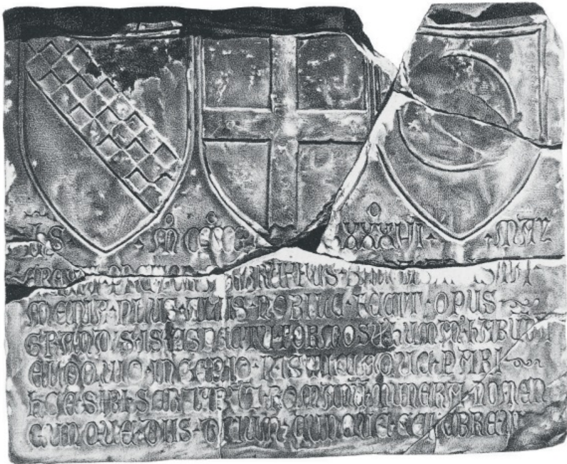
Fig. 4c: Construction slab with inscription dated May 1446 that was documented on the coast of the Lagirio suburb (Belgrano, Documenti, pl. 18).