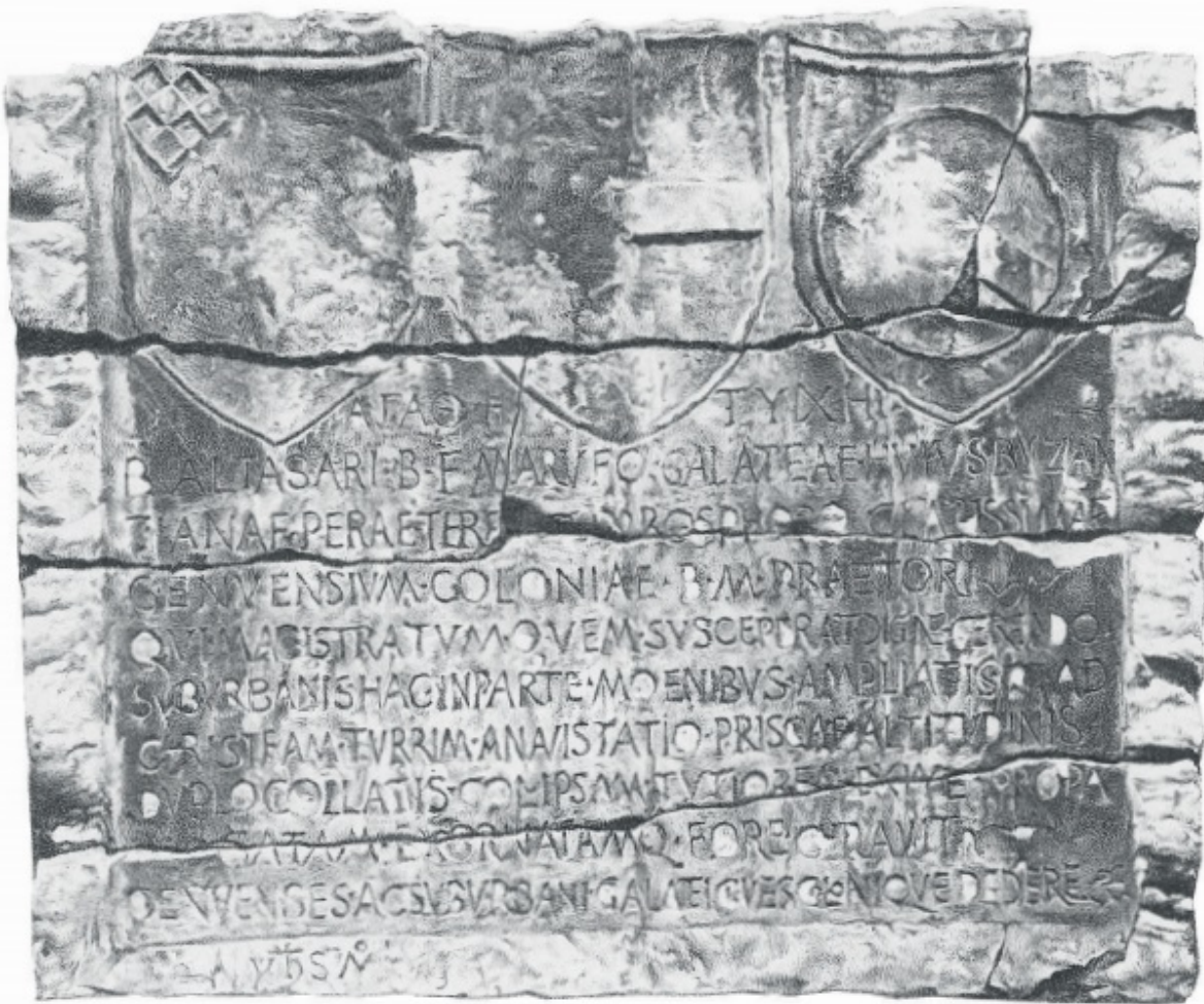
Fig. 4d: Construction slab with inscription dated 20 September 1446 that was documented on the coast of the Lagirio suburb (Belgrano, Documenti, pl. 19).