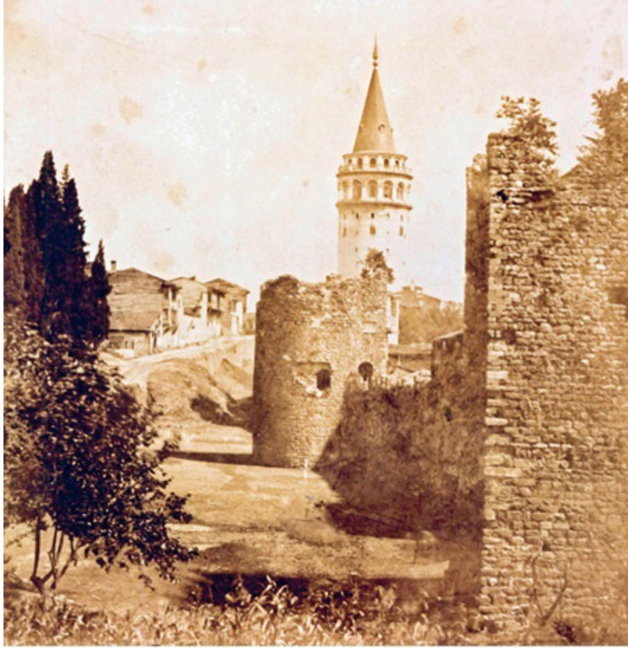
Fig. 3: View of the Galata Walls and Galata Tower from the northwest. Photo: James Robertson, 1854. SVIKV, IAE, FKA_005003.

Within the scope of the new urban planning works of the Sixth Department of the Municipality (Altıncı Daire-i Belediye) of Istanbul that was established in 1857, the walls began to be demolished in 1864 and the construction slabs were collected for display 71 . Based on the study of De Mas Latrie 72 that documented the architectural characteristics of the Galata Walls and some of the Genoese slabs on them, Wilhelm Heyd argued that the Ottoman destructions in 1453 could only have occurred on a partial and superficial scale 73 . On the other hand, some researchers claimed that the demolitions of Mehmed II were a “sign of sovereignty” 74 . However, the testimony of Khalkokondyles demonstrates that the destruction of the Pera fortifications was a security measure against a possible uprising. In this context, it was meaningful that the Genoese ambassadors first sought an opportunity to repair the walls in