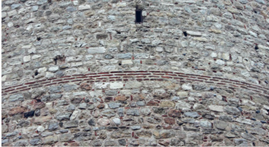
Fig. 11: The masonry technique that changes with the brick course on the second floor of the Galata Tower. Photo: Hasan Sercan Sağlam, 2020.

brown, dark gray and dark blue stones are distinctive. Stones are roughly square and the courses they form are irregular. On the section above the aforesaid brick course, there are no brick pieces between the stones, which are smaller than the ones below, rather well shaped and have horizontal rectangular shapes. The stone courses are relatively regular and horizontally better arranged. Limestone is the most common type and yellow and brown colored stones are almost completely absent, while dark gray and bluish ones are still present ().