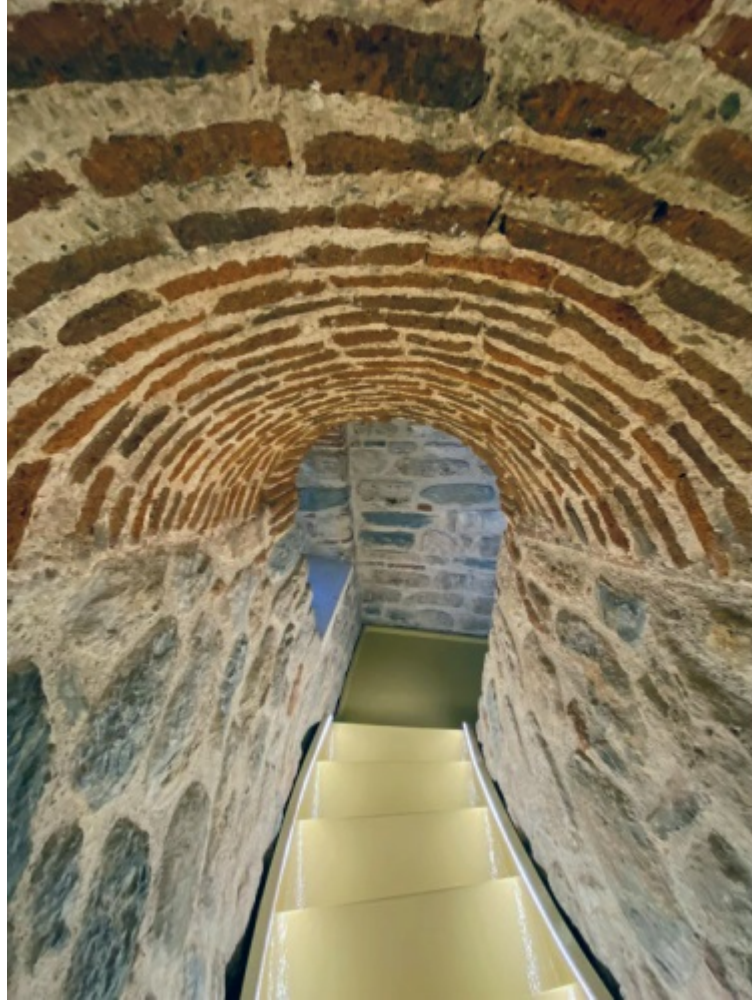
Fig. 9c: The brick vaulted gallery with stairs that continues from the ground floor to the fourth floor within the main walls of the Galata Tower.

Starting from the fourth floor, the floors are connected through a spiral-shaped wooden staircase that continues through the main interior space of the tower. The body walls, which are 3,75 meters thick until the fourth floor become thinner starting from this floor 140 . As the aforesaid brick vaulted gallery reduces the thickness of the body walls of the tower, it was positioned mainly towards the south, namely the direction of the safe colony. Thus, the body walls of the tower were positioned with full thickness against a possible enemy threat. The strong body walls of the Galata Tower were intended to resist heavy bombardment due to its protruding position on the frontline, which are much thicker than the average wall thickness of regular towers on the Galata Walls around 1,50-2,00 meters 141 . In addition, the average dimensions of the bricks used in the vaulted gallery in the interior of the first four floors of the Galata Tower show similarity to the average dimensions of the bricks used in the other