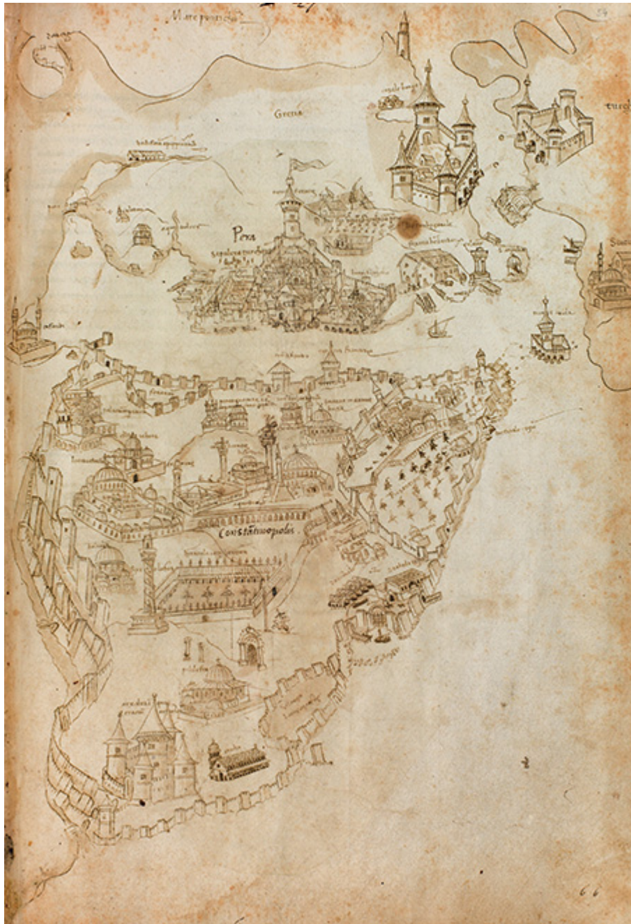
Fig. 14: The depiction of Constantinople by Buondelmonti (Buondelmonti, Liber insularum archipelagi , 1485–1490). Universitäts- und Landesbibliothek Düsseldorf, Ms. G 13, fol. 54 r .

For example, while the roof of the tower was a narrow and high cone surrounded by a series of battlements in the former copy, this roof is much lower and wider in the latter copy and the eaves protrude from the battlements. Moreover, the depiction in the Düsseldorf copy has a single course dividing the main body of the tower in half as if a repair trace, therefore bringing the destruction and repair of 1453 to mind, but this interpretation is only a superficial assumption for now.