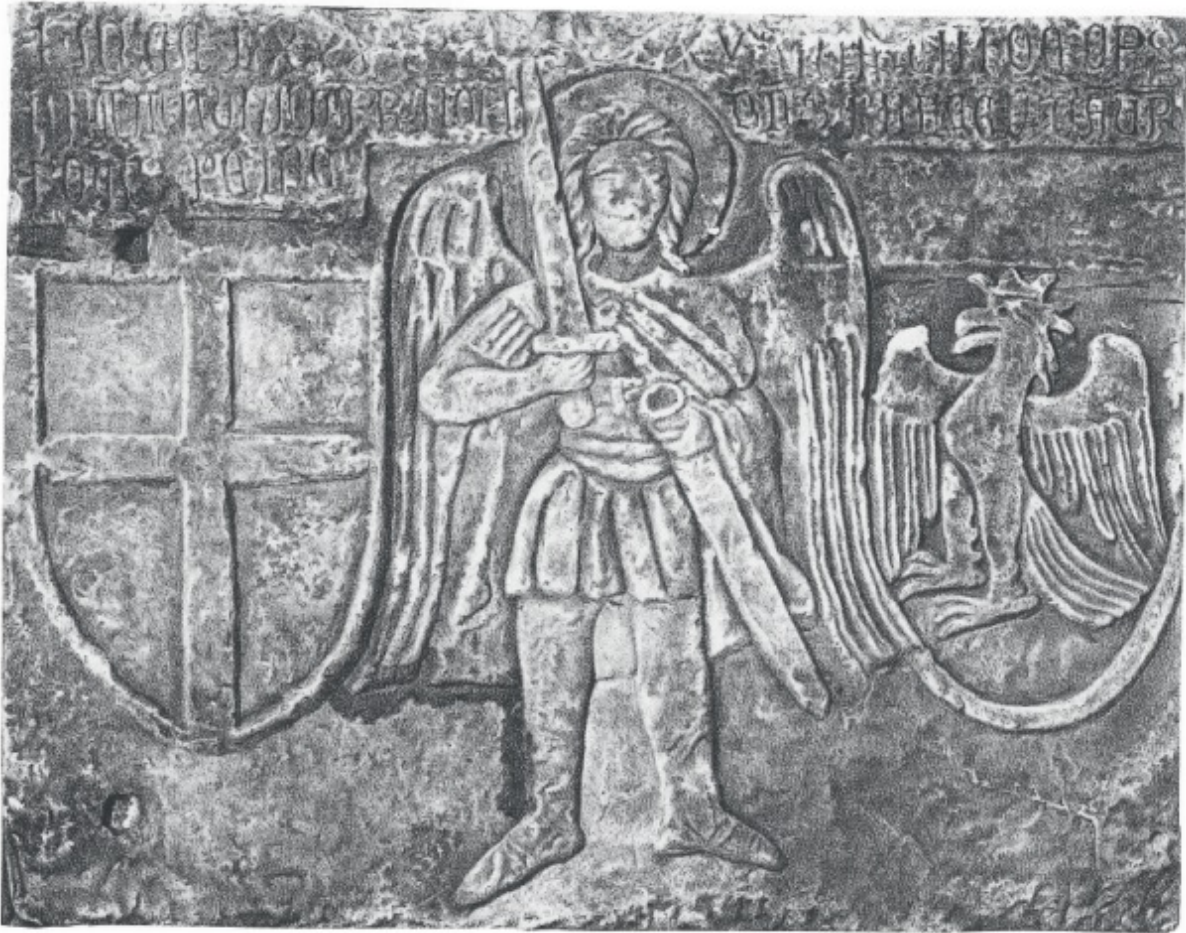
Fig. 6c: Construction slab dated 1387 with the bas-relief of Michael (Belgrano, Documenti, pl. 7).