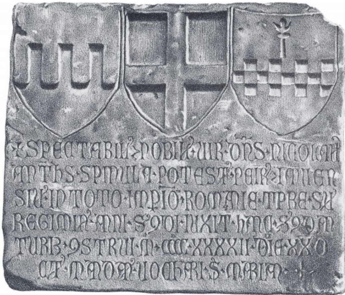
Fig. 7d: Construction slab dated 20 October 1442 that was documented on the second tower dedicated to Mary (Belgrano, Documenti, pl. 14).