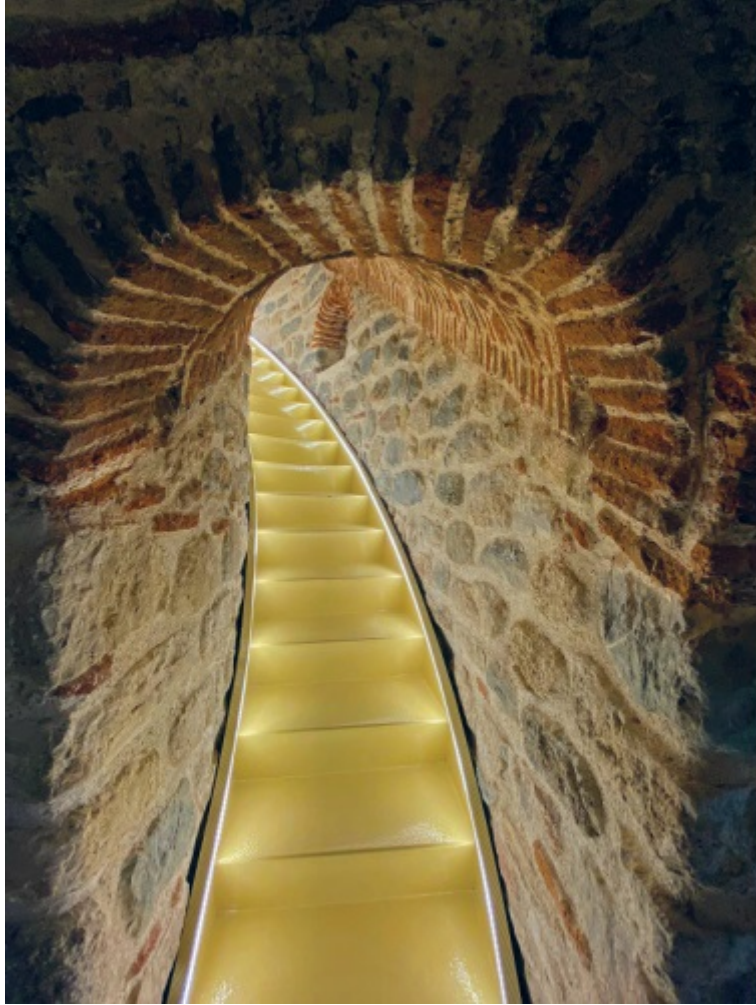
Fig. 9b: The brick vaulted gallery with stairs that continues from the ground floor to the fourth floor within the main walls of the Galata Tower. Photo: Hasan Sercan Sağlam, November 2020.