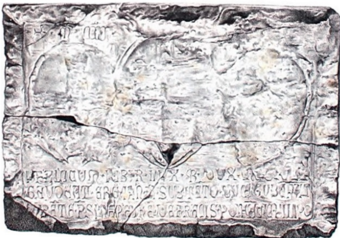
Fig. 4b: Construction slab with inscription dated 1431 that was documented on the coast of the Lagirio suburb (Belgrano, Documenti, pl. 10).

Three later slabs reveal that those first walls were significantly improved. An inscription dated May 1446 and documented on the Mumhane Gate states that Podestà Baldassare Maruffo raised these walls and performed “a more distinguished work than the others” (fig. 4c) 102 . The inscription dated 20 September 1446 and documented on the Eğri Gate further to the northeast was discussed above in detail (fig. 4d). The inscription dated 1447 and documented near the Eğri Gate shows that the improvements on these walls were only completed by the next podestà , Luchino De Fazio (fig. 4e) 103 . The reason why the first coastal walls completed in 1430-1431 were extensively improved roughly 15 years later, in 1446-1447, is unclear. Perhaps, this may have been needed in response to the increasing Ottoman threat.