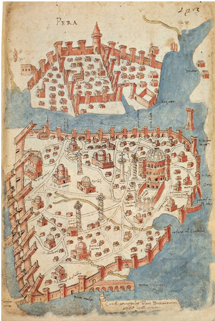
Fig. 13: The depiction of Constantinople by Buondelmonti (Buondelmonti, Liber insularum archipelagi , c. 1420). Biblioteca Nazionale Marciana, Ms. Lat. XIV.45 (=4595).