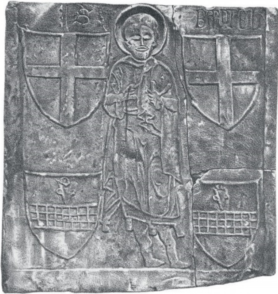
Fig. 6b: Construction slab dated c. 1420s with the bas-relief of Bartholomew (Belgrano, Documenti, pl. 15).