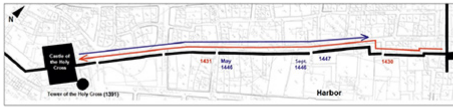
Fig. 5: Locations of the slabs documented on the coast of the Lagirio suburb and probable extents of the first construction and subsequent improvements along this course. Hasan Sercan Sağlam, 2020.

In this context, the “Tower of Christ” mentioned in the letter of Ciriaco as well as in the inscription of the slab dated 20 September 1446 composed by him should be the tower built in 1391 adjacent to the Castle of the Holy Cross on the southwestern coast of the Lagirio suburb, which was called the “Tower of the Holy Cross” according to the Genoese archival documents. The “Tower of Christ” is seemingly a literary expression to describe that structure, probably because of the cross-bearing orb ( globus cruciger ) on its top as the sign of Jesus 105 . The ones whose height had been doubled were the coastal walls between the eastern harbor and this tower. Similarly, the witnesses of the Siege of Constantinople (1453) also used some descriptions for the Galata Tower instead of its name. The literary expression “Tower of Christ” is also consistent when considered the pompous style in the long inscription of Ciriaco, especially when addressing the Pera colony and Baldassare Maruffo.