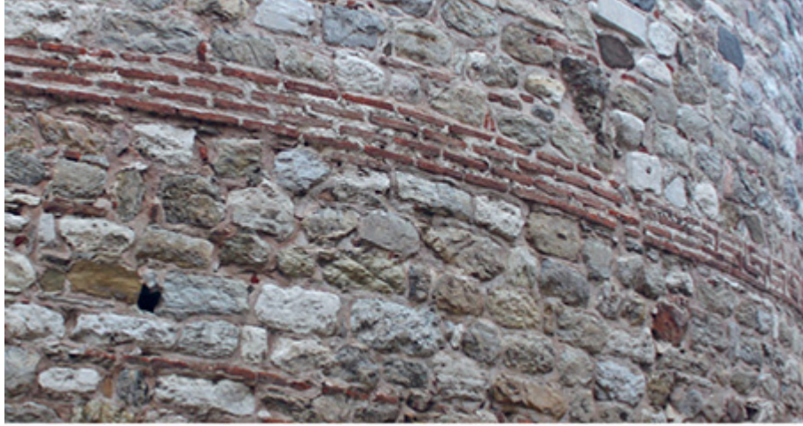
Fig. 12a: The SW point where the pattern of the brick course on the third floor of the Galata Tower differs, and also the diagonal crack on it.