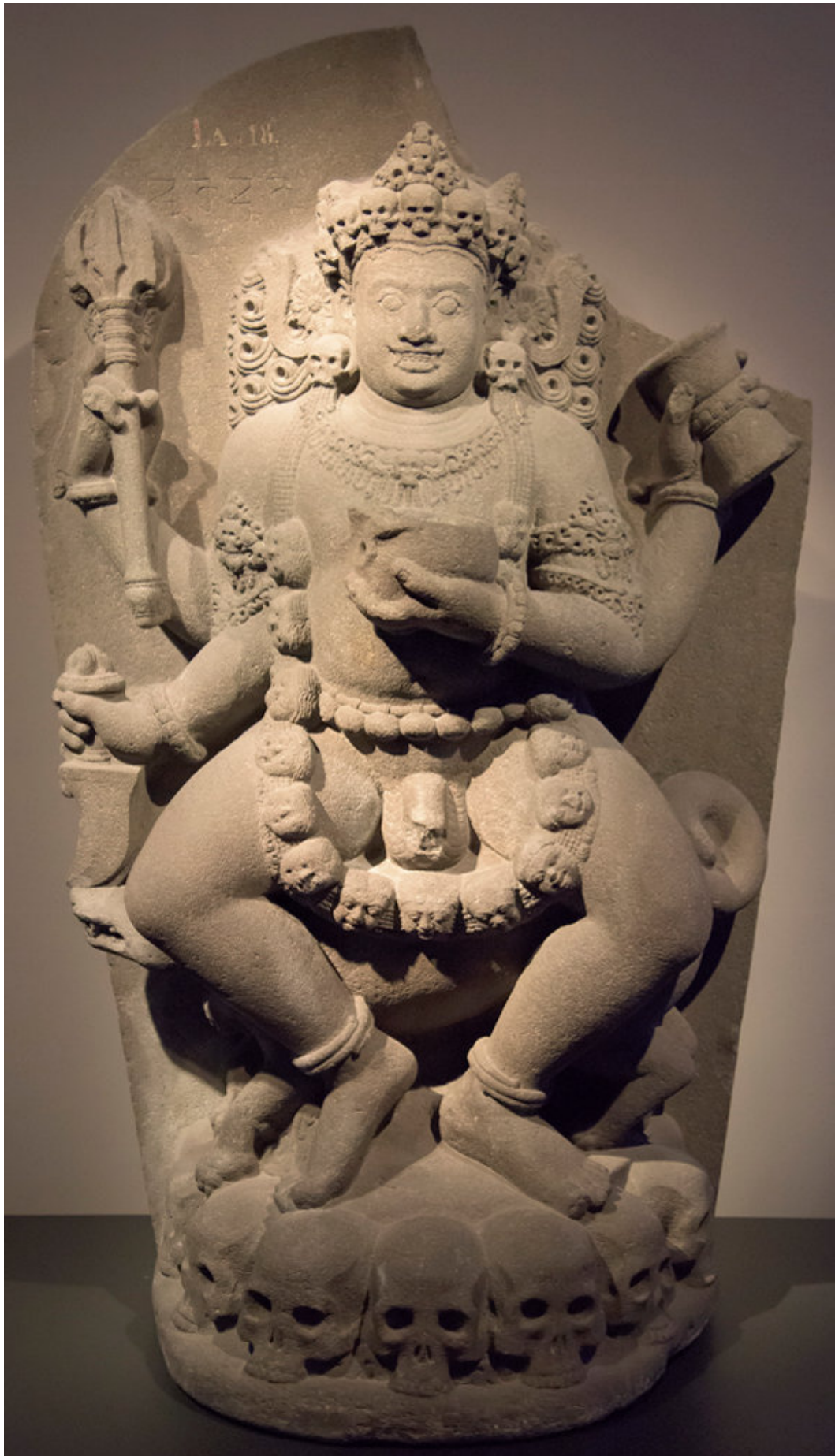
Figure 5 Bhairava of Candi Singosari, East Java, Leiden Museum of Ethnology.