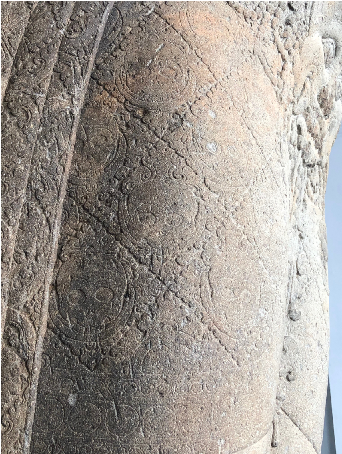
Figure 7 Candrakapāla emblems on the sarong of the Padang Roco Mahākāla. Jakarta, Museum Nasional Republik Indonesia.