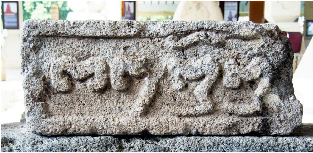
Figure 9 Inscribed stone block recording the date 1254 śaka (1332 CE), recovered from Candi Jawi, now kept at the Trowulan Museum, East Java.

placement, we find it remarkable that around that year Ādityavarman had already started his political career in East Java (under the reign of Queen Tribhuanā, Kṛtarājasa’s daughter), and certainly had access to ships because of his prominent position at court—indeed, he might even have visited the Yuan court in the capacity as a diplomatic envoy in 1332, exactly one year after the disappearance of the statue (see infra , fn. 81). Assuming that the ‘Śiva-Buddha’ statue of Jawi was actually the Padang Roco icon, one could speculate that the statue was removed from the temple and sent to Sumatra by ship by Ādityavarman, just like the Amoghapāśa statue lying nearby in Padang Roco was sent by Kṛtanagara.