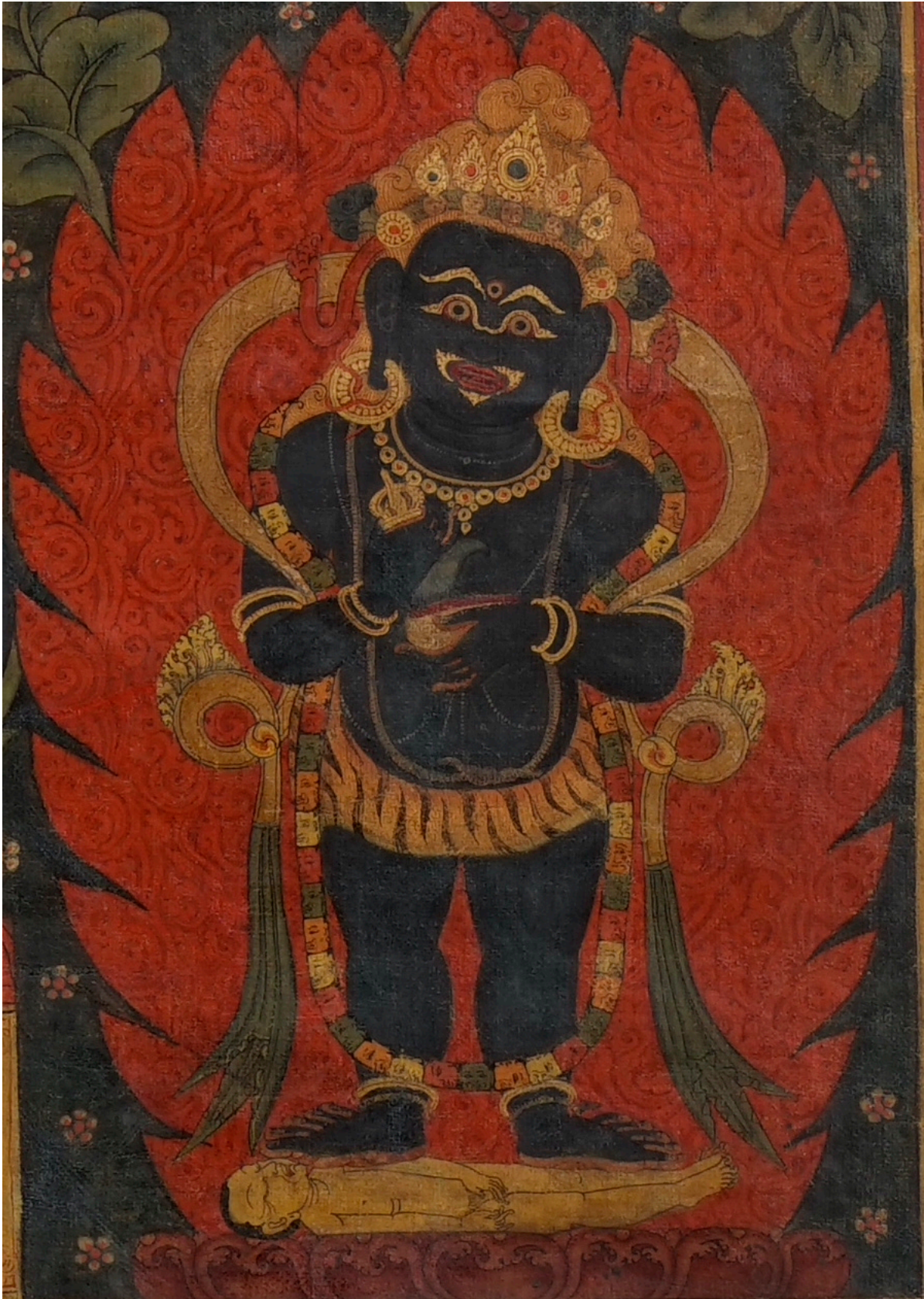
Figure 3 Early form of Mahākāla *Pañjaranātha, Lord of the Sa skya lineage of Gayādhara paṇḍita. Particular of figure 2 (bottom-right)