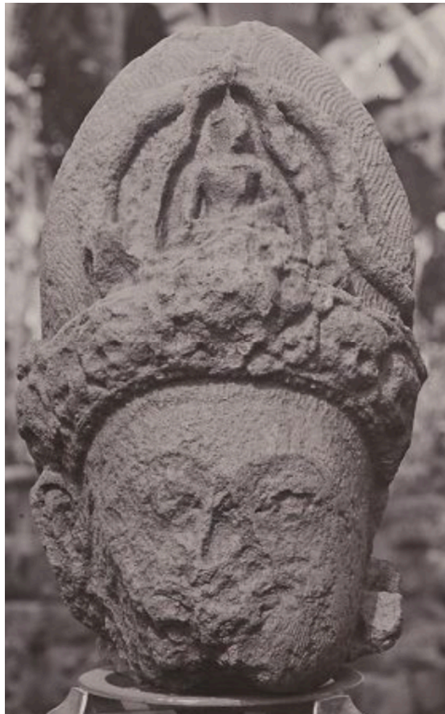
Figure 6 Head of Mahākāla, Candi Jago