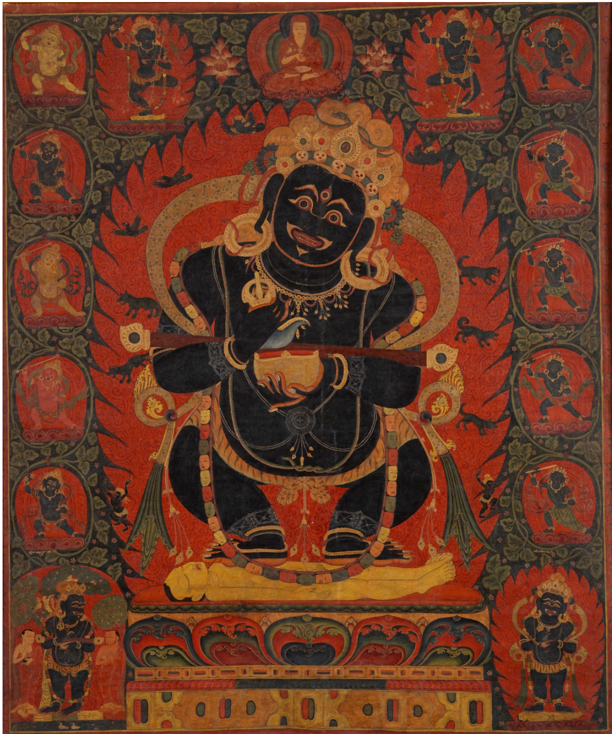
Figure 2 Gur gyi mgon po/Mahākāla *Pañjaranātha, painting on cotton, Tibet, fifteenth century. Collection Navin Kumar, New York.