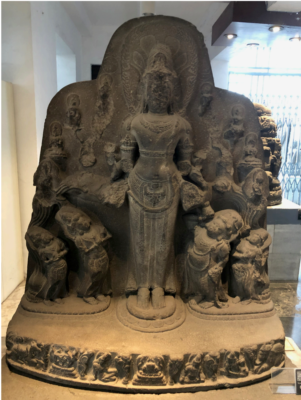
Figure 8 Amoghapāśa Lokeśvara, originally found at Padang Roco, Sungai Langsat, Sumatra. Jakarta, Museum Nasional Republik Indonesia.