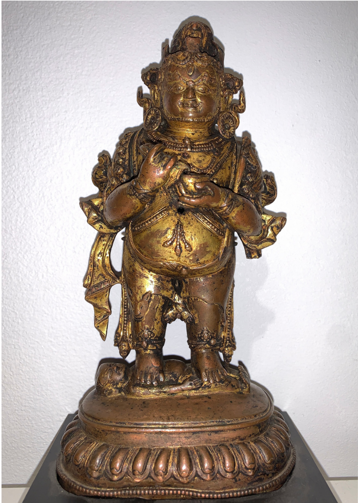
Figure 4 A gilt copper figure of Gur gyi mgon po/Mahākāla *Pañjaranātha, Tibet or Nepal, thirteenth to fourteenth century. Collection Navin Kumar, New York.