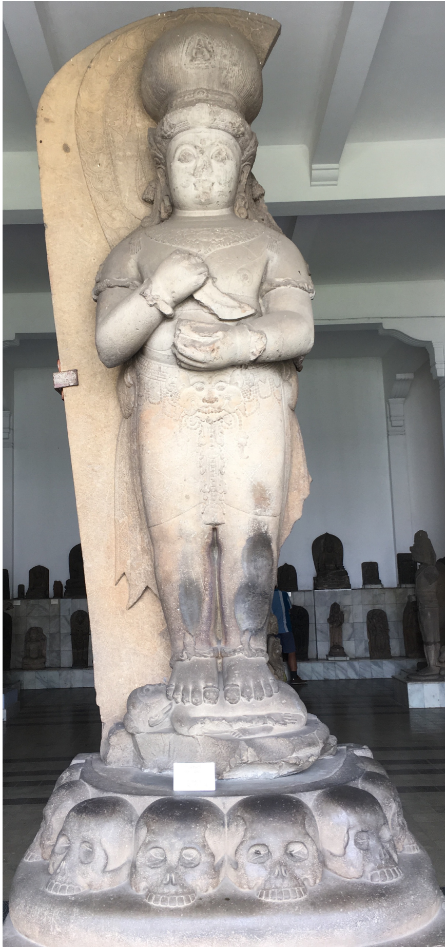
Figure 1 Colossal statue representing Kṛtanagara as an emanation of Mahākāla(-Bhairava?), Padang Roco/Sungai Langsat, Sumatra. Jakarta, Museum Nasional Republik Indonesia.