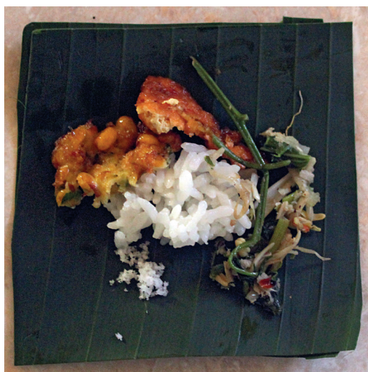
Fig. 1a — A saiban offering, consisting of a small portion of the food cooked for the family for that day.