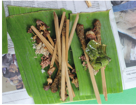
Fig. 14 — Shows two larger squares of palm leaf with larger numbers of sate . The one to the top also holds a special meat ball wrapped in green termed a calon agung .