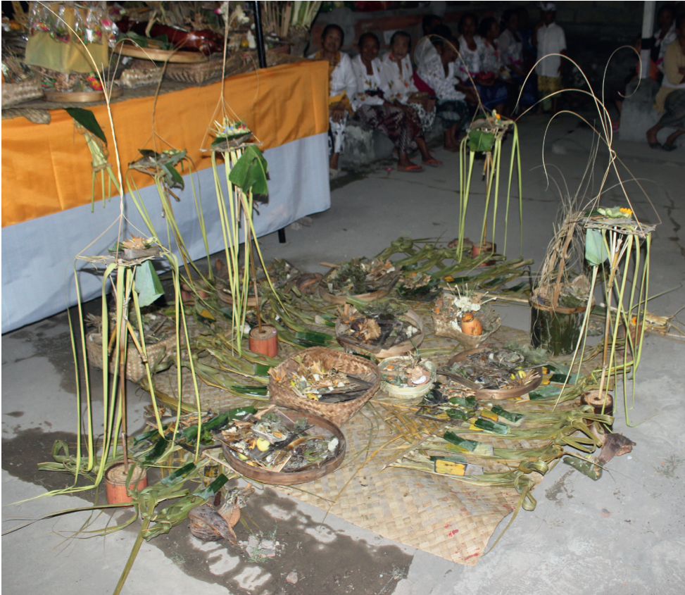
Fig. 8 — A panca sata caru – a caru using five chickens – held during rituals at the Mertsari temple, Pengosekan, Ubud. The five carus can be identified by the five sangga cucuk stands placed in five directions, north, to the bottom left of the photo, east to the top left, south to the top right, and west to the right. The sengkwil mats with the packets of sate can be identified at the bottom of the sangga cucuk , the numbers arranged according to the urip for each direction – four to the north and seven to the west are clearly visible as dark green rectangles placed on the light green palm leaf sengkwil . The position of the caru offerings on the ground in relation to the offerings on the raised platform covered with yellow and white cloth, which will later be offered to the gods, is clear. The wet patches of ground visible around the caru offerings show that the libations of arak , brem and water have been made over them.

As is clear from even the brief description and the few photos provided here, offerings for “demons” in Bali are arranged no less carefully and artistically than any other offerings. Far from consisting of a contemptuous tossing of scraps on the ground, offerings to the demonic forces are determined by the Balinese model of the universe, the nava saña , being specifically linked by the symbolism of direction, colour, and number used in the offerings. However, what might be the purpose of all this is only implied in the ritual actions. Without the textual sources about to be considered, it would be difficult to say more on the basis of observation alone, or to make much sense of participants’ commentaries. While there is no lack of Balinese commentary in the form of the recent publications in Indonesian referred to earlier (cf. note 12), they hardly constitute as yet a coherent body of interpretation, and may be indicative of modern revisionism rather than (or besides) reflecting a long-standing relationship between ritual and text. The sources we are going to examine