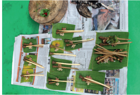
Fig. 15 — Shows all the meat items composing the caru laid out together, the chicken skin with head and feathers ( layang-layang ), the eight small packets of lawar and sate , the two larger piles of sate , plus one small additional spare ketengan .

sapu lidi , and talud (fig. 19), and the circling of the offerings to the left (figs. 6 and 7). The Tutur Ləbur Gañsa further states clearly that the meat of the five-coloured chicken must be arranged according to the correct colour, ritual number ( urip ), and direction (ed. PusDok, p. 10), leaving no doubt of the intentionality of the arrangement according to the nava saña . Both texts refer to a five chicken ( panca sata ) caru (fig. 8) and a caru for the nine directions (fig. 9), as well as many other different kinds of caru depending on special circumstances.