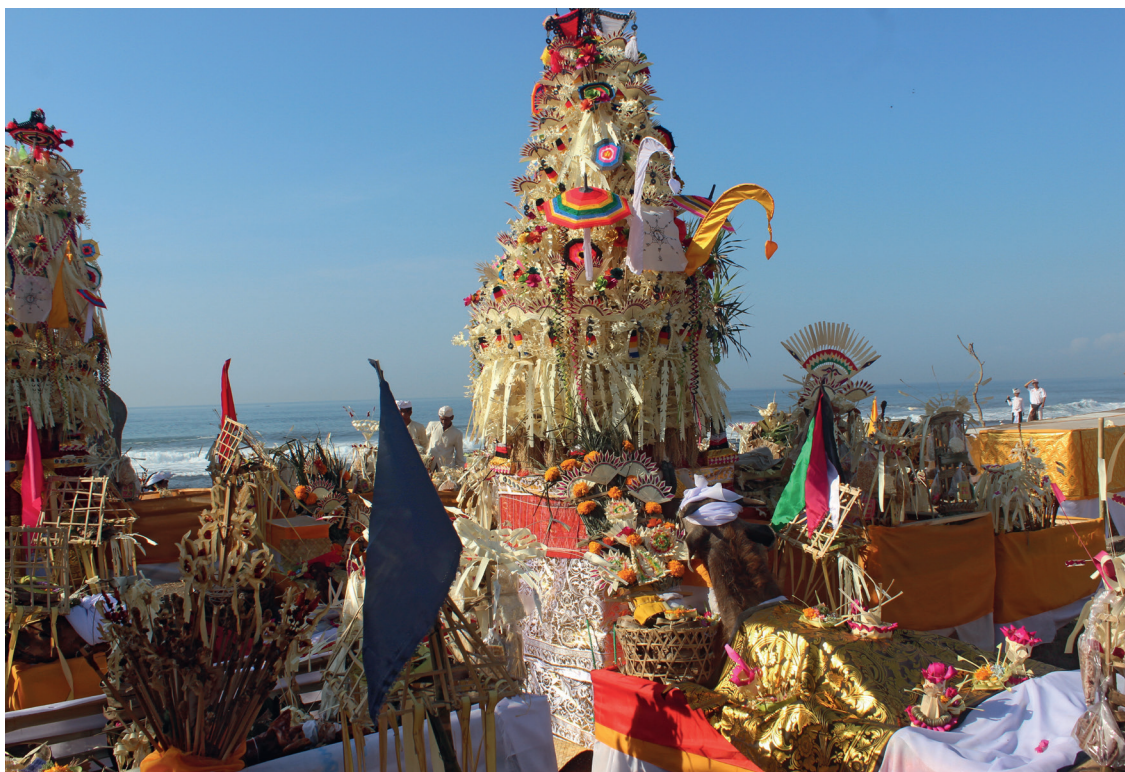
Fig. 9 — A caru for the nine directions, held at the beach as part of a large purification ( malasti ) for an Ubud temple, Pura Gunung Lebah. The photo reveals that the caru , which is properly termed a tawur agung at this level of complexity, is part of a great many offerings. It is arranged on the ground at the base of the tall tower-like structure seen in the middle of the photo which holds offerings ( bagia ) for the gods ( dewa ). Coloured flags placed in the ground mark the nine directions; here black for the north, pink for the south east, red for the south, and five colours ( brumbun ) for the centre, are visible, as also is the animal victim, a buffalo calf, laid out to the side of the five-coloured flag in the centre. The animal victim, with the head wrapped in white cloth and the legs and body covered with gold-figured cloth ( kain prada ), has been skinned, with the head and legs left attached, like the chicken used in smaller caru . Each flag is attached to a sanggar cucuk stand, but these are hardly visible in the mass of offerings, although they can be glimpsed under the black and five-coloured flags.

here are, therefore, Old Javanese texts dealing with bhūṭayajñas , which are likely to contain elements predating the reformists' influences that started to make a noticeable impact on Balinese Hinduism from the 1940s onwards.