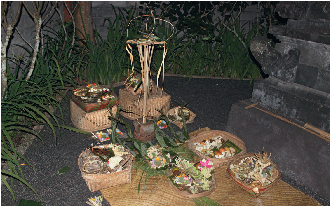
Fig. 2b — Offerings for a caru eka sata held as part of an odalan for a house temple, demonstrating the basic pattern of arrangement of the caru offerings.