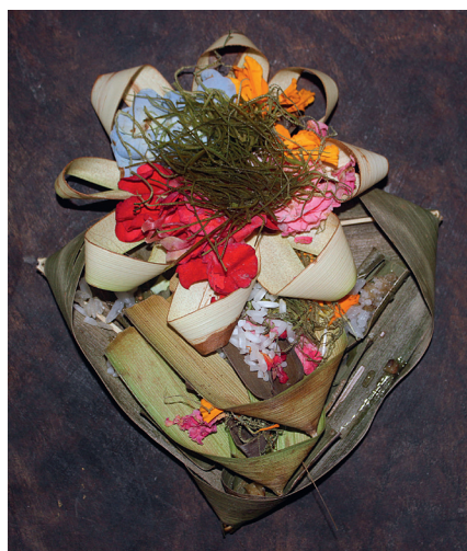
Fig. 1b — A segehan offering containing cooked rice, salt, onion and ginger. A canang offering is placed on the top.

When offerings to the bhūtakālas are mentioned, it is usually caru offerings that are meant and there are many different kinds and levels. Depending on the level of complexity, carus require the services of one or more pemangku (village priests) or pedanda (Brahmana priests). The occasions on which caru might be offered are numerous: according to regular calendrical conjunctions of time (e.g. Bal. Galungan/OJ Galuṅan, Bal. Tawur Kasanga/OJ Tawur Kasaṅa) following the appearance of particular omens, following natural disasters such as plagues or floods, or just persistent misfortune and trouble in the household. They are always offered prior to undertaking other rituals, especially those performed for the gods ( devayajña ), rendering them the most frequently performed of all Balinese rituals. The pervasiveness and importance of caru rituals in contemporary Balinese life is evident to any informed observer and further demonstrated by the number of popular publications by Balinese on the topic. 12 This importance is also indicated by the fact that many myths concerning the origin of caru offerings are to be found in Old Javanese texts (Stephen 2002: 73–75; 2005: 59ff.); 13 and that the various Balinese publications on the topic indicate that these origin myths are known to many Balinese authors (e.g., Arwati 2008: 9–12;