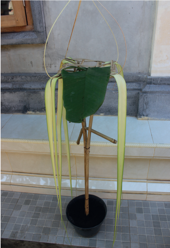
Fig. 20 — The sanggar cucuk stand, which every caru must have, hung with the talunjungan , the end of a banana leaf resembling a tongue, strips of palm leaf and underneath it, two bamboo sections containing arak and brem , alcoholic beverages.

One important aspect of caru and the bhūṭayajñas that we will not attempt to deal with in this article is the various forms of performance – including masked dances, songs and recitations, and shadow puppet theatre – that usually accompany larger caru rituals (Stephen 2002: 77–81) but are omitted in small domestic observances such as the caru eka sata described here. Indeed the origin of the wayang kulit theatre is explained in the myth of the origin of caru (Stephen 2002: 75) as taking place when the Tri Samaya (Brahmā, Viṣṇu, and Īśvara) taught the King of Galuh how to make caru offerings. The three texts that are the focus of this article do not mention theatrical performances and to follow up this aspect of the bhūṭayajñas would require venturing into too broad an area of as yet little known territory, so we must regretfully put it to one side for the time being.