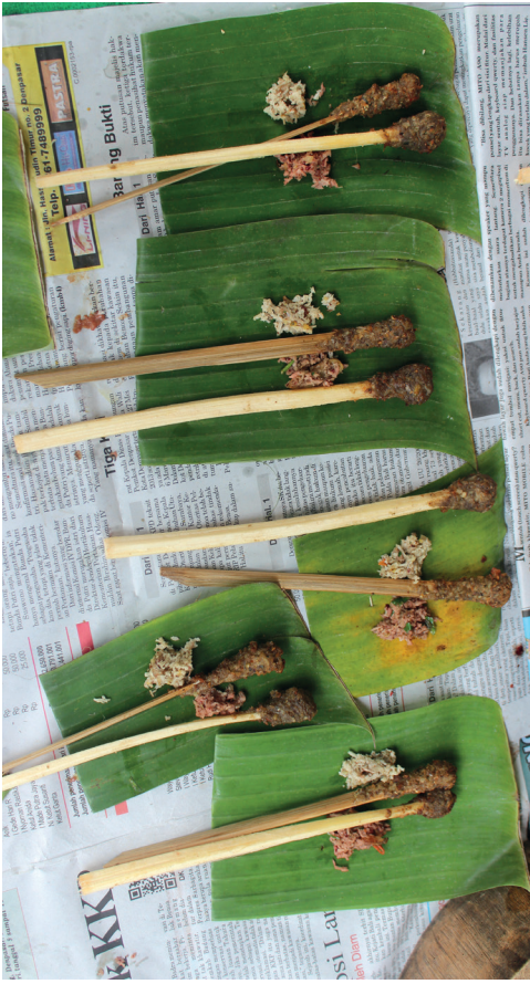
Fig. 13 — Shows the sate of two kinds, sate lambat and sate empol , being placed with the lawar on the eight ketengan , palm leaf squares.