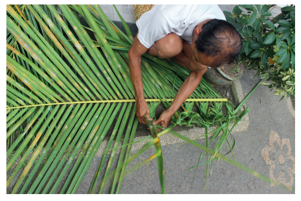
Fig. 16 — The eight ketengan must be wrapped up to form bundles which are finally placed on an elaborately woven mat of palm leaf called a sengkwi . This photo shows the sengkwi being woven. For an eka sata caru , the sengkwi must have eight divisions. The sengkwi with the eight bundles of sate and lawar can be seen in figure 2a, and is number 2 on the accompanying key.