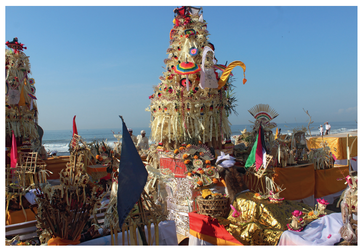
Fig. 9 — A caru for the nine directions, held at the beach as part of a large purification ( malasti ) for an Ubud temple, Pura Gunung Lebah. The photo reveals that the caru , which is properly termed a tawur agung at this level of complexity, is part of a great many offerings. It is arranged on the ground at the base of the tall tower-like structure seen in the middle of the photo which holds offerings ( bagia ) for the gods ( dewa ). Coloured flags placed in the ground mark the nine directions; here black for the north, pink for the south east, red for the south, and five colours ( brumbun ) for the centre, are visible, as also is the animal victim, a buffalo calf, laid out to the side of the five-coloured flag in the centre. The animal victim, with the head wrapped in white cloth and the legs and body covered with gold-figured cloth ( kain prada ), has been skinned, with the head and legs left attached, like the chicken used in smaller caru . Each flag is attached to a sanggar cucuk stand, but these are hardly visible in the mass of offerings, although they can be glimpsed under the black and five-coloured flags.

here are, therefore, Old Javanese texts dealing with bhūtayajñas , which are likely to contain elements predating the reformists' influences that started to make a noticeable impact on Balinese Hinduism from the 1940s onwards.