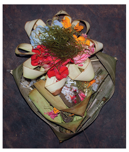
Fig. 1b — A segehan offering containing cooked rice, salt, onion and ginger. A canang offering is placed on the top.

When offerings to the bhūtakālas are mentioned, it is usually caru offerings that are meant and there are many different kinds and levels. Depending on the level of complexity, carus require the services of one or more pemangku (village priests) or pedanda (Brahmana priests). The occasions on which caru might be offered are numerous: according to regular calendrical conjunctions of time (e.g. Bal. Galungan/OJ Galunan, Bal. Tawur Kasanga/ OJ Tavur Kasana) following the appearance of particular omens, following natural disasters such plagues or floods, or just persistent misfortune and trouble in the household. They are always offered prior to undertaking other rituals, especially those performed for the gods ( devavajña ), rendering them the most frequently performed of all Balinese rituals. The pervasiveness and importance of caru rituals in contemporary Balinese life is evident to any informed observer and further demonstrated by the number of popular publications by Balinese on the topic.12 This importance is also indicated by the fact that many myths concerning the origin of caru offerings are to be found in Old Javanese texts (Stephen 2002: 73-75; 2005: 59ff.);<sup>13</sup> and that the various Balinese publications on the topic indicate that these origin myths are known to many Balinese authors (e.g., Arwati 2008: 9–12;