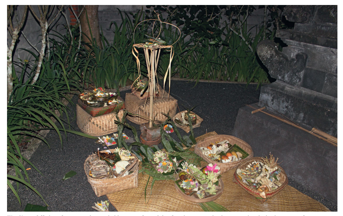
Fig. 2b — Offerings for a caru eka sata held as part of an odalan for a house temple, demonstrating the basic pattern of arrangement of the caru offerings.