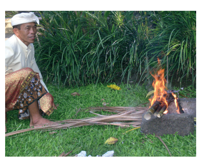
Fig. 3 — The three sticks of bamboo ( tatimpug ) being burnt on a fire to make them explode, signaling the beginning of the caru .