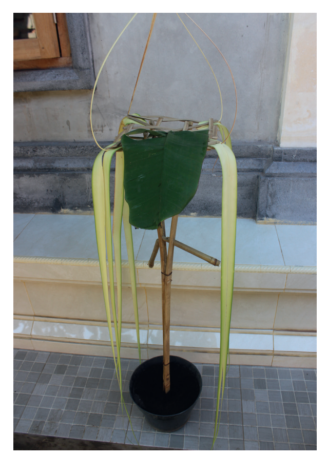
Fig. 20 — The sanggar cucuk stand, which every caru must have, hung with the talunjungan, the end of a banana leaf resembling a tongue, strips of palm leaf and underneath it, two bamboo sections containing arak and brem, alcoholic beverages.

One important aspect of caru and the bhūtayajñas that we will not attempt to deal with in this article is the various forms of performance - including masked dances, songs and recitations, and shadow puppet theatre – that usually accompany larger caru rituals (Stephen 2002: 77-81) but are omitted in small domestic observances such as the caru eka sata described here. Indeed the origin of the wayang kulit theatre is explained in the myth of the origin of caru (Stephen 2002: 75) as taking place when the Tri Samaya (Brahmā, Visnu, and Isvara) taught the King of Galuh how to make caru offerings. The three texts that are the focus of this article do not mention theatrical performances and to follow up this aspect of the bhūtayajñas would require venturing into too broad an area of as yet little known territory, so we must regretfully put it to one side for the time being.