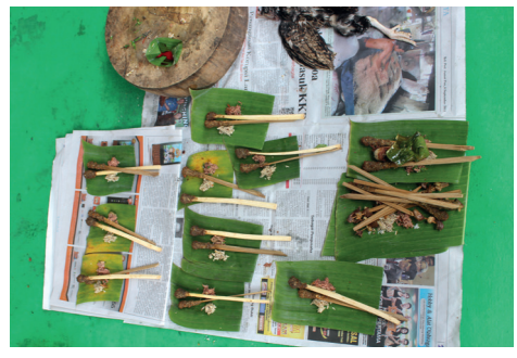
Fig. 15 — Shows all the meat items composing the caru laid out together, the chicken skin with head and feathers ( layang-layang ), the eight small packets of lawar and sate , the two larger piles of sate , plus one small additional spare ketengan .

sapu lidi , and talud (fig. 19), and the circling of the offerings to the left (figs. 6 and 7). The Tutur Ləbur Gańsa further states clearly that the meat of the five-coloured chicken must be arranged according to the correct colour, ritual number ( urip ), and direction (ed. PusDok, p. 10), leaving no doubt of the intentionality of the arrangement according to the nava saňa . Both texts refer to a five chicken ( panca sata ) caru (fig. 8) and a caru for the nine directions (fig. 9), as well as many other different kinds of caru depending on special circumstances.