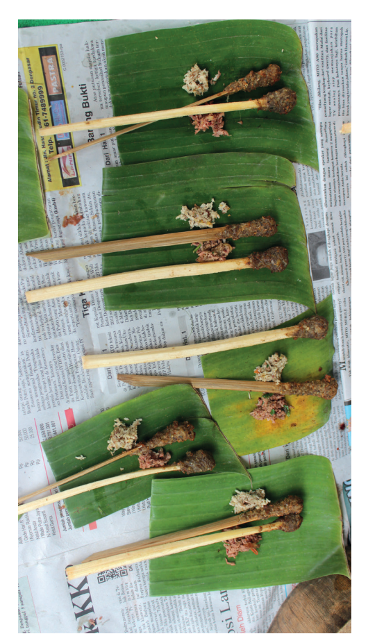
Fig. 13 — Shows the sate of two kinds, sate lembat and sate empol, being placed with the lawar on the eight ketengan, palm leaf squares.