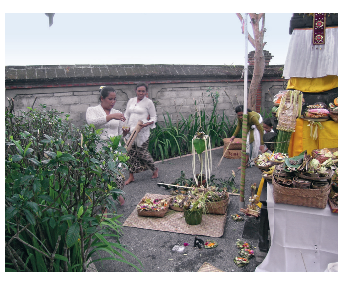
Fig. 7 — The close of the caru , showing the offerings knocked over and dismantled, and the laughter of the participants.

and a woman and child, family members, circle from left to right (prasawva) the caru offerings, holding the kentongan, sapu lidi and talud (see fig. 19). The woman leading the group is sprinkling holy water with a flower. The position of the caru offerings in relation to the offerings for the gods, which are raised up on a table and the padmāsana, is clear in this photo.