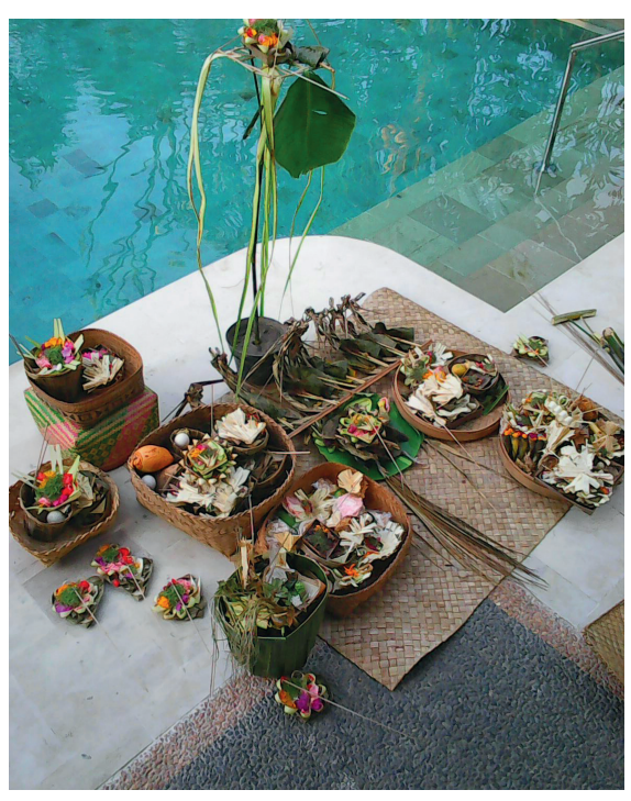
Fig. 2c — Offerings set out for a caru eka sata prior to malaspas (purification) for a new house, showing the basic pattern of arrangement of the caru offerings set out in front of the priest.