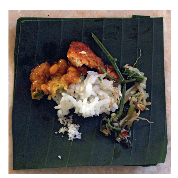
Fig. 1a — A saiban offering, consisting of a small portion of the food cooked for the family for that day.