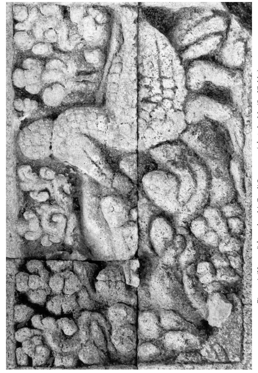
Figure 4. 'Heron, fish, and crab', Caṇḍi Surowono