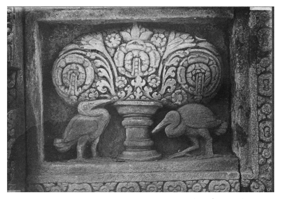
Figure 8. Herons, Caṇḍi Garuda, Loro Jonggrang (OD photo 4376)