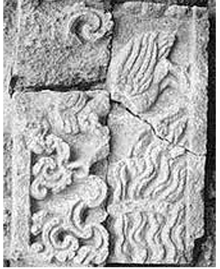
Figure 2. 'Heron, fish, and crab', Caṇḍi Jago (OD photo 68)