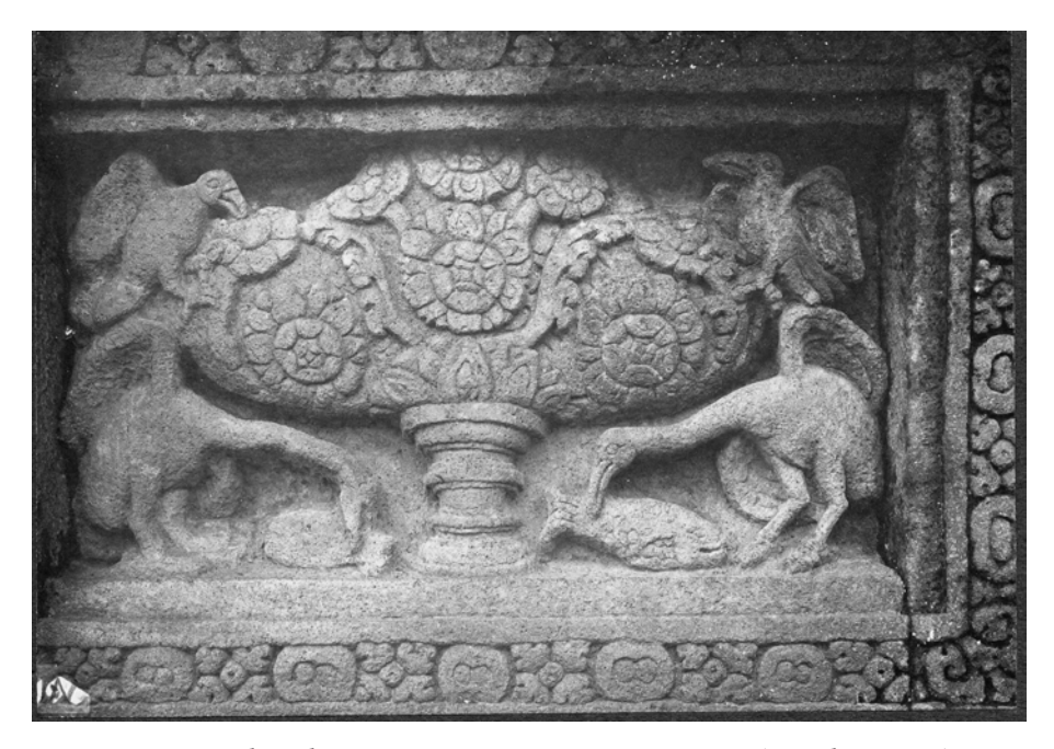
Figure 7. Fishing herons, Candi Nandi, Loro Jonggrang (OD photo 4367)