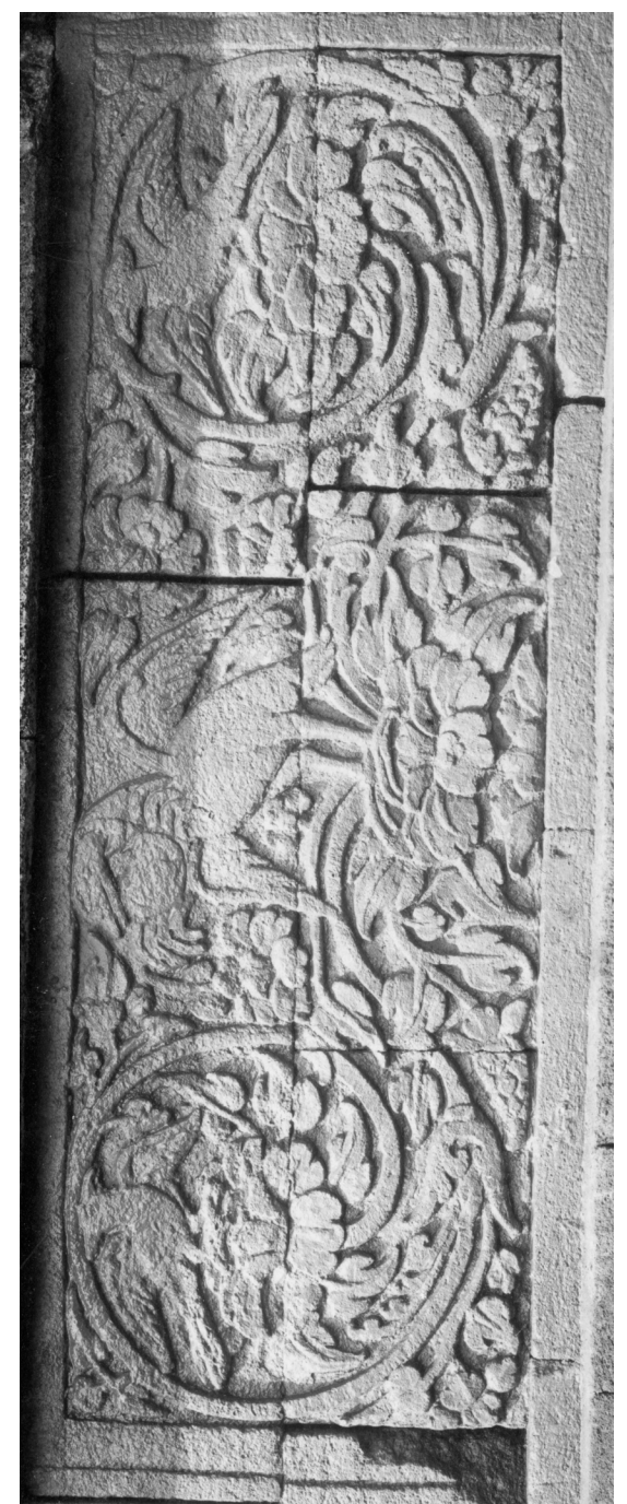
Figure 1. 'Heron, fish, and crab', Caṇḍi Mendut