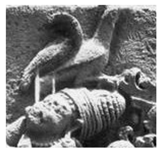
Figure 6a. Two birds standing on top of Rāwaṇa's headdress (detail from Figure 6)