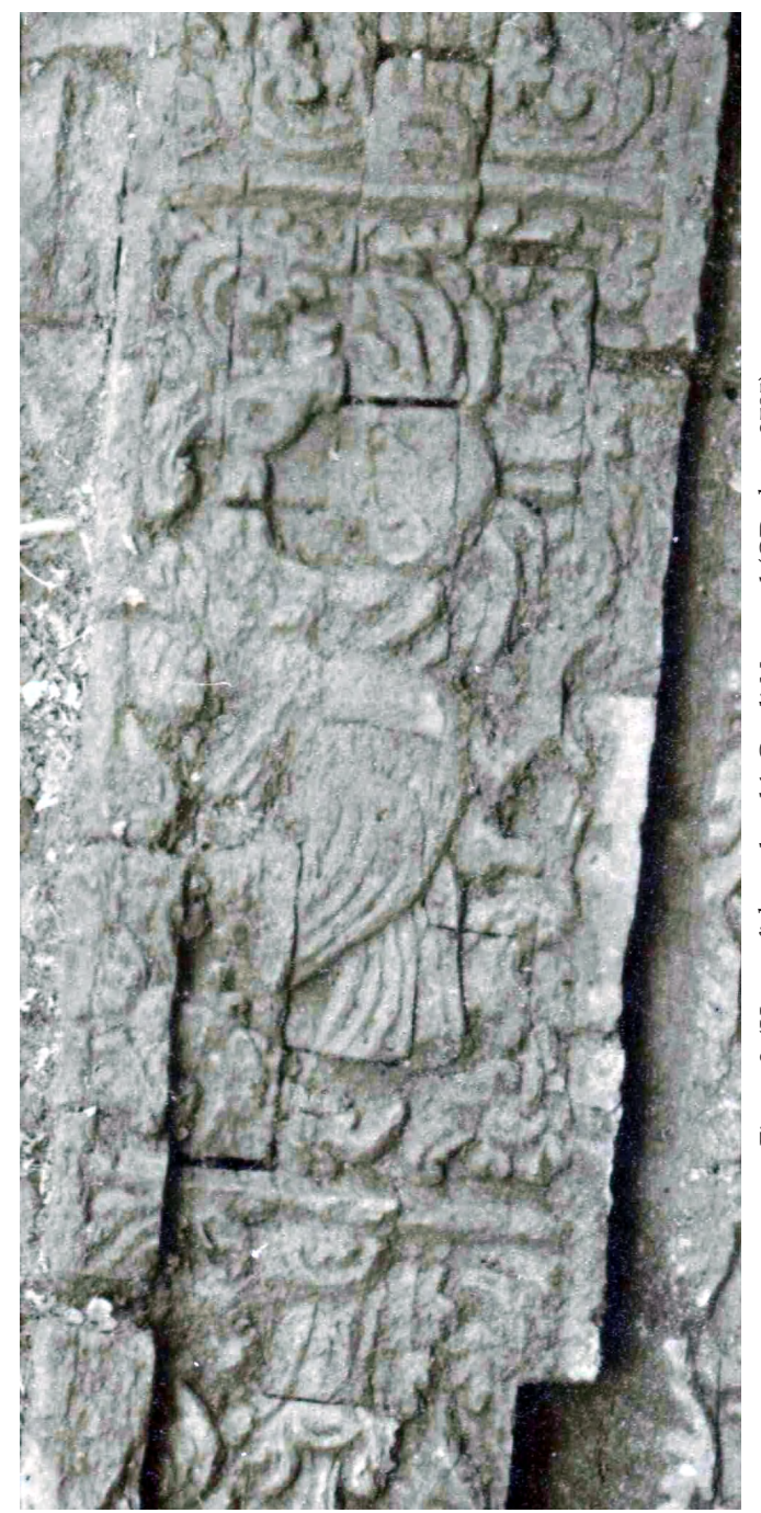
Figure 3. 'Heron, fish, and crab', Caṇḍi Ngampel (OD photo 2785)