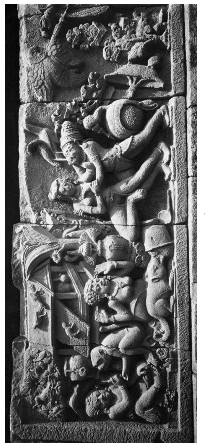
Figure 6. Rāwaṇa abducting Sītā, Caṇḍi Śiva, Loro Jonggrang