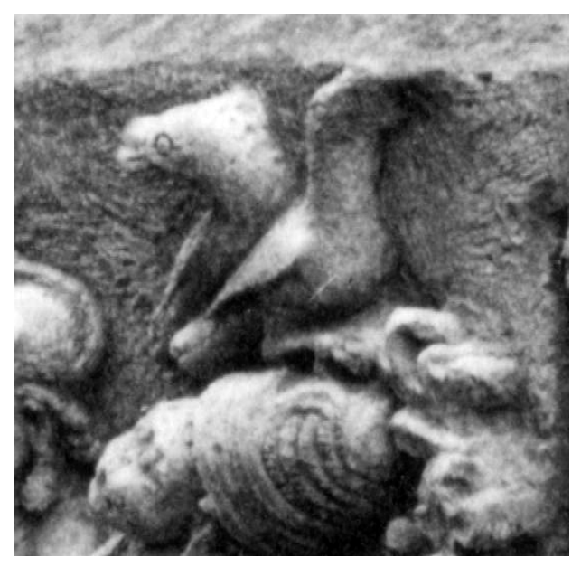
Fig 6b. Two birds standing on Rāwaṇa's headdress (detail from OD photo P-044541)