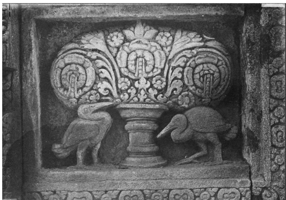
Figure 8. Herons, Caṇḍi Garuda, Loro Jonggrang (OD photo 4376)