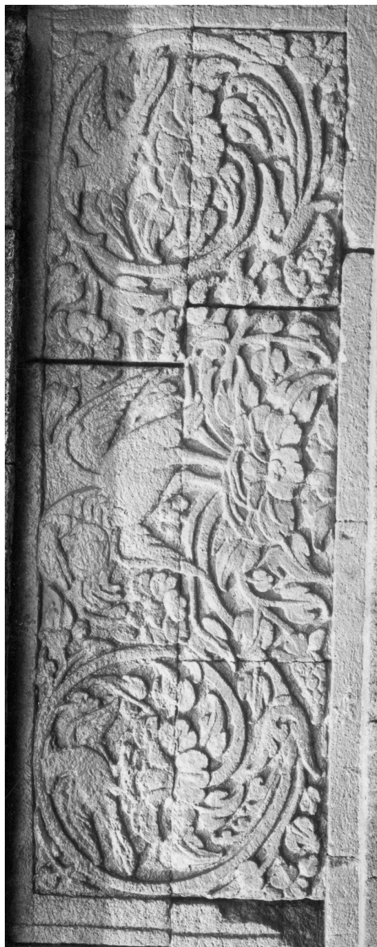
Figure 1. 'Heron, fish, and crab', Candī Mendut