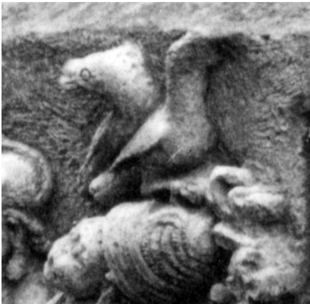
Fig 6b. Two birds standing on Rāwaṇa's headdress (detail from OD photo P-044541)