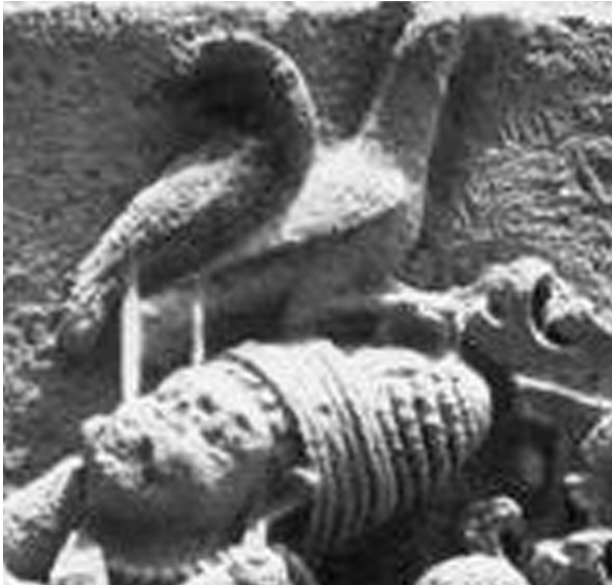
Figure 6a. Two birds standing on top of Rāwaṇa's headdress (detail from Figure 6)