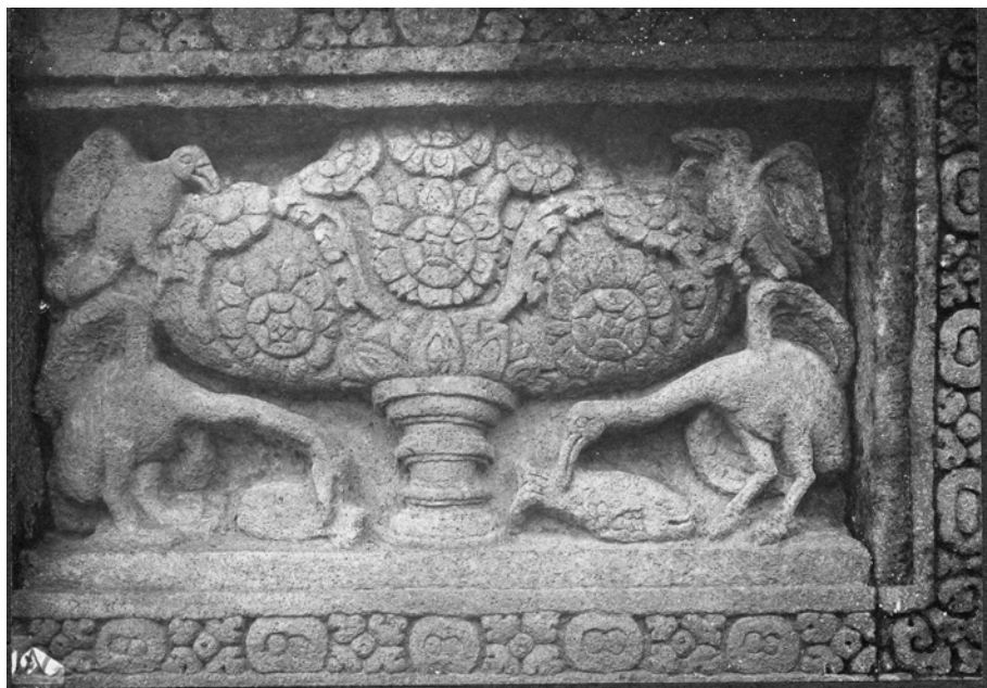
Figure 7. Fishing herons, Caṇḍi Nandi, Loro Jonggrang (OD photo 4367)