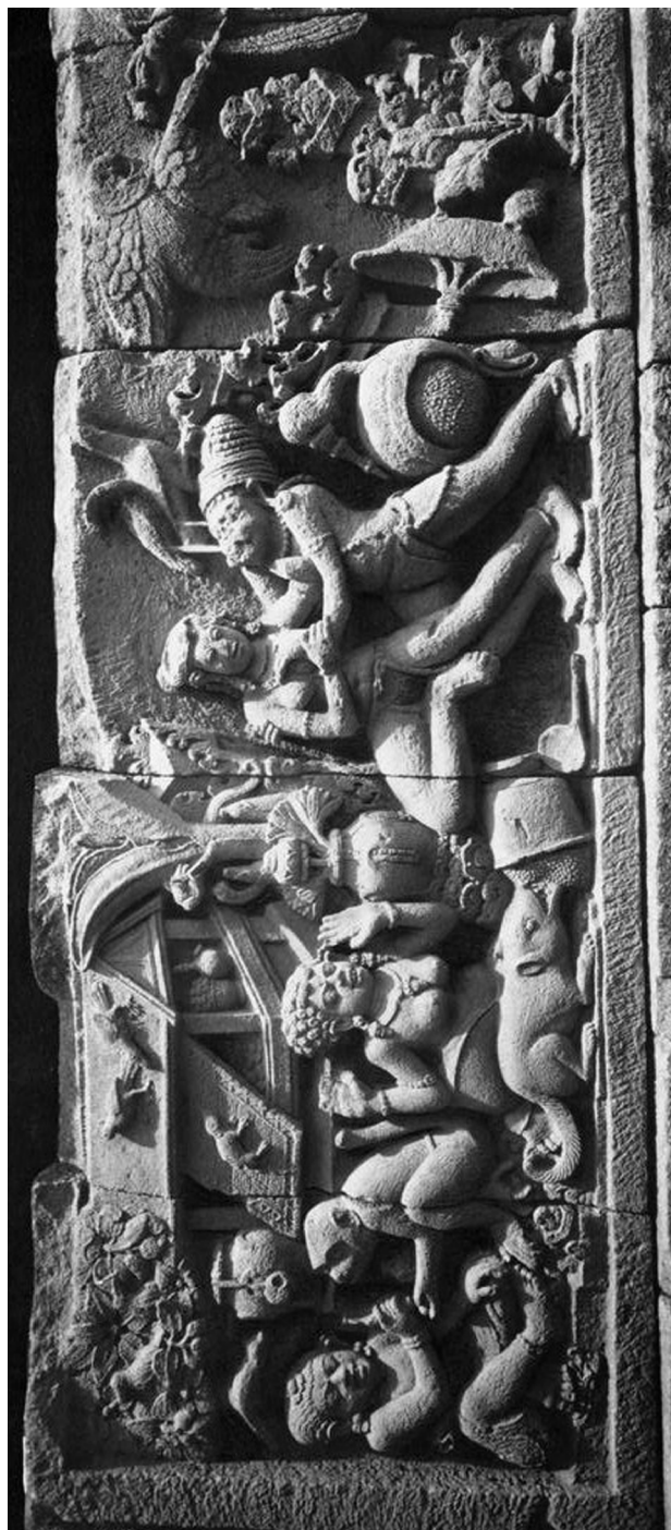
Figure 6. Ravana abducting Sita, Candi Siva, Loro Jonggrang (OD photo 3486)