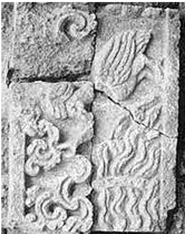
Figure 2. 'Heron, fish, and crab', Candi Jago (OD photo 68)