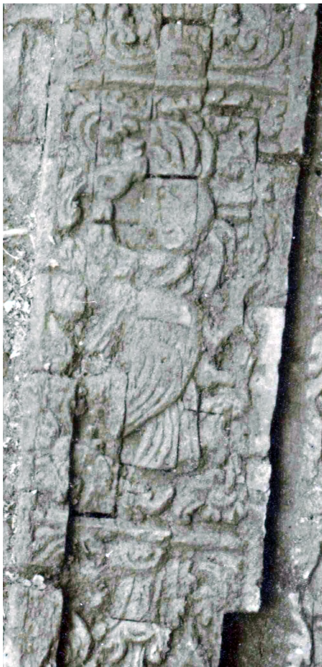
Figure 3. 'Heron, fish, and crab', Candi Ngampel (OD photo 2785)