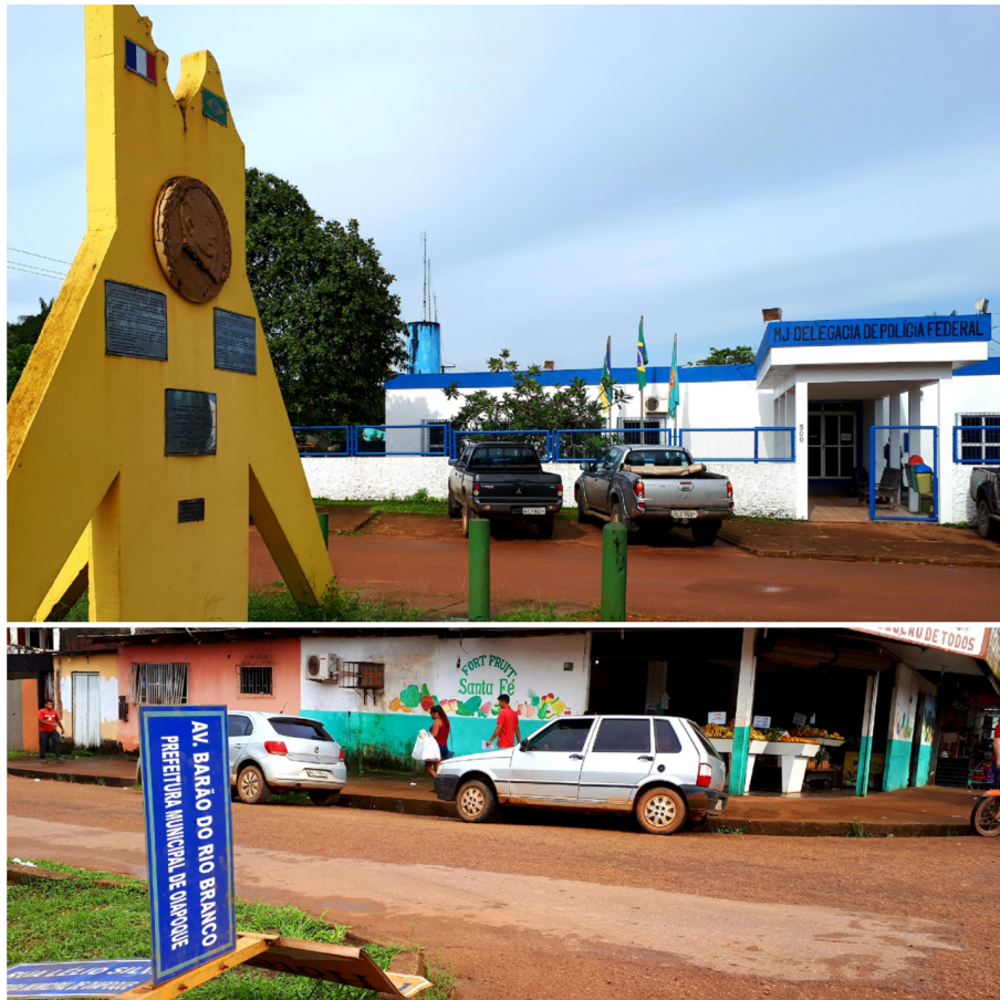
Figure 10-2. Tributes to Baron de Rio Branco at Oiapoque, Brazil