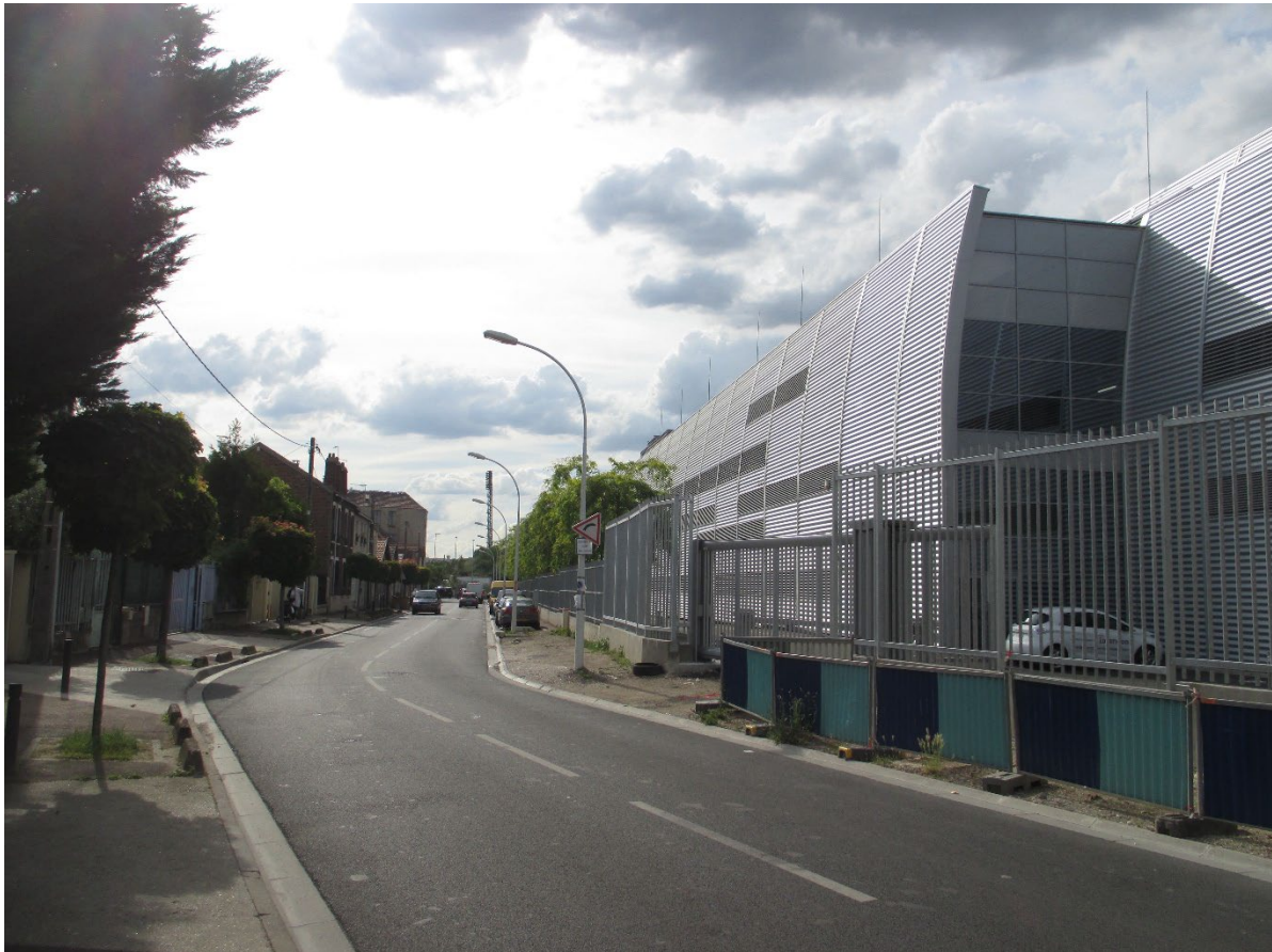
Fig. 4.1. Interxion Data Centre Par7 facing the houses of the rue Rateau.

This fieldwork snapshot is an excerpt from a 'Toxic Tour' organised by a local ecologist group. Toxic Tours are a demonstration technique (Barry 2001) used by environmental justice activists to attract attention to the correlation between polluting infrastructure and inequalities. The Toxic Tours organised in Plaine Commune aimed at showing the entanglement between climate and social and environmental inequalities, and that the territory was gridded by polluting and noisy infrastructure, motor roads, airports, and data centres which did not benefit the local citizens and caused environmental damage.