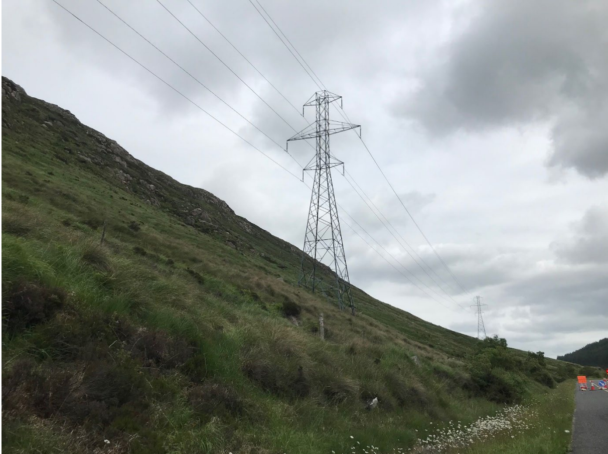
Fig. 4.5. High capacity pylons crossing the Barnesmore Gap in Donegal, Ireland.

My colleague and I were stopped at an automated traffic signal for construction on the N15 at the Barnesmore Gap in Donegal. We were not sure what the roadworks were, but I was struck the day before, when I had passed through in the other direction, towards the west coast of Ireland from the north, that a trail of high capacity overhead electrical pylons followed alongside the road, which itself followed along a decommissioned railway track, most recently under the governance of the County Donegal Joint Railways Committee from 1906 to 1960, which incorporated the earlier West Donegal Railway connecting Stranorlar in the mountainous Finn Valley with the town of Donegal closer to the West Coast. The line had first been established in the late 1800s by the British colonial authorities, who oversaw the creation of an extensive railway network connecting the reaches of the largely rural, agrarian island of Ireland, making accessible its various resources, agricultural, and labour forces.