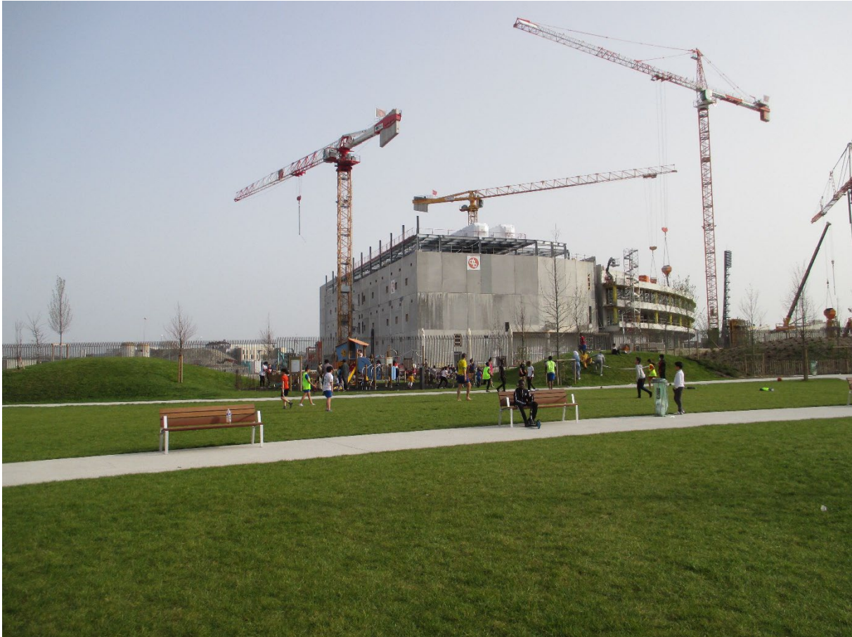
Fig. 4.3. First building (of four) of Interxion’s future data centre campus, construction site in La Courneuve, April 2021.

Europe. In a local press article, the journalist quoted an Interxion executive, asserting: ‘We are drying up the electrical capacity of the sector’ (Debruyne 2020) thus notifying its competitors that no other data centre could settle in the area, due to a lack of power in the local grid. As the biggest data centre in the area, the campus secured 130 MW of electrical capacity. Answering to local critiques, Interxion explained its willingness to ‘offer heat to whoever wanted it’ (Debruyne 2020) – without saying who would pay to build a heat network locally – invest in training for unemployed people to provide jobs for the data centre industry, and build an 8,000 m 2 park which would be retrofitted in the city.