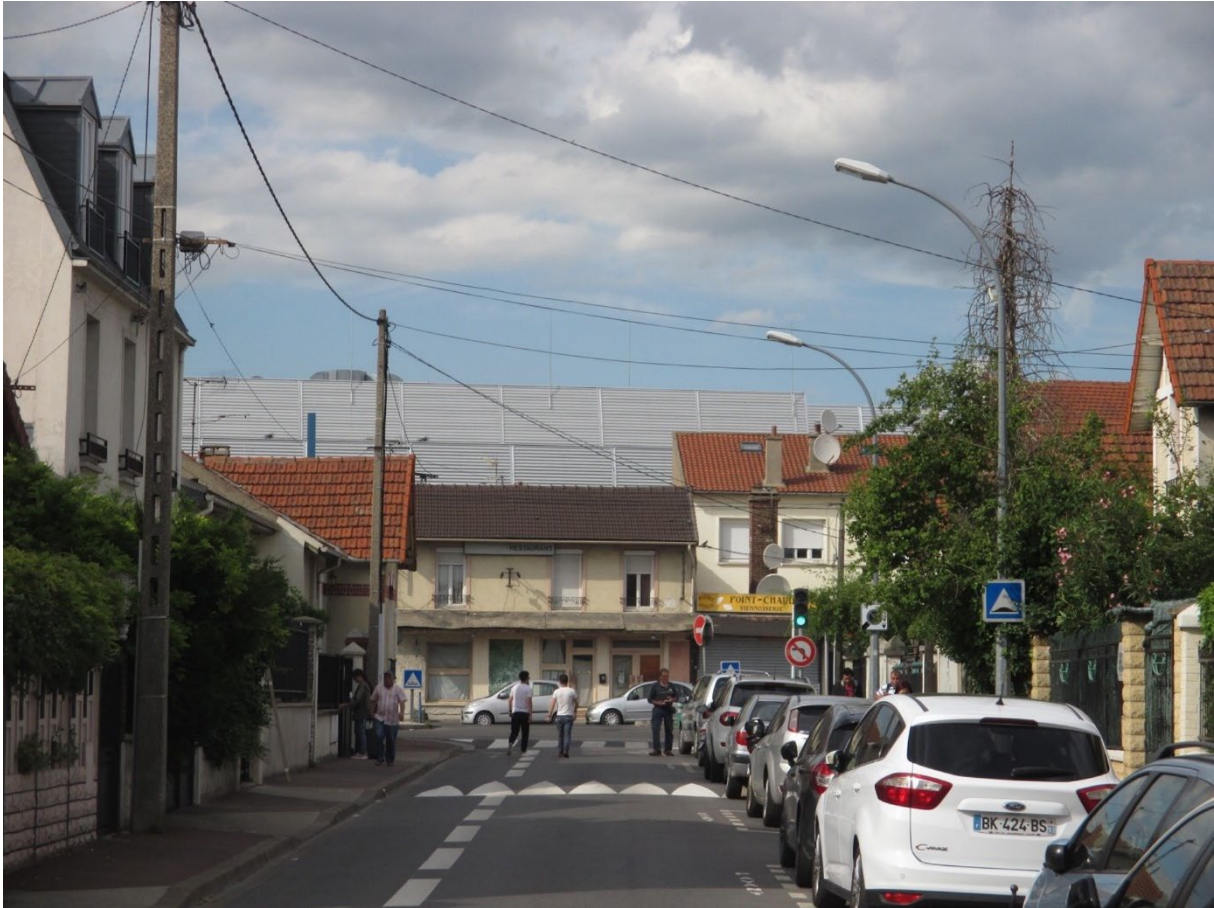
Fig. 4.2. In the background, Par7 the data centre of Interxion, overhanging the houses of the rue Rateau.

During the summer of 2013, an inquiry took place while the first half of the building was already commissioned. Residents felt cheated as they learned that the massive, ugly, and noisy building facing their home was also a potential fire hazard or could even explode. In response, they launched a petition which obtained 424 signatures, and took Interxion to court with an environmental law firm.