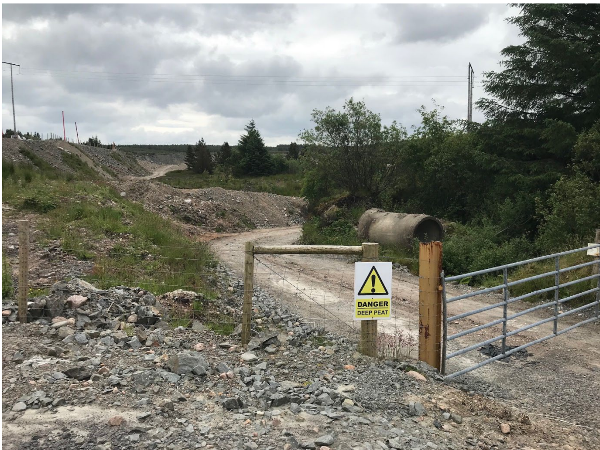
Fig. 4.6. Sign cautioning about ‘deep peat’ at the entrance to the Meenbog Wind Farm construction site in Donegal, Ireland.

We got back in the car and followed the pathway of the N15 to the Meenbog Wind Farm construction site, which was just on the other side of the construction on an access road with a small sign. We were hugging the border – only a few miles across the mountains, past the job site, was County Tyrone, in NI, and the site of the landslide. Access to the job site was restricted, unless you were a turf-cutter that needed access to the surrounding bogs to take advantage of turbarry rights. Works were meant to be halted on the site while an investigation into the cause of the landslide was ongoing, but several cars passed through the gates as we wandered. Signs marked warnings against trespassers and environmental hazards in the area as we left the site: ‘Deep peat.’