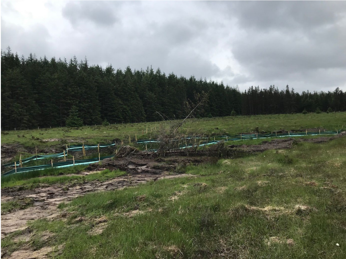
Fig. 4.7. Aftermath of the peat landslide on a bogland site crossing Donegal, Ireland and Tyrone, Northern Ireland.

Walking on the hill to observe the fallout of the landslide, which was still extremely visible more than six months after the initial slippage, I was struck by just how remarkably unsuitable for construction this land must have been. Most of the bog essentially felt like walking on a waterbed, as you bounced and could see the ripples undulate for several metres away from your feet. Occasionally the bog became even squelchier, sucking your boot into it for stepping on a patch unsupported by plant roots. This was the muck that lay underneath, from 5 to 20 m deep, storing centuries of decayed plant material in its depths. To engineer this landscape for wind farm construction required excavation through the entire peat store, to get to the more stable rock formations underneath in order to plant concrete to support the turbines.