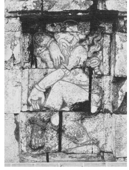
Figure 2: Loro Jonggrang, detail of relief VII.11 (note the Brahman reciting from a lontar ) (particular of photo OD 3477, Leiden University Library, Kern Institute)