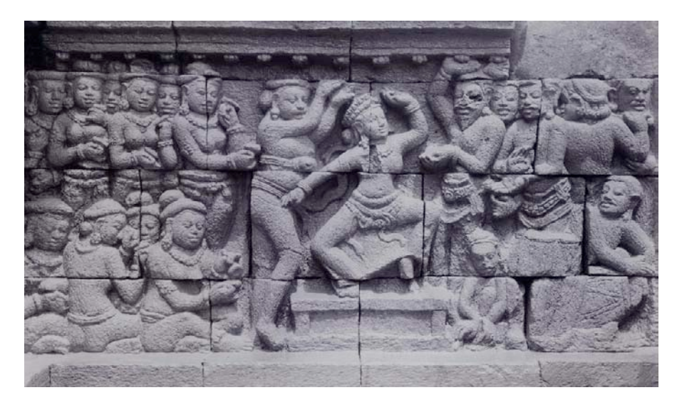
Figure 4: Female dancer, Brahman and musicians (Borobudur, B 1a 233a)