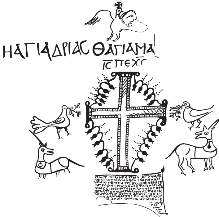
Fig. 5. Unicorns and doves (?) from the wall of a hermit's cell in Abydos (after F. Petrie et al. , Tombs of the Courtiers and Oxyrhynchos , London, British School of Archaeology in Egypt, 1925, plate LI).

not be surprising that the unicorn which hides itself from Jesus is not only demonic, but apparently Death or the Devil himself, with the golden field which lies beneath the sea representing the underworld which he rules over, 201 and the story being an unorthodox retelling of the harrowing of hell.