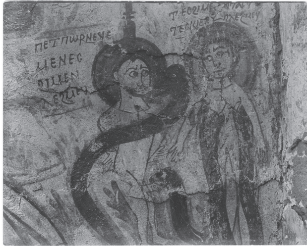
Fig. 4. Scene of sinners consumed by serpents/worms from the paintings of a church in Tebtunis (after C. C. Walters “Christian Paintings from Tebtunis”, Journal of Egyptian Archaeology , vol. 75, 1989, plate xxviii).

have had good reason to be afraid, but here the serpent is not destroyed by Jesus, but rather sent on his own mission of destruction, in the same way that serpents, scorpions, worms and demons are called against the enemies of the curses examined earlier. The word used for the creature has a specific resonance, however; as in many other cultures, the Egyptian language did not distinguish clearly between snakes, worms, and maggots, and fnt is the word used to translate the Greek skōlēx , which could refer to the “undying worm”, 183 the supernatural maggot which would eternally devour sinners in hell, as well as to the more mundane worms which would devour their corpses. But this intimate relationship need not wait for death – illnesses might be understood as infestations by fnt , 184 an understanding perhaps prompted by the observation of worm-like parasites, and maggots in necrotic flesh. 185 It is probably in this sense that