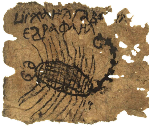
Fig. 2. A Coptic Scorpion Amulet (Vienna, Nationalbibliothek K 7110).

more complex theriomorphy of the Pharaonic artistic traditions, as manifestations of their power – the eagle, lion and bear, archetypal super-predators, represent merciless, unstoppable power, whose combination renders them more dangerous than any one of them alone; in earlier Demotic myth, the griffin Petbe was the only being capable of ending a cycle of violence which began with a lizard swallowing a fly, and ended with a lion consuming a catfish. The hybrid griffin, representing the final supremacy of the sun god and combining the attributes of all the other creatures, is the only being which can kill the lion. 45 Most interesting of all, though, is perhaps the Artemesian scorpion, whose supernatural power is called on not only to protect, but to protect from other venomous creatures of its kind.