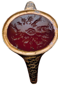
Fig. 1. An amulet depicting a scorpion and other animals attacking the evil eye (CBd-2221).

David in the flesh” and his mother, “the Holy Virgin Maria”. 42 Yet the central figure of the Artemesian scorpion seems to come from Greek mythology – it is most likely the scorpion created by Artemis to protect herself from Orion, which became the constellation of Scorpio. 43 Here the deadly apotropaic power of the scorpion is harnessed against external forces which might threaten a household – a power visibly demonstrated in late antique gems where scorpions and other dangerous creatures are shown attacking the evil eye 44 – but a power expressed specifically in terms of Hellenic mythology, and therefore an attestation of the continuing power of the texts which transmitted it even after the civic cults to deities such as Artemis would have ended.