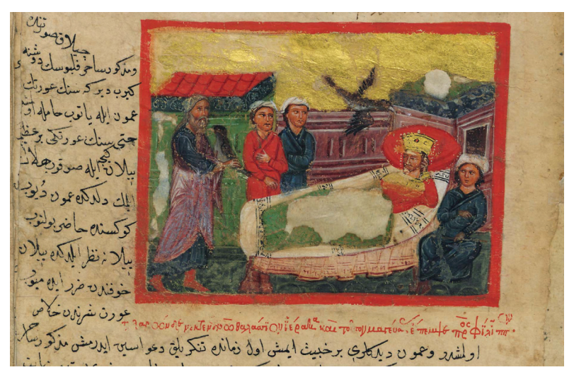
Fig. 1: Nectanebo's enchanted sea falcon sends a dream to King Phillip (Hellenic Institute of Venice, Codex 5, fol. 9v)<sup>48</sup>.

the rites of mummification. It is a term associated with this deity, hasye ,<sup>47</sup> "the blessed one", which is used to describe the animal mummies in several of the magical texts, and which we will shortly investigate in greater detail.