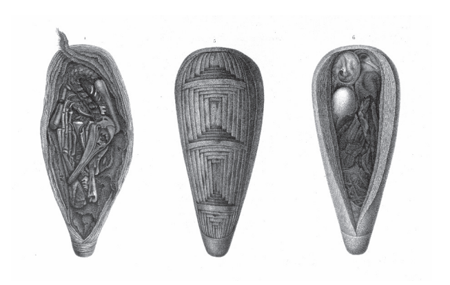
Fig. 4. Drawings of ibis mummies from Saqqara, after Commission des sciences et arts d'Égypte, Description de l'Égypte (2nd edition), Paris, C.L.F. Panckoucke, 1821, pl. vol. 2, plate 53.

animals were preferred, however; instead, they seem to have been killed when they had attained the minimum acceptable size, and a considerable amount of linen padding was often used to make them look larger. The situation seems to have been similar in the case of fish and crocodiles, generally represented by small specimens. The picture that emerges is not that of the idyllic sacred animal menageries we might imagine, but rather of an industrial process reminiscent of modern industrial farms or pet mills. The methods of mummification used is similarly industrial; while a few examples show quite beautiful results, often with polychrome wrapping which is padded to reproduce the form of the living animal, more often they are bound cursorily in plain linen, often with flesh exposed, and apparently, in particular in the case of birds, after being simply dipped in resin, a process which may itself have been the means of killing them.