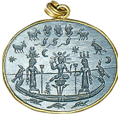
Fig. 2. A: depiction of the sun-god as Harpocrates in the solar barque surrounded by animals representing his various forms. (Ann Arbor, University of Michigan, Kelsey Museum of Archaeology, 26109.)

in particular the sun's burning heat, 101 and this may be reflected in texts which describe the sun as having the form of a donkey in the fifth or sixth hour; this would be midday, the time of the sun's greatest strength. 102