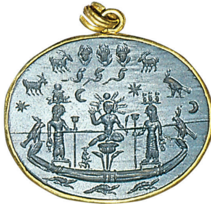
Fig. 2. A: depiction of the sun-god as Harpocrates in the solar barque surrounded by animals representing his various forms. (Ann Arbor, University of Michigan, Kelsey Museum of Archaeology, 26109.)

in particular the sun's burning heat, 101 and this may be reflected in texts which describe the sun as having the form of a donkey in the fifth or sixth hour; this would be midday, the time of the sun's greatest strength. 102