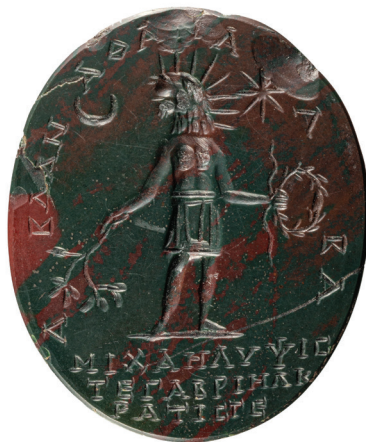
Fig. 3. A lion-headed deity on a magical gem (Staatliche Museen zu Berlin, Ägyptisches Museum inv. 9864 = CBd-221).