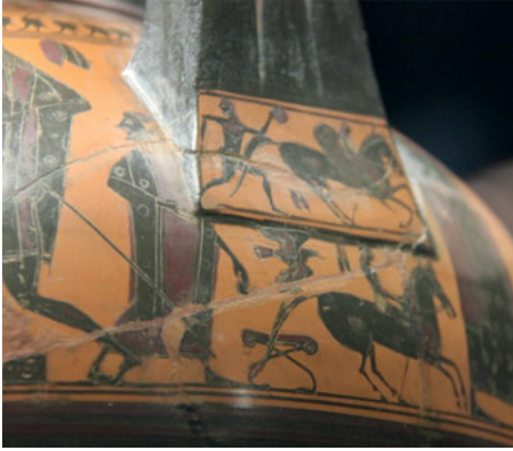
Fig. 6.2: Amphora by the Affecter, c. 540–530 BC, Paris, Musée du Louvre F19.

As mentioned above, handles posed quite a challenge for painters since they touch the upper part of the body and hence interrupt the continuum of the scenes. One of the solutions, as we just saw, was to diminish the scale of the figures; another was to depict figures who are seated. Even then, however, the result is not always satisfactory: consider an amphora in London (c. 500 BC), 20 where the handle actually overlaps the head of a warrior sitting on a block.