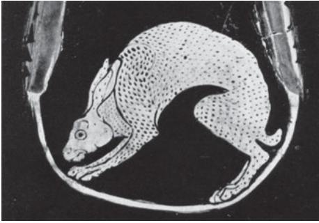
Fig. 6.3: Amphora signed by the potter Andokides and attributed to the Andokides Painter, c. 520 BC, Berlin, Antikensammlung F2159.

towards the other. In this way, although isolated, both youths guarantee the visual continuity between the two autonomous scenes. Moreover, the fact that the youths are entirely wrapped in a mantle – a visual metaphor of their aidôs , of their shyness, modesty and timidity 24 – enhances their isolation from the surroundings.