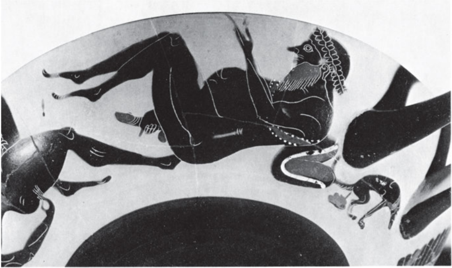
Fig. 6.8: Cup by the Amasis Painter, c. 520 BC, Boston, Museum of Fine Arts 10.651.

and, on the reverse, Hermes, Heracles and Athena harnessing a chariot. An ivy leaf stands beneath one handle, a grasshopper or a locust ( akris ) 71 beneath the other. Both of the insects are enlarged. The presence of the ivy leaf has a clear-cut meaning: it is a Dionysian sign, accentuating the cup's use in the symposium. The presence of the grasshopper (which looks on towards the Centauromachy scene) is less easy to explain. It may be that the insect gives the scene a natural context, rather like the tree depicted behind Heracles. The fact that the grasshopper stridulates, 'sings' and 'makes music with its wings' 72 may further explain this placement: after all, Attic viewers termed the handles of vases 'ears' ( ta ôta in ancient Greek). 73 Finally, because it eats plants, the grasshopper may convey an idea of destruction and harm, 74 a very suitable idea given the Centauromachy scene of our cup.