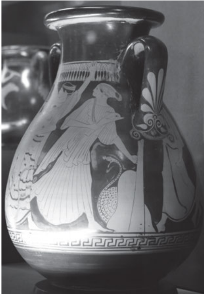
Fig. 6.4a: Pelike in the manner of the Lenin-grad Painter, c. 450–425 BC, Paris, Musée du Louvre G 373.