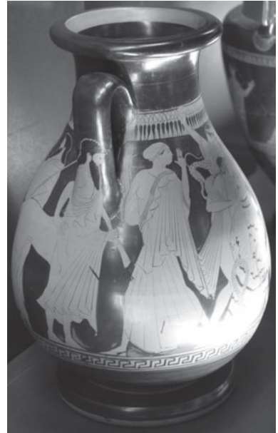
Fig. 6.4b: Other side of the same pelike.

depicted a rock and a coiled snake (Fig. 6.4a). A palmette is painted on the lower part of the handle, as is usually the case on pelikai: it has no figural or semantic function. It is interesting, though, that its spotted border (a singular occurrence, so far as I know) recalls the snake's skin and the panther's coat: all of them create an effect of poikilia , that is of a variegated impression. 33 Even more interesting is the scene on the other side of the vase, where Thetis' sisters run to the altar (and to the figure of Nereus who stands beside it). The scene ends with the figure of Cheiron, whose torso is actually depicted on the handle so as to project out from the pelike's contained pictorial field (Fig. 6.4b). Once again, the arrangement has a real three-dimensional effect: as viewers, we have the impression that the centaur is closer to us, emerging out of the vase. It should also be noted that, while the figure of the centaur overlaps the handle, on the other side, it is the handle that overlaps the Nereids.