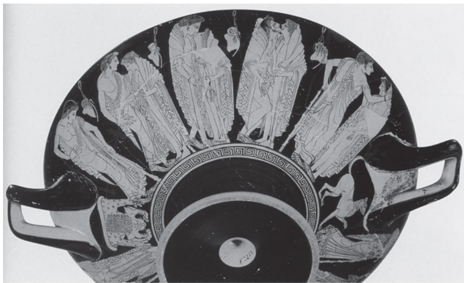
Fig. 6.7: Cup signed by Peithinos, c. 500 BC, Berlin, Antikensammlung F2279.

All these elements create a visual richness, encouraging the viewer to engage in a detailed examination of both scenes.