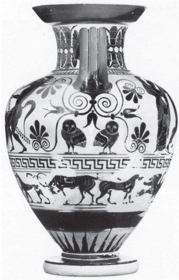
Fig. 6.1: Amphora in the manner of Exekias, c. 520 BC, Bochum, Kunstsammlungen der Ruhr-Universität S1089.

to the Amasis Painter (c. 520–515 BC), it is the god himself who holds the vegetal frame under each handle – an ivy branch in one hand, and a vine branch in the other. 14 In order to fit within the space, Dionysus is depicted to a smaller scale. He strides to the left but turns his head to look back, and in such a way as to relate to both scenes – one side representing a warrior's departure, the other Athena in conversation with a bearded man (perhaps Poseidon). 15