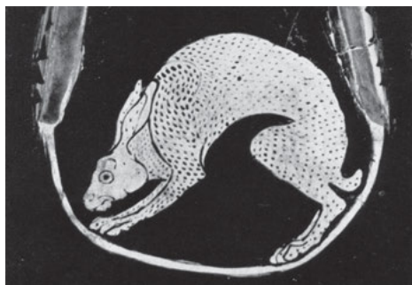
Fig. 6.3: Amphora signed by the potter Andokides and attributed to the Andokides Painter, c. 520 BC, Berlin, Antikensammlung F2159.

towards the other. In this way, although isolated, both youths guarantee the visual continuity between the two autonomous scenes. Moreover, the fact that the youths are entirely wrapped in a mantle – a visual metaphor of their aidôs , of their shyness, modesty and timidity 24 – enhances their isolation from the surroundings.