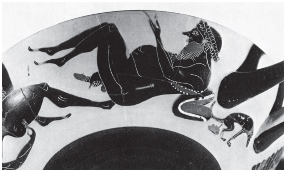
Fig. 6.8: Cup by the Amasis Painter, c. 520 BC, Boston, Museum of Fine Arts 10.651.

and, on the reverse, Hermes, Heracles and Athena harnessing a chariot. An ivy leaf stands beneath one handle, a grasshopper or a locust ( akris ) 71 beneath the other. Both of the insects are enlarged. The presence of the ivy leaf has a clear-cut meaning: it is a Dionysian sign, accentuating the cup's use in the symposium. The presence of the grasshopper (which looks on towards the Centauromachy scene) is less easy to explain. It may be that the insect gives the scene a natural context, rather like the tree depicted behind Heracles. The fact that the grasshopper stridulates, 'sings' and 'makes music with its wings' 72 may further explain this placement: after all, Attic viewers termed the handles of vases 'ears' ( ta ôta in ancient Greek). 73 Finally, because it eats plants, the grasshopper may convey an idea of destruction and harm, 74 a very suitable idea given the Centauromachy scene of our cup.