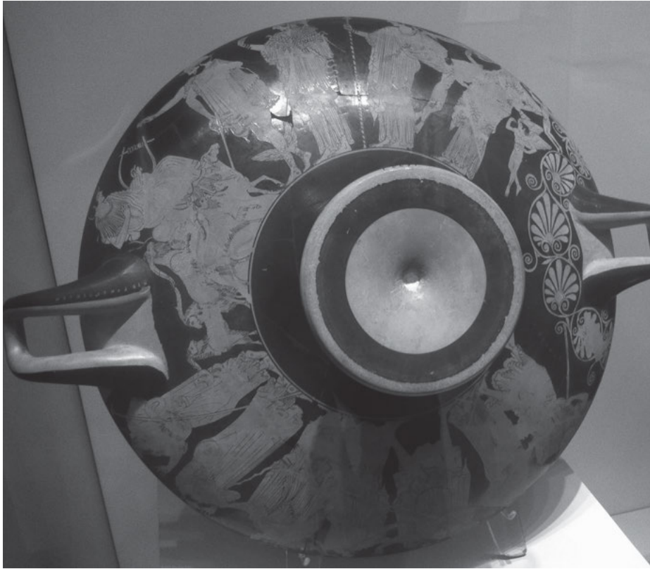
Fig. 6.9: Cup by Makron, c. 490–480 BC, Berlin, Antikensammlung F2291.

rest of the vase is decorated with an abstract ‘textile’ pattern. 89 The Beldam Workshop and the Marlay Group particularly favour this kind of ornamentation. Thus, a skyphos by the Beldam Workshop (c. 450 BC) 90 is mainly decorated with the abstract pattern of a chequerboard, complete with a laurel wreath on the rim, a frontal owl below the vertical handle and a panther and two birds below the horizontal handle. A cup attributed to the Lid Painter (c. 440–430 BC) 91 is decorated with a panel of lozenges flanked by two panels of inverted black lotus buds while the handle area is occupied by a goat in silhouette. In these cases, should the motifs be designated as ‘superfluous’, ‘accessories’ or ‘peripheral’? Indeed, how do the motifs of the handle zone relate to the design of the main part of the vase?