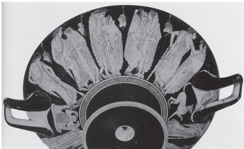
Fig. 6.7: Cup signed by Peithinos, c. 500 BC, Berlin, Antikensammlung F2279.

All these elements create a visual richness, encouraging the viewer to engage in a detailed examination of both scenes.