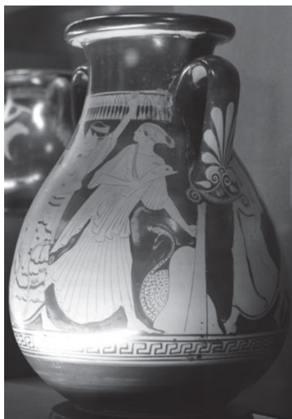
Fig. 6.4a: Pelike in the manner of the Lenin-grad Painter, c. 450–425 BC, Paris, Musée du Louvre G 373.