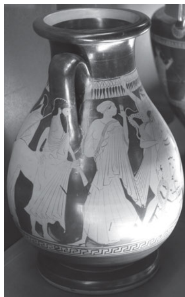
Fig. 6.4b: Other side of the same pelike.

depicted a rock and a coiled snake (Fig. 6.4a). A palmette is painted on the lower part of the handle, as is usually the case on pelikai: it has no figural or semantic function. It is interesting, though, that its spotted border (a singular occurrence, so far as I know) recalls the snake's skin and the panther's coat: all of them create an effect of poikilia , that is of a variegated impression. 33 Even more interesting is the scene on the other side of the vase, where Thetis' sisters run to the altar (and to the figure of Nereus who stands beside it). The scene ends with the figure of Cheiron, whose torso is actually depicted on the handle so as to project out from the pelike's contained pictorial field (Fig. 6.4b). Once again, the arrangement has a real three-dimensional effect: as viewers, we have the impression that the centaur is closer to us, emerging out of the vase. It should also be noted that, while the figure of the centaur overlaps the handle, on the other side, it is the handle that overlaps the Nereids.