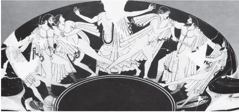
Fig. 6.6: Cup by the Brygos Painter, c. 490–480 BC, London, British Museum E69.

motifs in joining the two sides of a vase together is nicely illustrated by the exterior of a cup signed by Peithinos (c. 500 BC) that depicts a series of erotic encounters (Fig. 6.7). 55 While a hunting dog beneath one handle guides the viewer's eye from the side of homosexual wooing to the side of heterosexual courtship, an elaborate stool – covered by a lion skin – marks the end of the scene beneath the opposite handle. Both elements are signs that affirm the social status and wealth of the male lovers. 56 Furthermore, the dog and the lion skin suggest that amorous courtship is itself a kind of hunt: the object of desire, girl or boy, is likened to a wild animal that the lover, as predator, has to capture. 57 By extension, it is worth noting that the interior of the cup represents the wrestling match between Peleus and Thetis (who tries to escape her attacker by taking the form of a snake and a lion, the latter clearly echoing the lion skin on the cup's exterior).