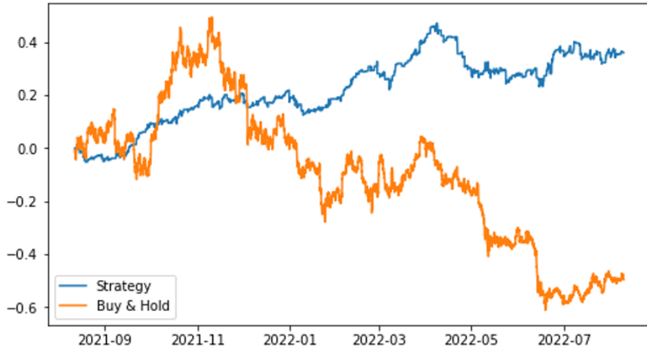
Figure 3. Model Performance in Test set

From the two figures, we can see the model outperformed the benchmark and there are way less downtrends and drawdowns during the both period. The cumulative return of the strategy also increase steadily and does not come from only a few single trades or some specific period.