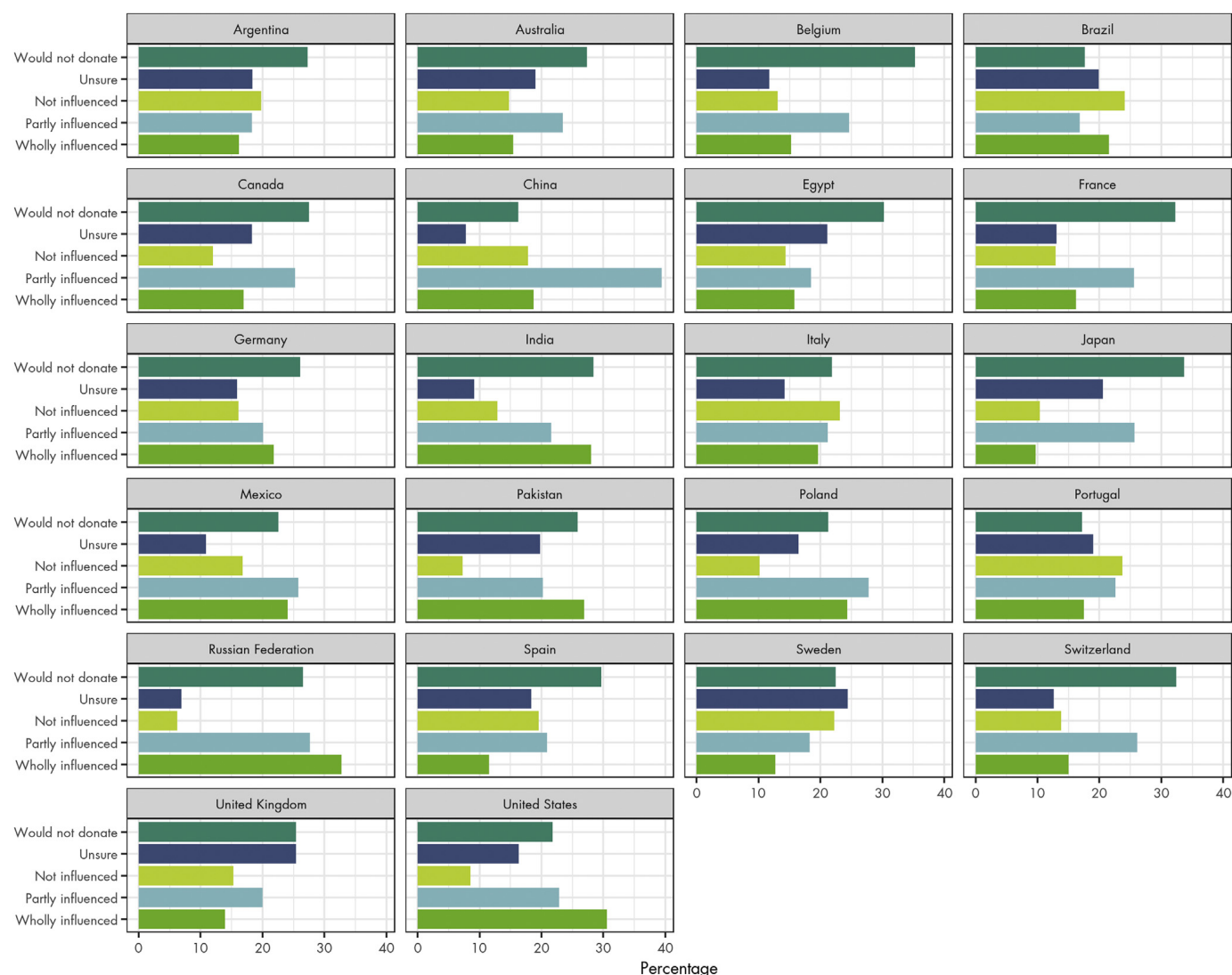
Figure 1 Influence of return of results on the willingness to donate data by country of residence.

Russia, and Switzerland had significantly lower odds of being unsure.