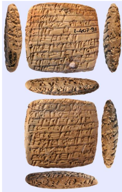
Fig. 12.7 Photo of Kt 93/k 462

In this example, the 10- mana weight being used is lighter by 10- gin , a discrepancy of 1.66 per cent. The following text shows a smaller discrepancy of 0.83 per cent, since the 1- mana trade colony weight is lighter by 1/2- gin (Fig. 12.7): 59