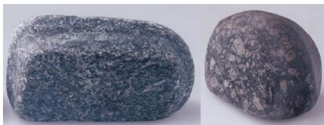
Fig. 12.10 The presumed Assyrian and Anatolian mana.

Among all these many weights, only two could form a pair corresponding to the Mesopotamian mana and to the Anatolian mana ; both date to level II (nineteenth century) of the lower city (Fig. 12.10).