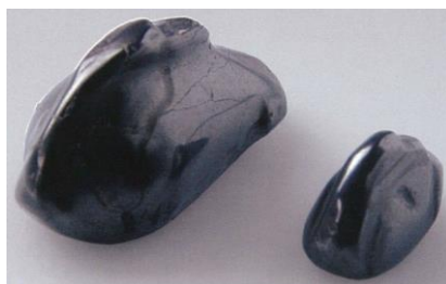
Fig. 12.11 Two weights in the shape of ducks.

Kt y/k 93 (1.9 g): 1/4 (?) Mesopotamian gin (which, based on the Mesopotamian mana , should weight 2 g).