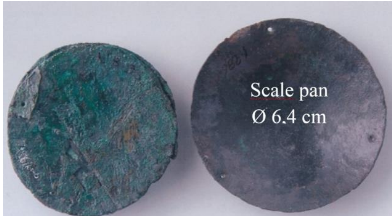
Fig. 12.4 Scale pans from Kulakoğlu & Kangal 2010, nos. 404-405

graves at Kültepe dating from the nineteenth and eighteenth centuries. They are made in copper, are round and convex, and pierced by four holes. Their relatively small size – diameter between 5.7 and 8.3 cm – implies that, if they correspond to real scales, they were used only to weigh small quantities. 43 Their discovery in merchant graves naturally bears witness to the importance of weighing for this profession (Fig. 12.4).