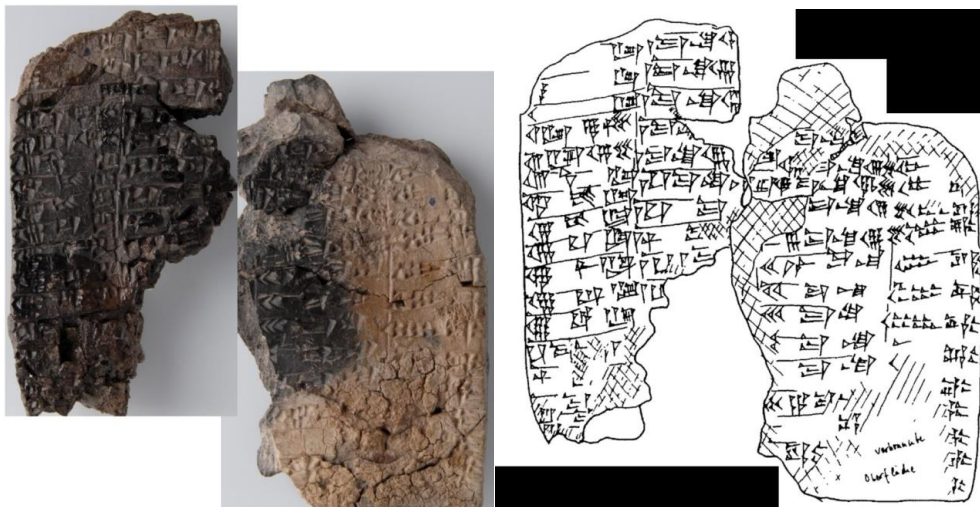
Fig. 12.1 Photo of the obverse of Kt t/k 76+79

A list of metals and metal objects makes up only nine lines (v 1-9) and lists gold, iron, tin, copper and bronze (silver is curiously lacking) and the names for various vessels and cauldrons in bronze and copper. 20 The list of stones is much longer, at least forty lines (from v 10 to possibly part of column vii). It starts with semi-precious stones, like lapis lazuli, carnelian and rock crystal (?), and progresses to more common ones, such as grindstones. 21 The last two columns, which are much too fragmentary to be transliterated, enumerate a number of plants (Figs 12.1 and 12.2).