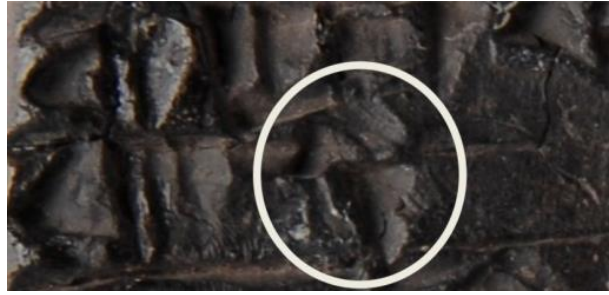
Fig. 12.3 Sign created for 1/8

After 19 5/6 gin , the scribe continues with an arithmetic progression of mana , starting with 1/3 mana (= 20 gin ), using the classic sequence of fractions: 1/3, 1/2, 2/3, 5/6 (thus from 10 to 10 gin up to 1 mana ). The end of column i and the beginning of column ii are destroyed, but may be easily restored: the sequence of weights follows a progression of units of 1 gin (as in column i).