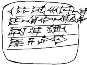
Fig. 12.6 Copy of VS 26, 134 by K. R. Veenhof

8 mana of silver (weighed) by my 1- mana weight, certified (weight). 56