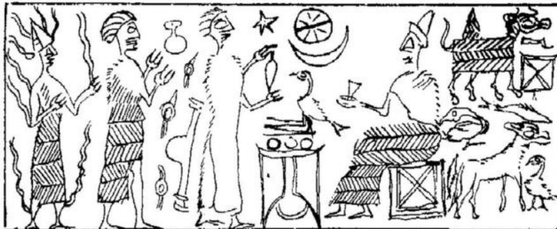
Fig. 12.5 Seal imprint Ka 82, seal A on the envelope KTS 1, 45a

A weighing scale is visible on a cylinder-seal imprint on a loan contract envelope found in the lower city of Kaneš. Behind a woman holding a spindle, the visible part of the scale is the beam from which the scale pans hung (Fig. 12.5). 44