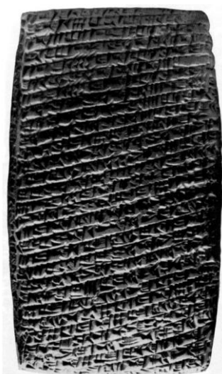
Fig. 12.8 Photo of Kt u/k 3 in Özgüç 1986, pl. 60.1

The Anatolian standard mana , called aban mātim ‘weight of the country’, was a little lighter than the Mesopotamian mana . A letter dated to the eighteenth century gives a metrological correlation between both standards as follows (Fig. 12.8) : 60