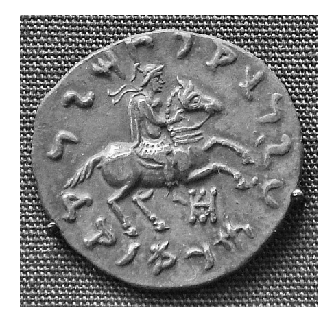
Fig. 13. Philoxenos on prancing horse performing the mano cornuta . British Museum London. wikipedia.orgwikiPhiloxenusAnicetus #mediaFilePhiloxenusCoin2.JPG.

In any case, the Greek legends ( theos ) of coinages proclaim the deification of some sovereigns, beginning with Antimachos I (and retrospectively on commemorative later coins).<sup>64</sup> For the Indian legends the situation is more complicated (see below). They look very important, being used by Agathocleia and Strato (our no. 4) and by Machene and Maues (our no. 14), but, as seen above, its exact meaning is not totally clear. Nevertheless, their coins and the epithet theotropos are especially noteworthy in a study on heroization/ deification, even if it is not decisive, the meaning being possibly "turning towards god" and not definitely "of divine character."<sup>65</sup>