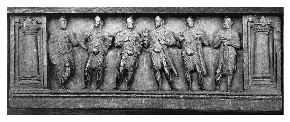
Fig. 6. Gandhāra relief depicting Indo-Scythian men. Formerly in the Peshawar Museum. After Bromberg 1991, p. 50, fig. 9; Marshall 1960, fig. 46.

tunic presents a cantharus to a woman who is dressed in chiton and himation and wears a collar and a spiraled bracelet. On her right, another bearded male shown in a short tunic, his right arm naked, clearly addresses the gesture of mano cornuta to the woman on the right. He holds a long leaf (not a palm) resembling the Asplenium scolopendrium var. scolopendrium or other similar fern of wet, aquatic milieus.