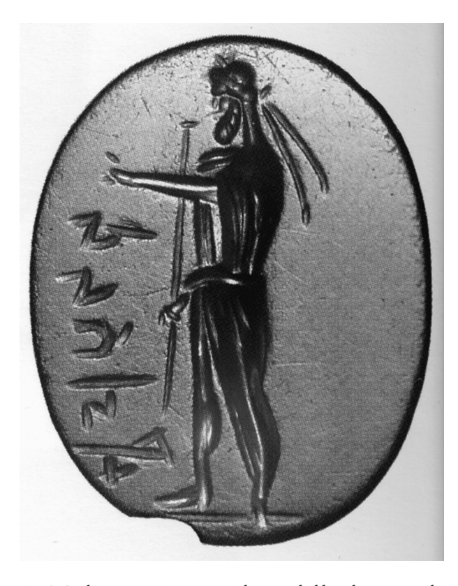
Fig. 9. Seal representing Zeus with extended hand gesture. Bibliothèque Nationale Paris Cabinet des Médailles. After Bopearachchi et al., Ind-Ox, no. 144.

in the perspective of a possible heroization/ deification of sovereigns, beside the inscribed epithets.<sup>57</sup>A similar armored standing soldier/ king is represented on a pair of gold pendants from Tillya Tepa, holding a spear and a shield, and wearing a helmet and a diadem (fig. 11). He is shown within a decorative frame representing a dragon, plants and birds, shaping a sort of nais kos .<sup>58</sup> Various attempts have been made to identify this soldier with a king, Ares or Alexander the Great.<sup>59</sup>