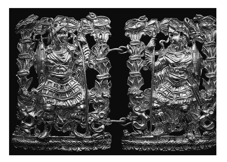
Fig. 11. Plaque with Greek armored king possibly deified. Tillya Tepa, Kabul National Museum of Afghanistan. After Sarianidi 1985, pl. 82, p. 141.