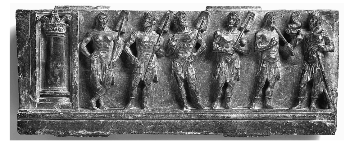
Fig. 3. Gandhāra relief depicting aquatic deities. The Metropolitan Museum, New York. MetDP138046, Rogers Fund, 1913, accession n° 13.96.21.