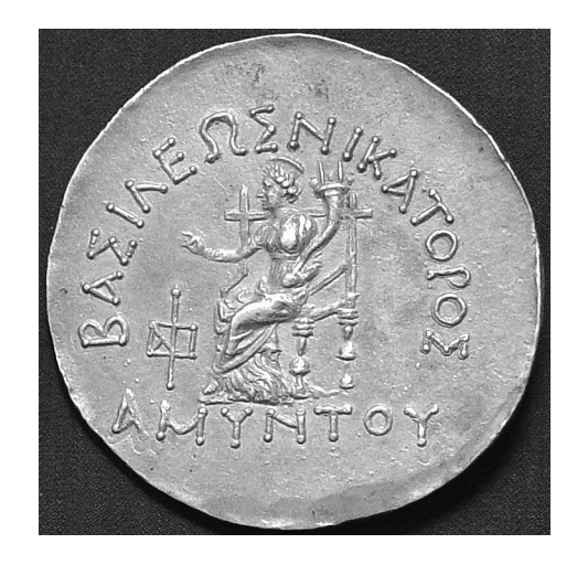
Fig. 1. Enthroned Tyche with cornucopia, performing mano cornuta gesture. Amyntas double decadrachm from the Qunduz hoard. National Museum of Afghanistan Kabul.