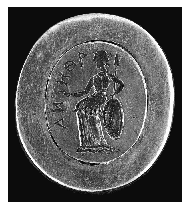
Fig. 10. Seal representing Athena with extended hand gesture. Tillya Tepa. Kabul National Museum of Afghanistan. After Sarianidi 1985, pl. 108, p. 168.

If we consider the goddesses on other plaques that are also represented in three-storey frames shaping a pseudo- naiskos at Tillya Tepa,<sup>60</sup> and if we remember that a warrior figure with shield, sword and spear is also represented on some coins of Kujula Kadphises (fig. 12)<sup>61</sup> that have been compared with our plaque with "a Greek soldier" from Tillya Tepa, the "soldier" actually appears as a king, recognized as a "possible deified king."<sup>62</sup>