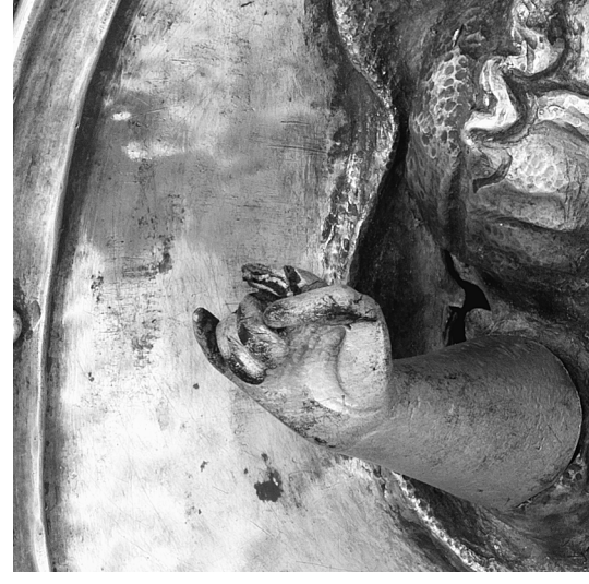
Fig. 2b. Detail of hand.