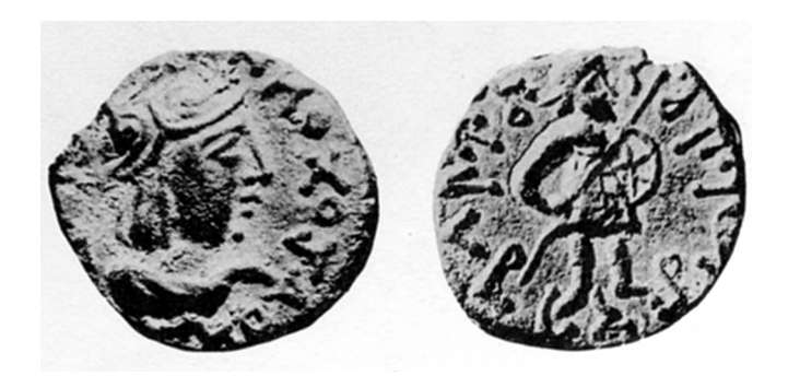
Fig. 12. Bronze coin of Kujula Kadphises with Greek armored king. After Rosenfield, 1967, coin no. 8.

two fingers seem visibly extended,<sup>63</sup> the details of the fingers are generally unclear.