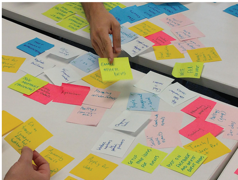
Figure 1. Participants work to organize their taskscape Post-It notes into emergent categories.

We organized these tasks into four categories, relating broadly to game-related activities; outreach, networking, and promotional activities; business and finance-related activities; and management-related activities (Table 1). The broad range of activities is noteworthy in itself,