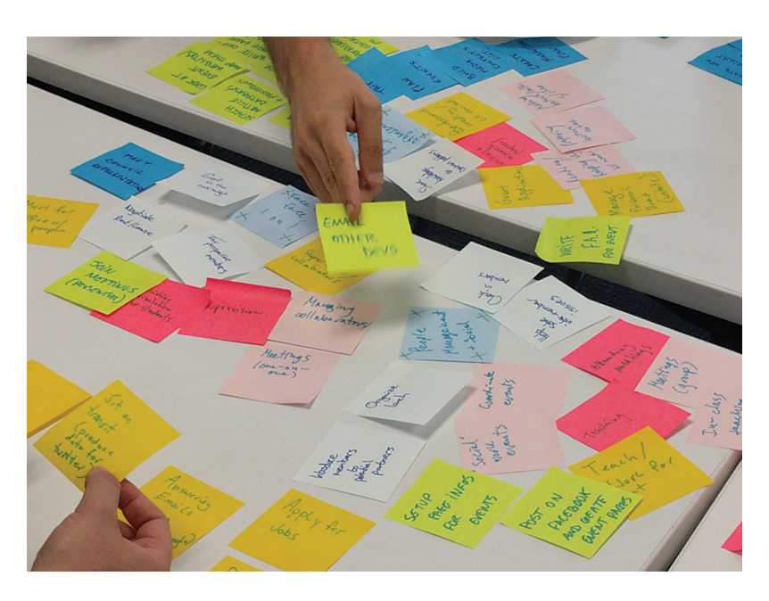
Figure 1. Participants work to organize their taskscape Post-It notes into emergent categories.

We organized these tasks into four categories, relating broadly to game-related activities; outreach, networking, and promotional activities; business and finance-related activities; and management-related activities (Table 1). The broad range of activities is noteworthy in itself,