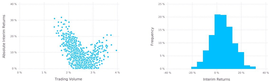
Figure 2: The graph in the left panel plots abnormal trading volume in relation to (interim period) absolute returns for asset 1 for a thousand draws of public signals. The graph in the right panel shows the frequency distribution of (interim period) returns for asset 1.

We now provide the numerical exercise that reports data, as shown in Figure 2, on interim returns and abnormal trading volume generated by simulated signals in a calibrated dynamic economic equilibrium (see Appendix A for details on the parametrization used to simulate signals). The graph in the left panel of Figure 2 shows substantial abnormal trading volume which is relatively unvarying – staying within a narrow band of the 2%-3% of the aggregate endowment and accompanied by both low and high (interim period) absolute returns. Prices may spike or dive following public signals, but more often than not the price changes are modest (see the graph in the right panel of Figure 2). Hence, echoing the observation of Kandel and Pearson (1995), the more frequent occurrence is relatively small interim period returns accompanied by 2%-3% abnormal trading volume.