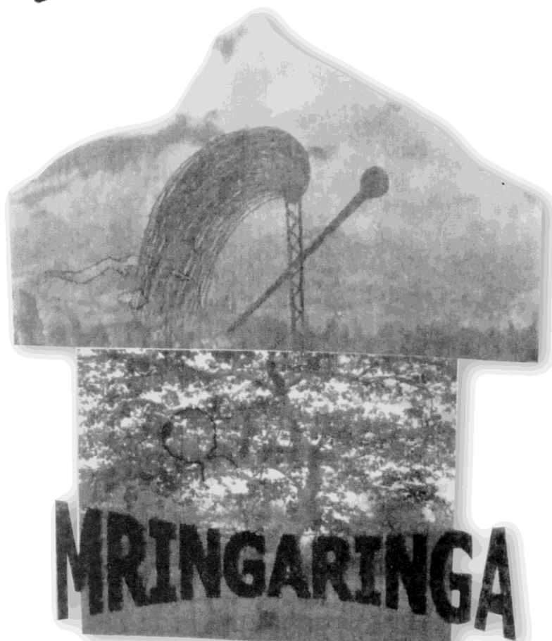
Figure 2. Cover page of 2008 Constitution

In addition to the care lavished on the cover, a summary on the first page lists the 89 points addressed, and provides references to the paragraphs and pages concerned. From a formal point of view, this Constitution is therefore more carefully presented and better structured than the previous texts. Its contents are also clearer and more detailed.