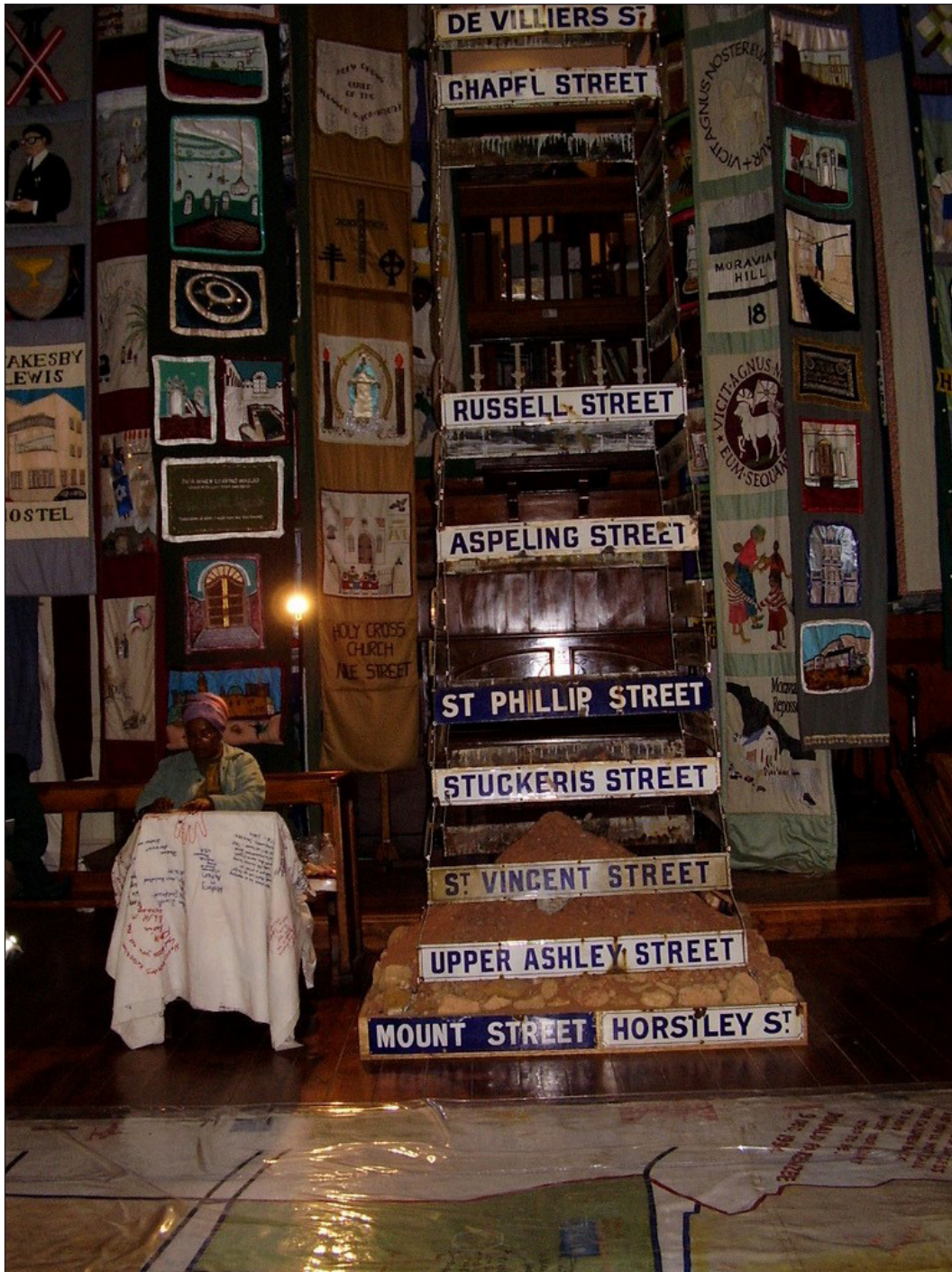
Figure 1. Inside the District Six Museum

Interior detail of the District Six Museum permanent exhibition at the pulpit in the old Methodist slave church, where now hang the street signs and rubble from the bulldozed urban landscape. The Memory Room is situated behind the railings visible at the street sign for Russell Street. A detail of the famous street map is visible on the floor, as is a member of the curatorial team embroidering the messages of its thousands of visitors on a memorial cloth. Daily occurrences of oral storytelling by guides and ex-residents, musical and literary performances and gatherings of ex-residents have all been recorded and archived in these spaces.