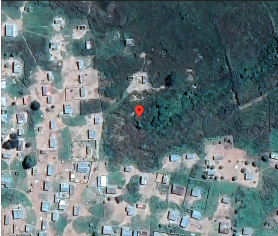
Caçulama location (on Google Map)

After “Map of transnational connections,” Global Soldiers in the Cold War . University of Oxford. https://global-soldiers.web.ox.ac.uk/research-map . https://goo.gl/maps/VoyNZ7ziGyfHtk3YA .