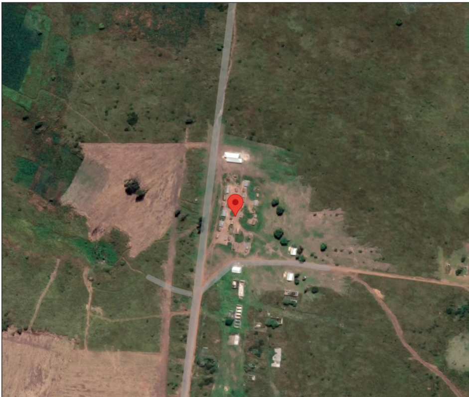
Camalundu location (on Google Maps)

After “Map of transnational connections,” Global Soldiers in the Cold War . University of Oxford. https://global-soldiers.web.ox.ac.uk/research-map . https://goo.gl/maps/VoyNZ7ziGyfHtk3YA .