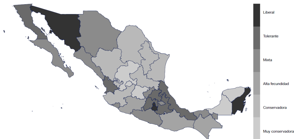
Figure 1. Regions in Mexico based on family formation patterns.

With indicators suggesting a slower transition are the High Fertility and Very Conservative regions. The first (Chiapas, Michoacán, Oaxaca) maintains high offspring due to very early unions and short spacing between children, in addition to lower contraceptive use during the reproductive life of couples. Meanwhile, the second adheres to the traditional reproductive model, with a predominantly civil and religious marriage, delayed birth of the first child and relatively short intervals between successive births, until reaching a large family size, since 57% of the women who had a third child have a fourth child and 52% of the women who had four children have a fifth child.