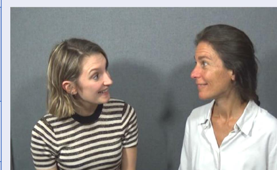
Fig. 1. Sample dialogues presented to children.