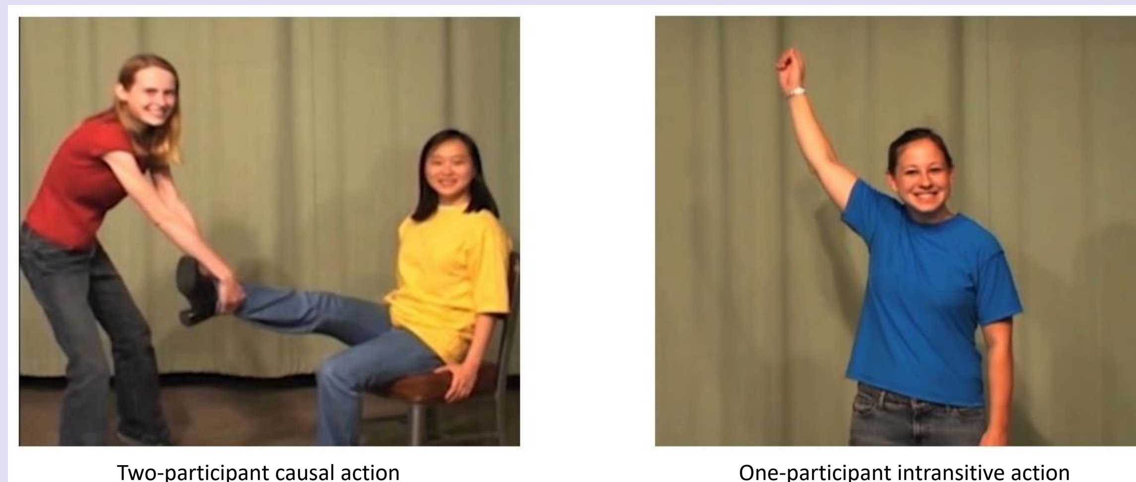
Fig. 2. Videos from the test phase (8s). On the left, the two-participant causal action; on the right, the one-participant intransitive action.